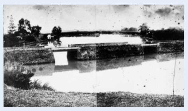
Tāmaki Bridge, Ōtāhuhu, ca 1910

Tāmaki Bridge first opened in 1851. It was originally built as dry-stone scoria piers connected by wooden platforms. The bridge was substantially rebuilt in 1859.