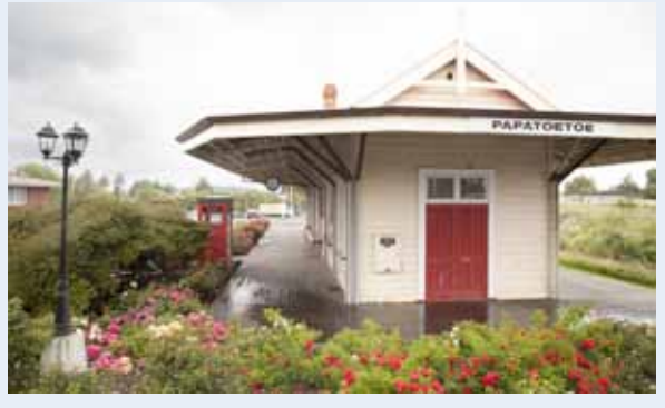
Relocated Papatoetoe Railway Station, 2012

The former Papatoetoe Railway Station was shifted to this site in December 1999, restored by members of the Papatoetoe Railway Station Preservation Trust and formally reopened for community use on 31 October 2004.