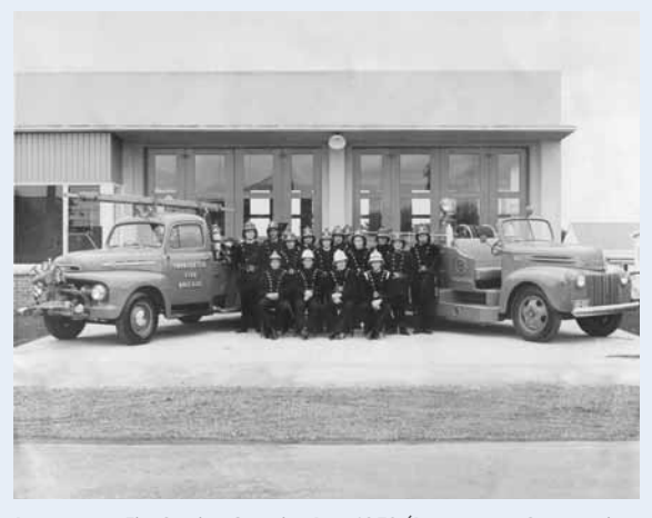
Papatoetoe Fire Station Opening Day 1959

The new Papatoetoe Fire Station opened here in 1959, replacing an earlier station situated behind the Papatoetoe Town Hall.