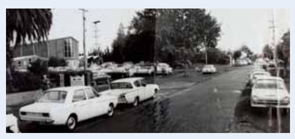
Cars parked outside St George's Anglican Church in Landscape Road, 1970

The Papatoetoe Anglican Church hall was moved from St George Street to the newly developed Landscape Road in 1922, where the building was extended and dedicated to St George the Martyr.