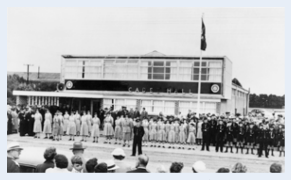
Opening ceremony, Papatoetoe Cadet Hall, 1958

Governor-General Viscount Cobham and Lady Cobham opened the St John Ambulance Brigade Cadet Hall on 22 April 1958. The site was formerly used by pupils at Papatoetoe Central School to graze their horses during the day. The Cadet Hall building later became a youth centre for Papatoetoe Adolescent Charitable Trust (PACT).