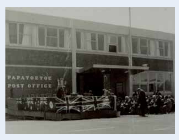
Opening the new Papatoetoe Post Office, 1966

The large two-storey building on the corner of St George Street and Kolmar Road, formerly the Papatoetoe Post Office, opened on 14 October 1966. The Post Office closed in January 1990, and a post shop was later established across the road.