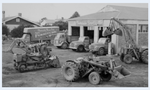
Burnside Brothers Ltd, Shirley Road, 1964