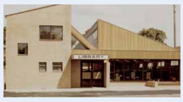
New Papatoetoe library building, 1979

The Papatoetoe War Memorial Library officially opened on 26 February 1979, replacing the former library building in the civic war memorial building in St George Street. In 1989 the library became a branch library of the Manukau Libraries system, and is now part of Auckland Libraries.