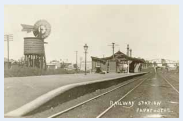
Papatoetoe Railway Station, ca 1925

The Papatoetoe Railway Station was first opened on a site near the present-day Station Road bridge in 1875. In 1914 the building was moved to a new site on the western side of the tracks, but was later redeveloped on an 'island' site. The building was substantially extended in 1919. The station was also closed in 1987 and subsequently fell into disrepair. It was removed from the site in 1999.