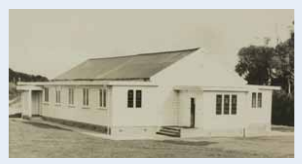
Church of the Holy Cross, Papatoetoe, 1962

The original Catholic Church of the Holy Cross was built here in 1925 and demolished on 30 April 2013.