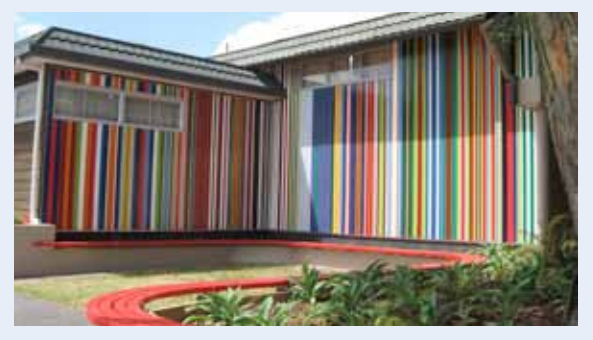
Regan Gentry, Learning Your Stripes, detail, 2012

Learning Your Stripes is a multi-part artwork that encompasses the RSA memorial and Burnside Park. Created by one of New Zealand's top artists, it is a key component of the heritage trail project.