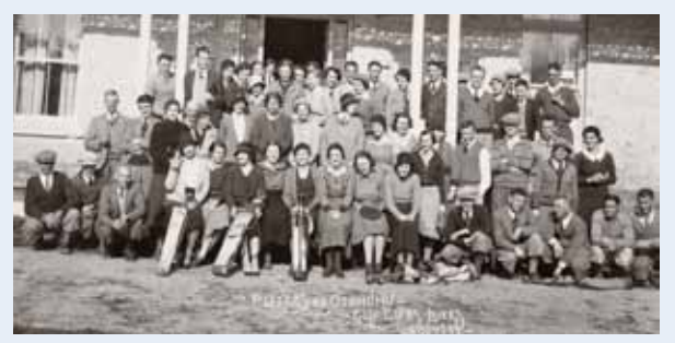
Ötāhuhu Golf Club members outside the clubhouse, 1933

The Ōtāhuhu Golf Club, formed in 1924, moved to this site in 1931. Its clubrooms were originally based in 'The Grange' homestead. The club changed its name to The Grange Golf Club in 1956. It opened a new clubhouse in August 1957.