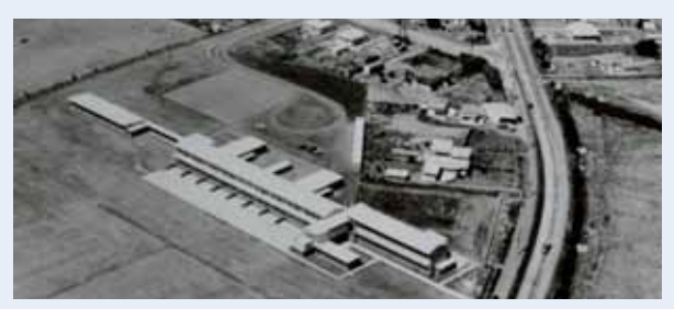
Aerial view, Ōtara Intermediate School, 1953

The Auckland Education Board built this school in 1952. They planned to name it Middlemore Intermediate, but the name was changed to Ōtara Intermediate when it opened in February 1953.