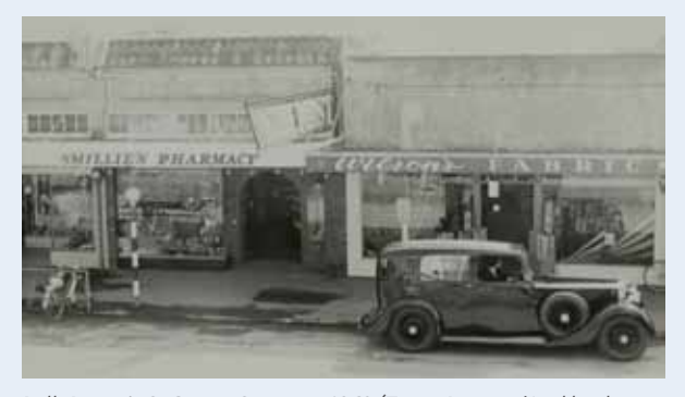
Rolls Royce in St George Street, ca 1960