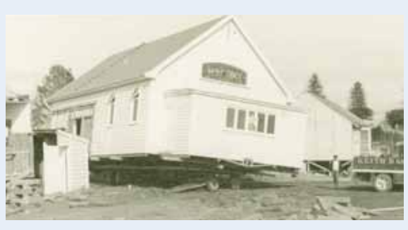
Relocation of the Former Baptist Church to the rear of the site, 1970 (Trevor Penman)

Landscape Park apartments opened on the site of the former Papatoetoe Baptist Church in 2005. Papatoetoe's first Baptist Church opened here on 3 February 1934. The second church, opened on 28 March 1971, was demolished in 2004. Its replacement, the Manukau Baptist Church, opened on 22 March 2009 in a converted commercial building (formerly a roller skating rink) in Lambie Drive. Landscape Road was formed in 1921. It was named by Arthur Lipscombe after a street in Three Kings where his wife had lived.