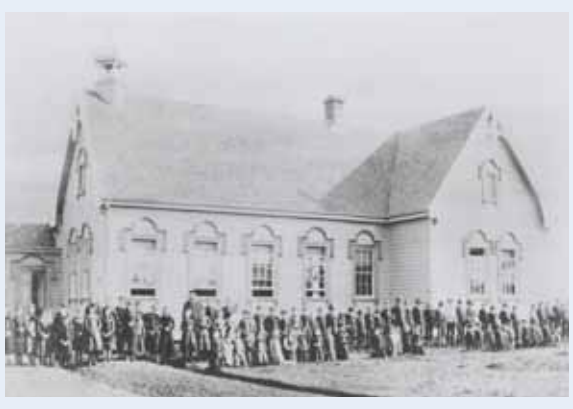
Ótara School, 1884

Papatoetoe Central School began life in 1856 as the Ötara Presbyterian Day School, based at St Johns Church. It became a non-denominational school in 1870, and was renamed the Ötara School in 1873. The school moved to the present site in 1884, changing its name to Papatoitoi School in 1889 and to Papatoetoe School in 1923. Some of the oak, põhutukawa and tõtara trees in the grounds were planted on the school's first Arbour Day in 1892.