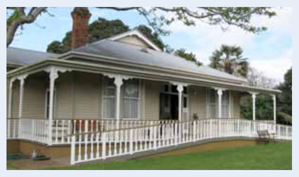
O'Loughlen house, 2009

The old kauri homestead at 40 Wallace Road dates back to 1912. It is sometimes known as O'Loughlen's house, after its original owner. In 1979 the Roman Catholic Sisters of the Good Shepherd bought the house for use as a nuns' retirement home, and added to the building in the original style. The property was sold in 1995.