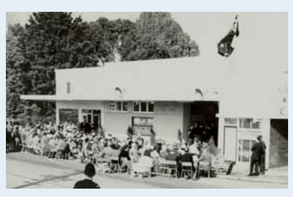
Official opening ceremony, Papatoetoe East Post Office, 1963

The first Papatoetoe East Post Office opened in August 1935 inside a family store further up Great South Road. It moved to its own building in 1953 as the increasing population saw growing demand for postal services. This site was the post office's third location.