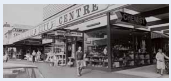
Papatoetoe City Centre Mall, St George Street, Papatoetoe, 1981