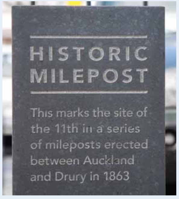
Denis O'Connor, Milepost, detail, 2013

The original 1863 milepost on this site marked the halfway point between Auckland and Drury – 11 miles each way.