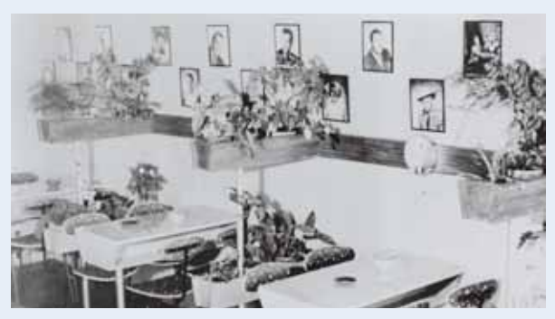
Coffee bar, Ōtara Luxury Cinema, 1957