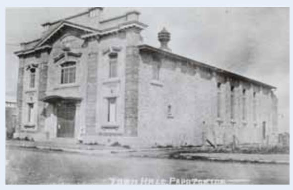
Papatoetoe Town Hall, ca 1925