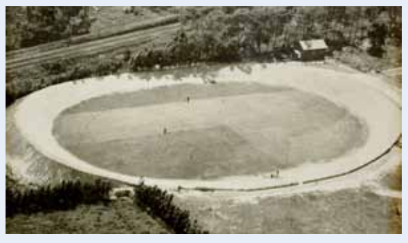
Papatoetoe stadium and cycling track, 1932

In 1926 the Papatoetoe Town Board agreed to purchase a tract of land between Wallace Road and the railway line for recreation purposes. The Wallace Road Reserve was formally opened behind the Town Hall in February 1929, along with a band rotunda. A children's playground was also opened there in November 1930.