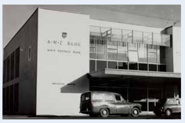
ANZ Bank, St George Street, ca 1967