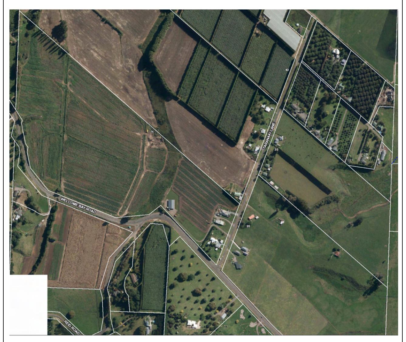
Aerial Photograph showing 6 papakainga houses to the south of Taranaki Lane

The papakāinga area comprises approximately 1ha (2.5 acres) of the total 32.3ha (80 acre) area. The houses are clustered to ensure the balance of the land remains economically viable to support dry stock grazing and a lease for maize growing. This is the main income for the Trust and is just enough to cover outgoings and some maintenance.