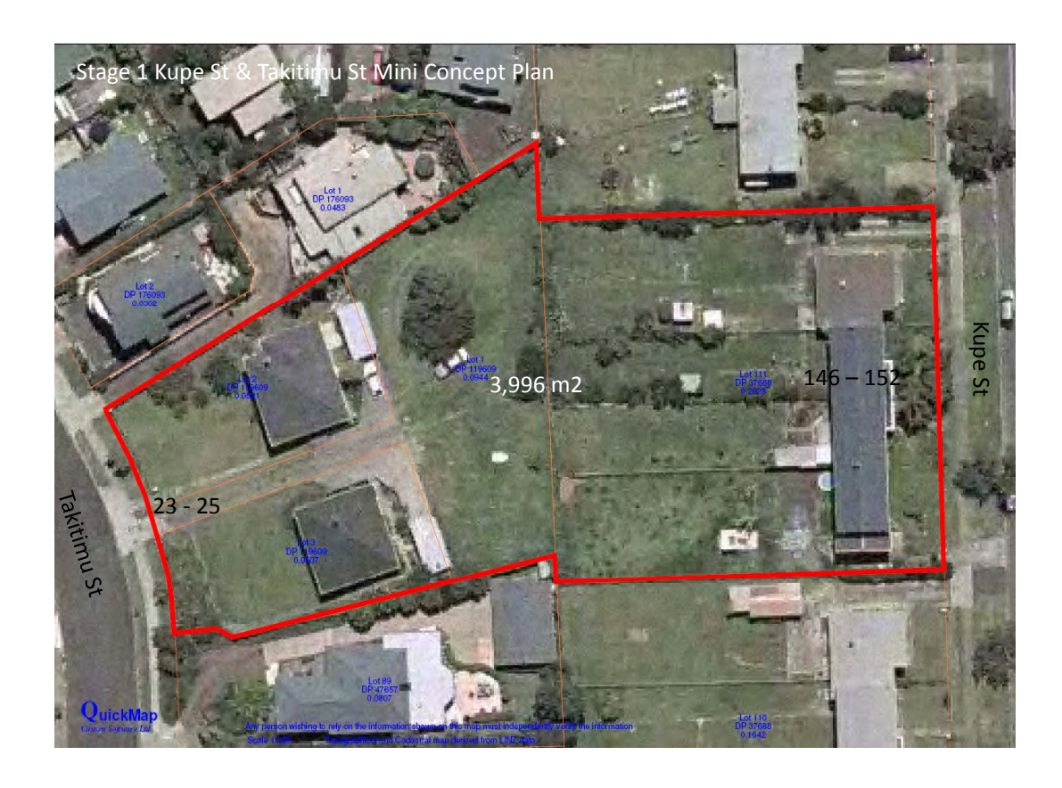
Proposed Stage 1 Medium Density Papakāinga Development site at Ōrākei

This pilot project will give hapu members a valuable opportunity to trial a higher density approach which can be carefully monitored with post occupancy evaluations, thereby informing future developments in the area.