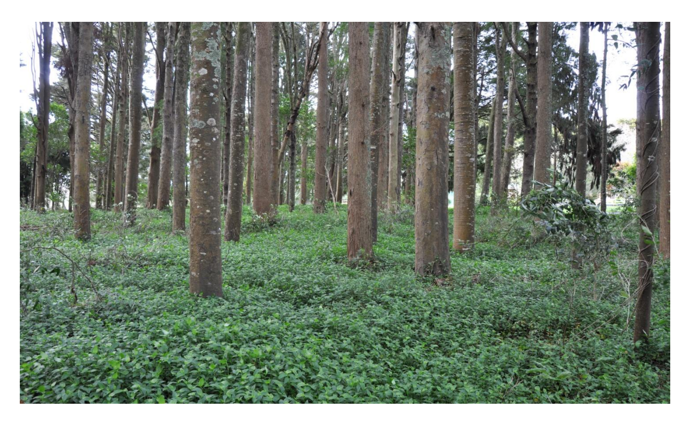
Plate (4£5) proposed bushlot covenant (application Waitoki) Issue: Weedy coppice of mainly podocarps; no sub-canopy and understorey