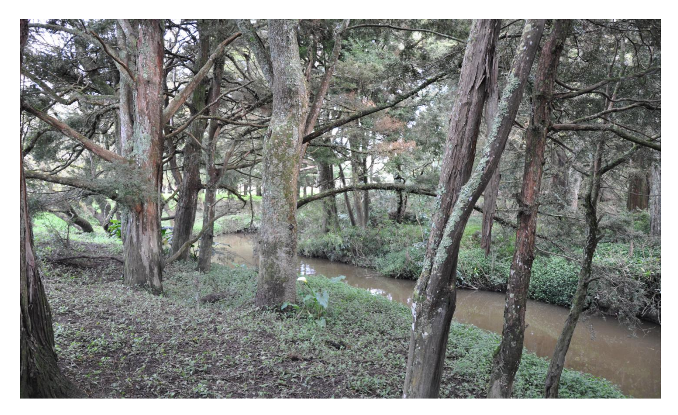
Plate (8 \pm 9) Proposed esplanade reserve (application Waitoki) Issue: Stock damaged stream and weedy understorey