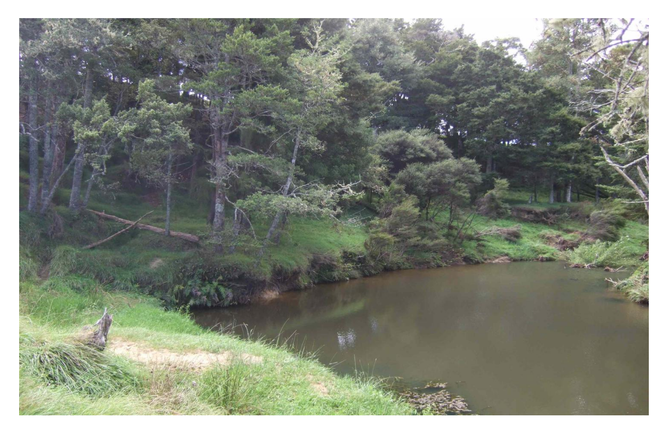
Plate (13&14) Approved bushlot covenant Issue: Not a natural wetland with no appropriate planting and thick sward of grass under Totara preventing establishment of understorey