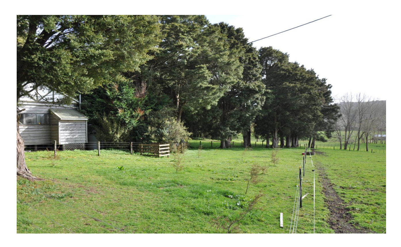
Plate (1&2) Proposed bushlot covenant (application Waitoki) Issue: Disconnected stand of Totara