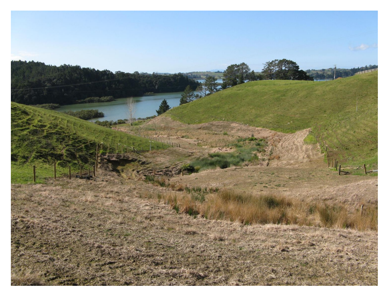
Plate (10) Approved wetland covenant Issue: Inappropriate degraded farmland of poor quality approved as a wetland covenant.