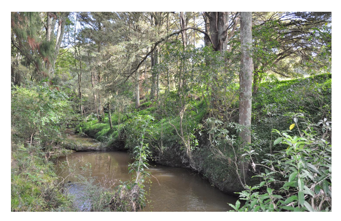
Plate (6&7)Proposed esplanade reserve (application Waitoki) Issue: Stock damaged stream and weedy understorey