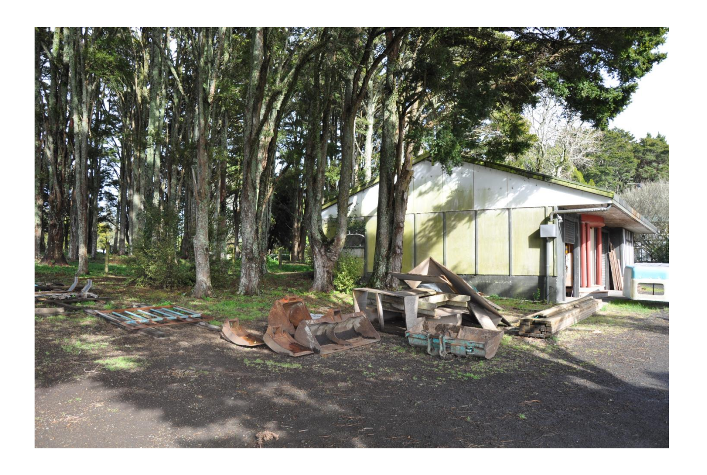
Plate (3)Proposed bushlot covenant (application Waitoki) Issue: Buildings, roads and equipment within a degraded coppice of Totara