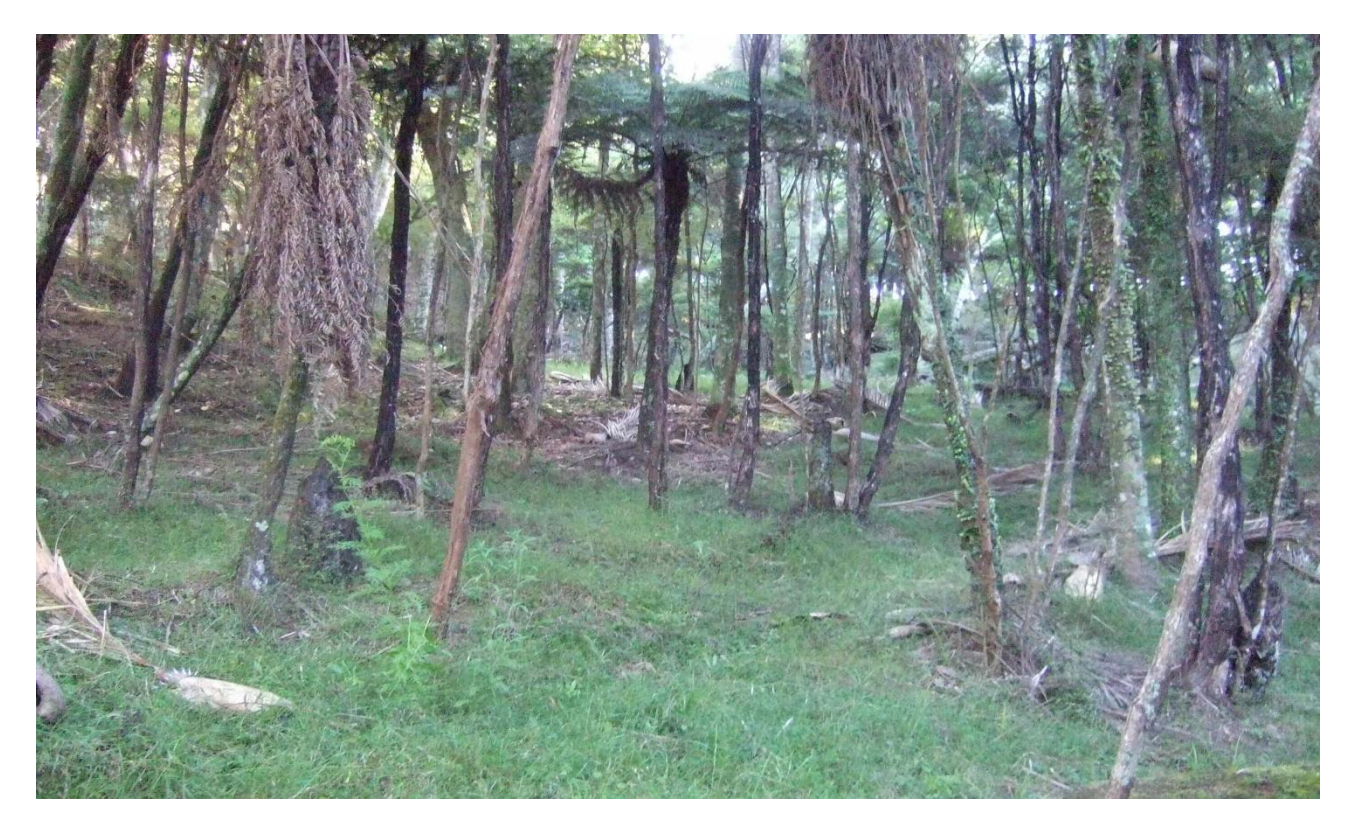
Plate (11&12) Approved bushlot covenant Issue: Degraded and damaged Manuka stand of very low quality