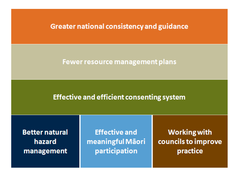
Figure 2: The six elements of the proposed resource management system reform package

The remainder of this chapter describes in more detail what sits within each of the Government's six sets of policy proposals. Some proposals include several separate but related elements. For each element within the policy proposals, this discussion document provides: