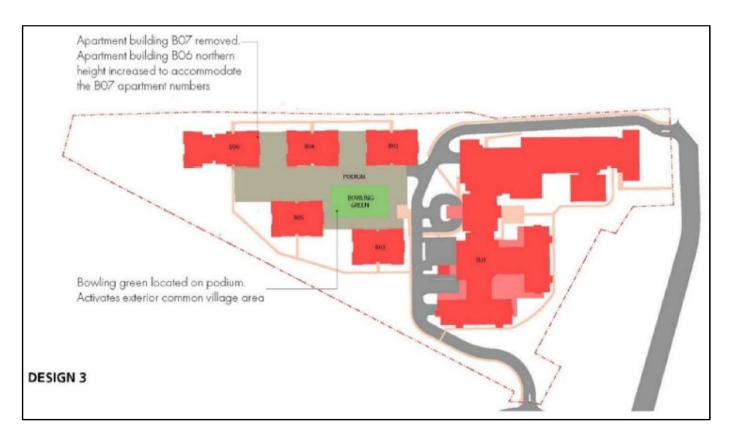
Figure 4: Design 3