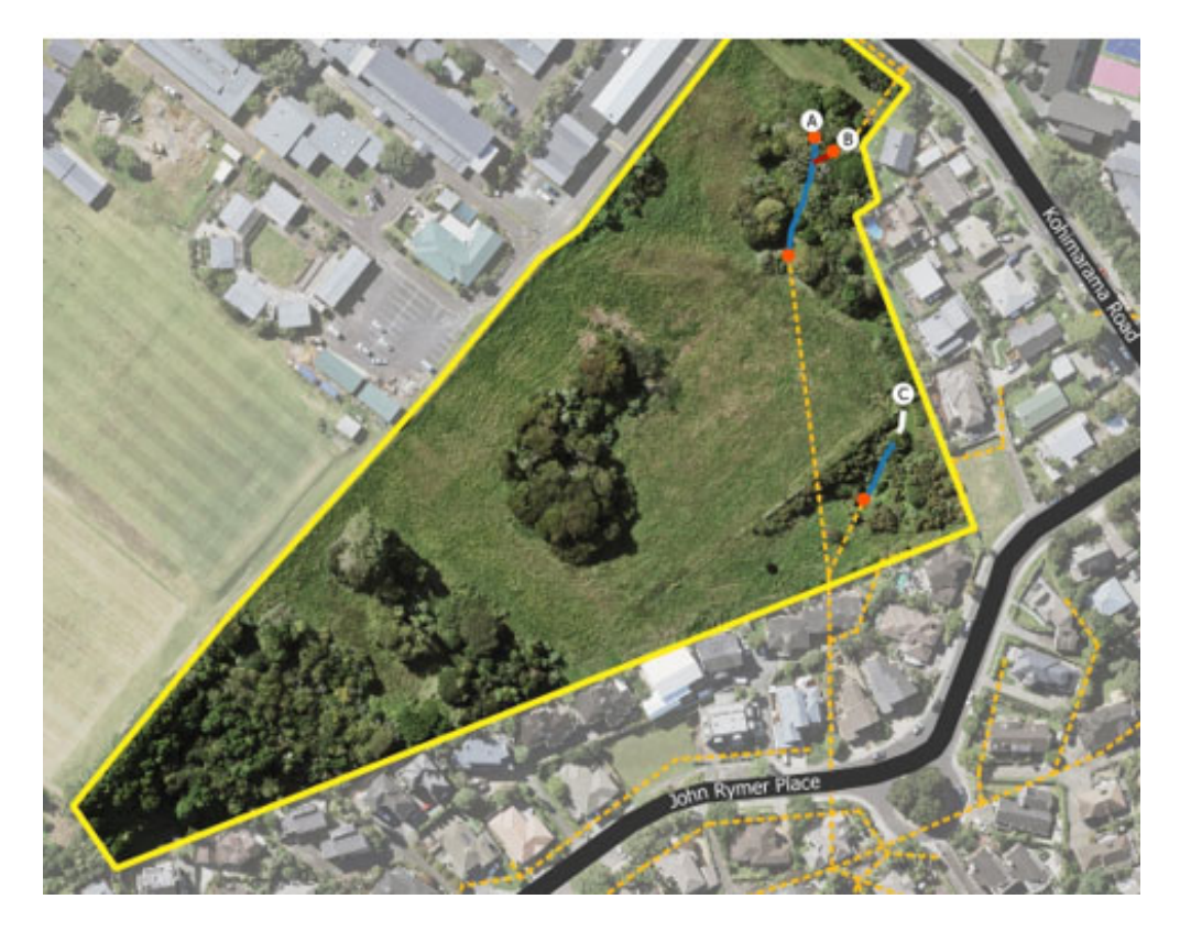
Figure 7: Watercourses on Site

The Site does not contain any recorded archaeological or other historic heritage sites.