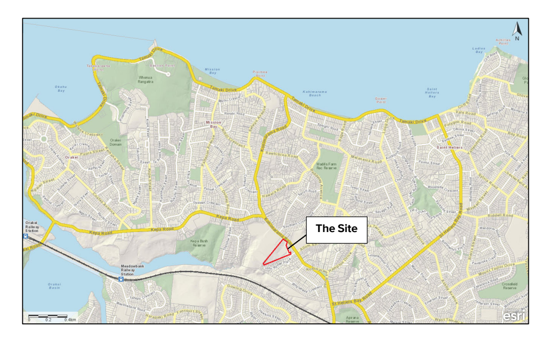
Figure 1: Site Location in Kohimarama

The Site is considered to be ideally suited for the Proposed Village due to its size and given that it has been identified as suitable for urban intensity residential development in the Auckland Unitary Plan – Operative in part (" AUP "). Kohimarama, and the surrounding eastern bays suburbs, require a range of accommodation and living options for all demographics – a matter which is recognised in the policies of the AUP. The Proposed Village will assist with this outcome by diversifying the range of accommodation stock available within the catchment.