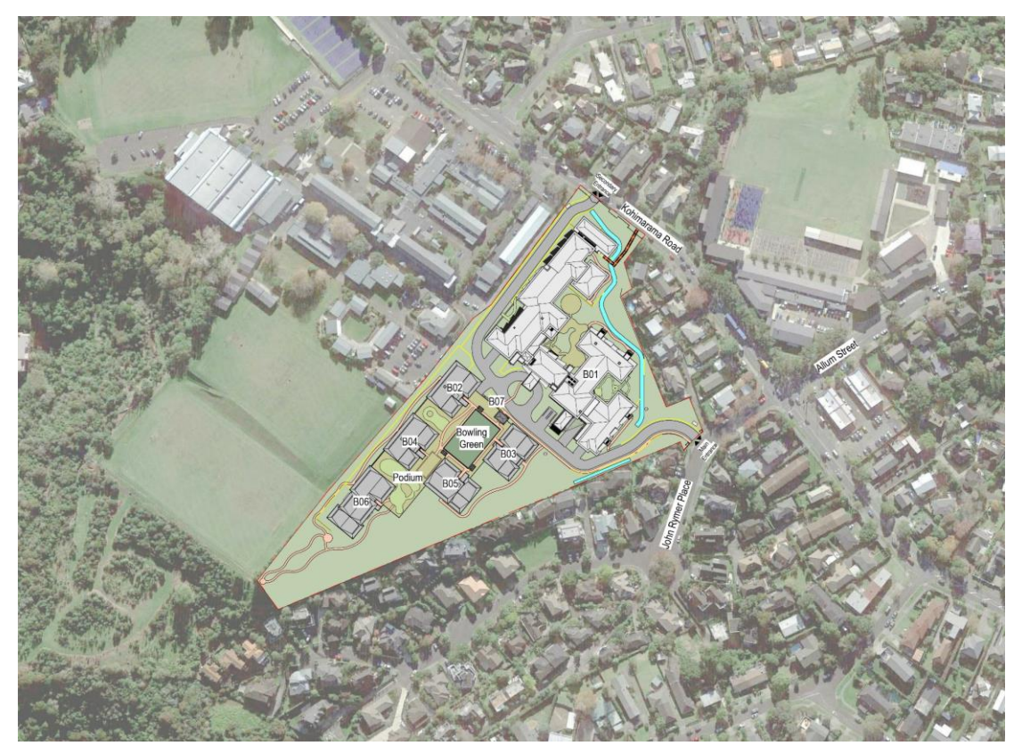
Figure 1: Proposed Site Layout