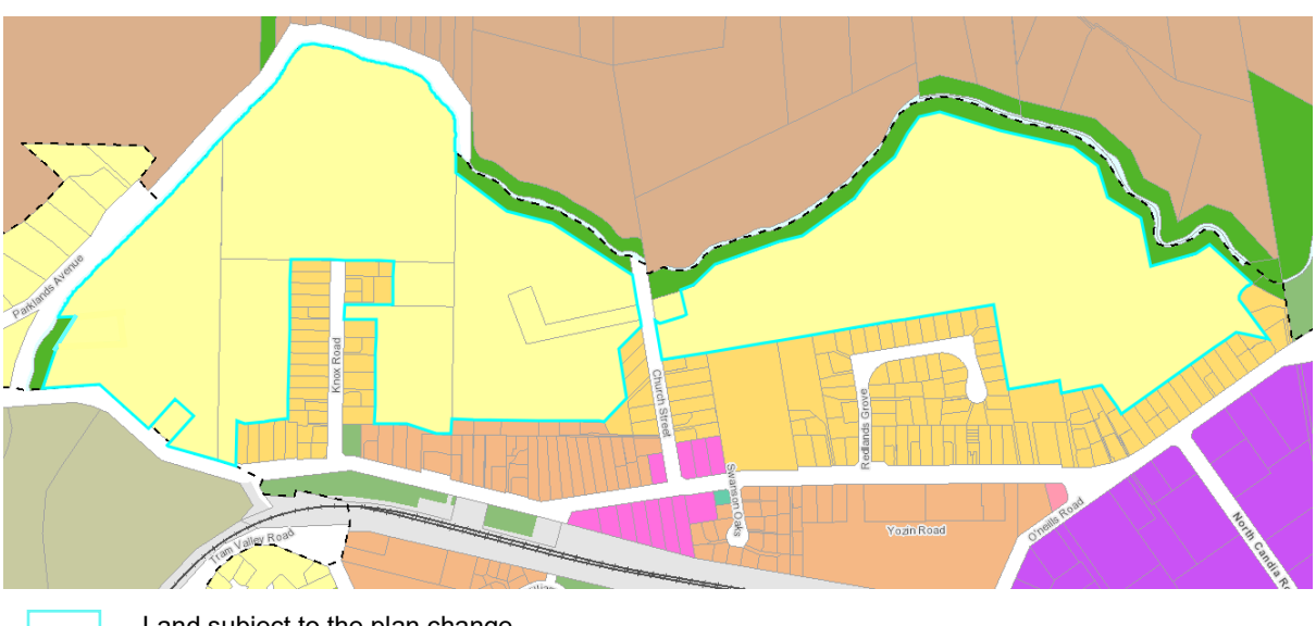
Figure 2: Existing zoning map