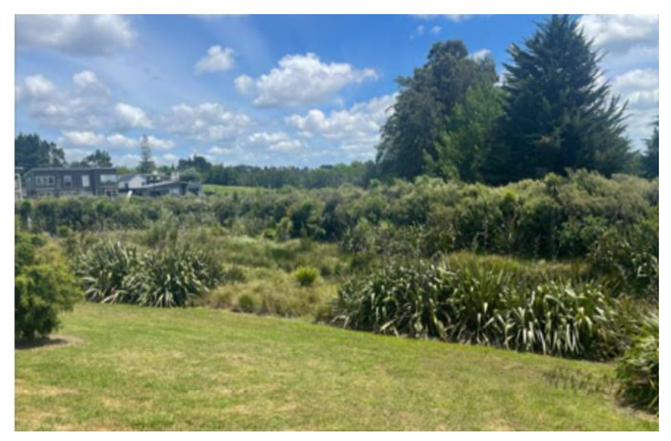
Figure 3. Mixed native vegetation looking south from pump station locality. Image taken during Beca site visit 3 December 2021.

Vegetation present at the Project site comprises a mix of indigenous and exotic species (moderate representativeness), common weedy species, and one native species with an 'At Risk – Declining' conservation status (moderate rarity/distinctiveness, low diversity and pattern). The vegetation present also forms a buffer from surrounding agricultural activities and an ecological corridor for freshwater fauna (moderate ecological context).