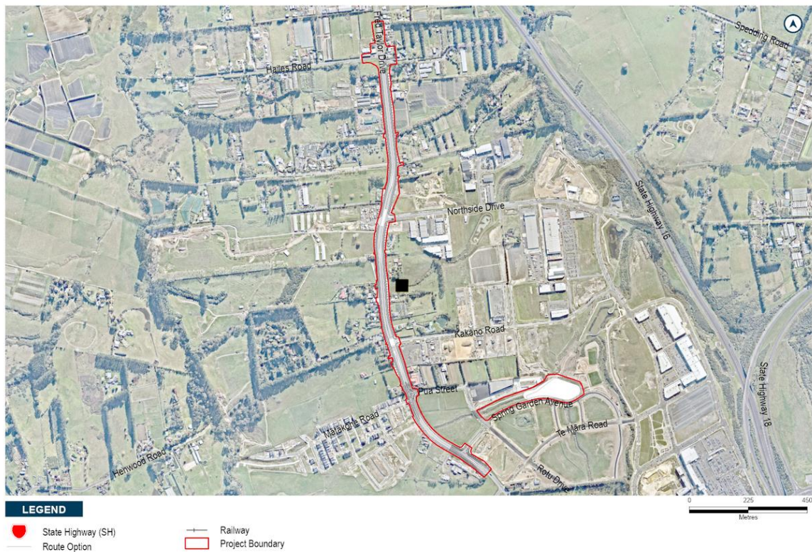
Figure 7-1 Overview of Fred Taylor Drive FTN Upgrade

An overview of the proposed design is provided in Figure 7-1