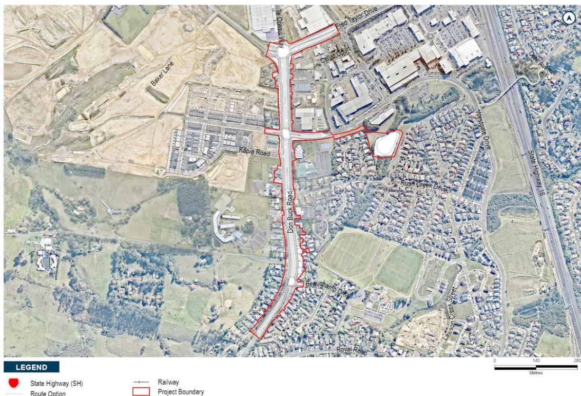
Figure 6-1 Overview of the Don Buck Road FTN Upgrade

An overview of the proposed design is provided in Figure 6-1.