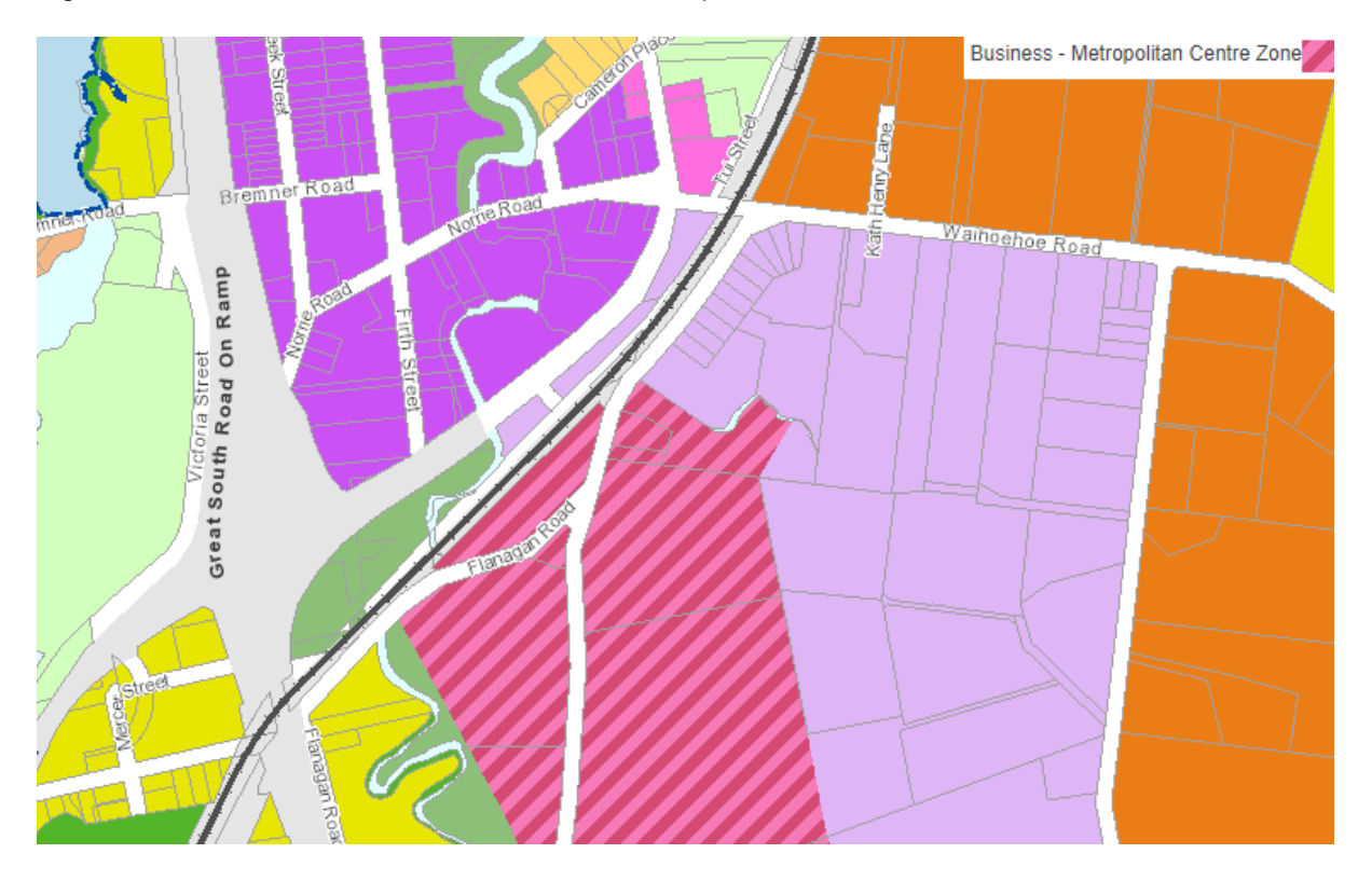
Figure 3-1: Extent of Business - Metropolitan Centre zone south of NoR 2