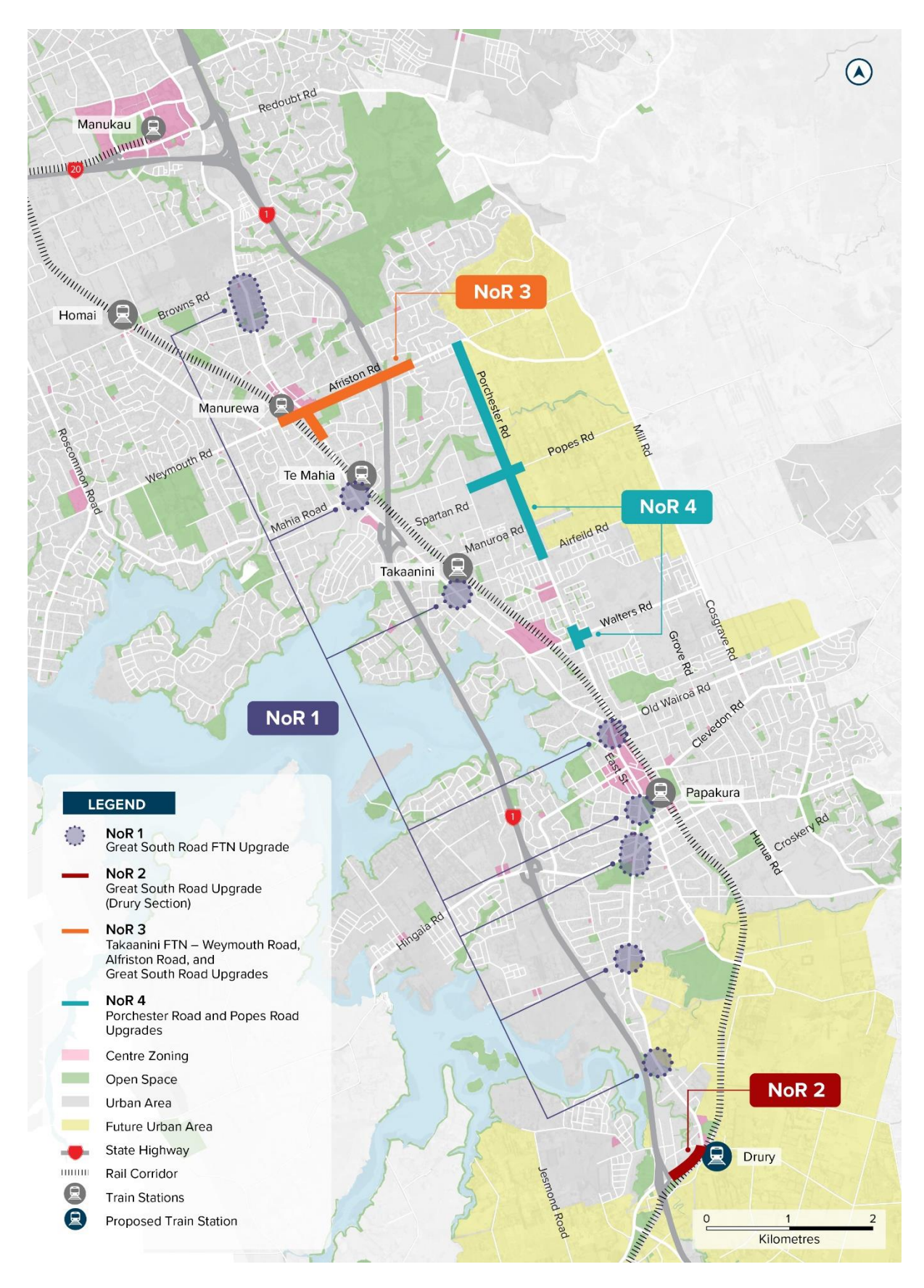
Figure 2-2: South FTN – NoR extents (the Project)