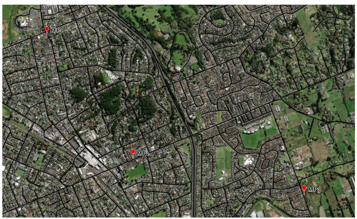
Figure 5-1: Noise survey locations

Road traffic was the dominant noise source at all measurement locations. There is a natural variation in the noise environment throughout the day, and often variations for the weekends. The L_{Aeq(24h)} and L_{A90} was calculated for each day where there was sufficient data after unsatisfactory meteorological conditions and abnormal events were excluded. The average L_{Aeq(24h)} and L_{A90} for the attended and unattended measurements are shown in Figure 5-1. It should be noted that measurement positions MP1 and MP2 were attended 1-hour measurements, while MP3 was an unattended measurement taken over a seven-day duration. Table 5-2 displays these noise survey results.