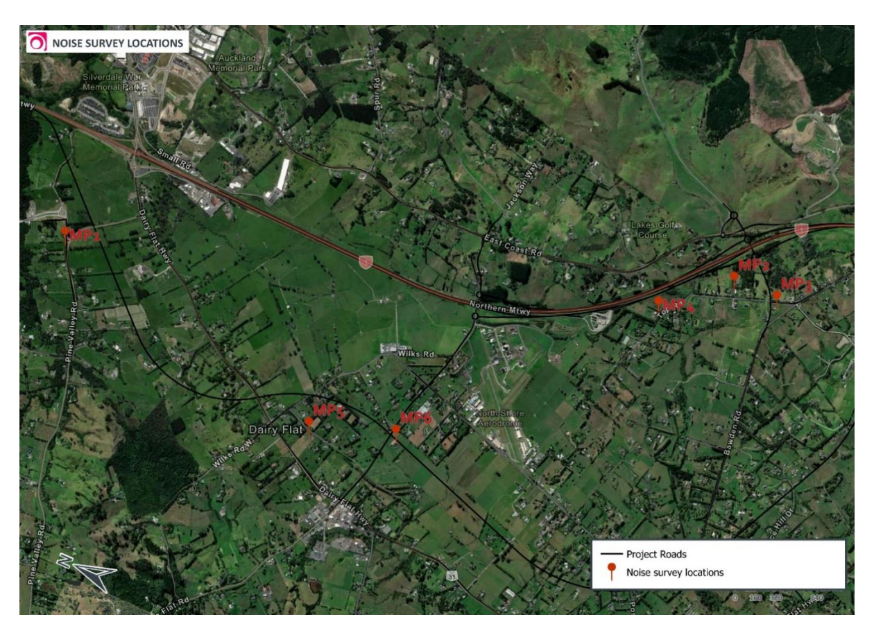
Figure 5-1 Noise survey locations