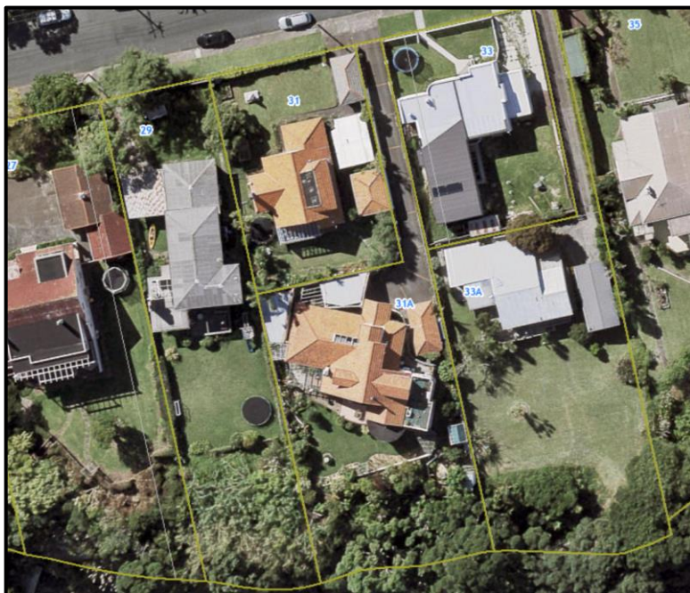
Figure 8: AUP GeoMaps - proposed