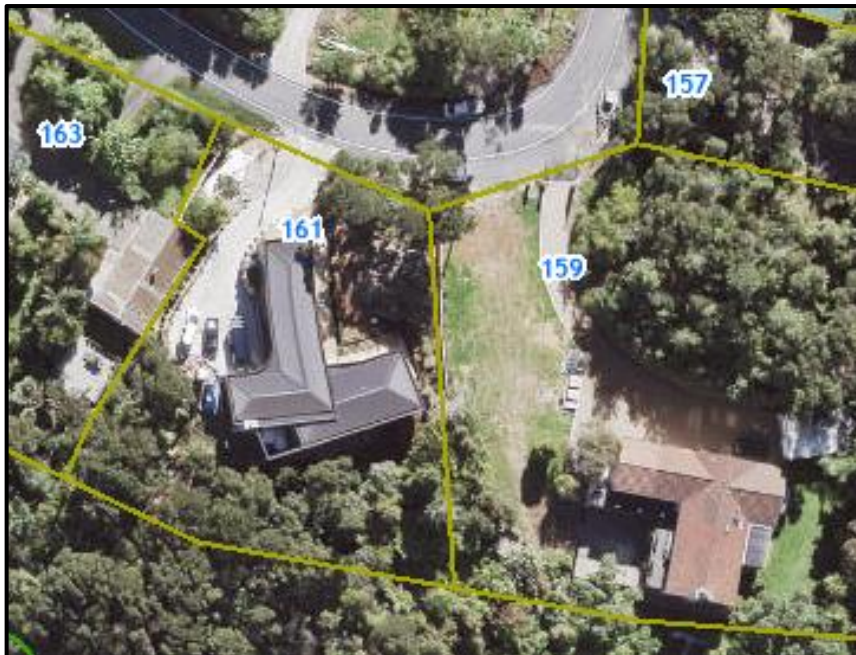
Figure 2: AUP GeoMaps - proposed