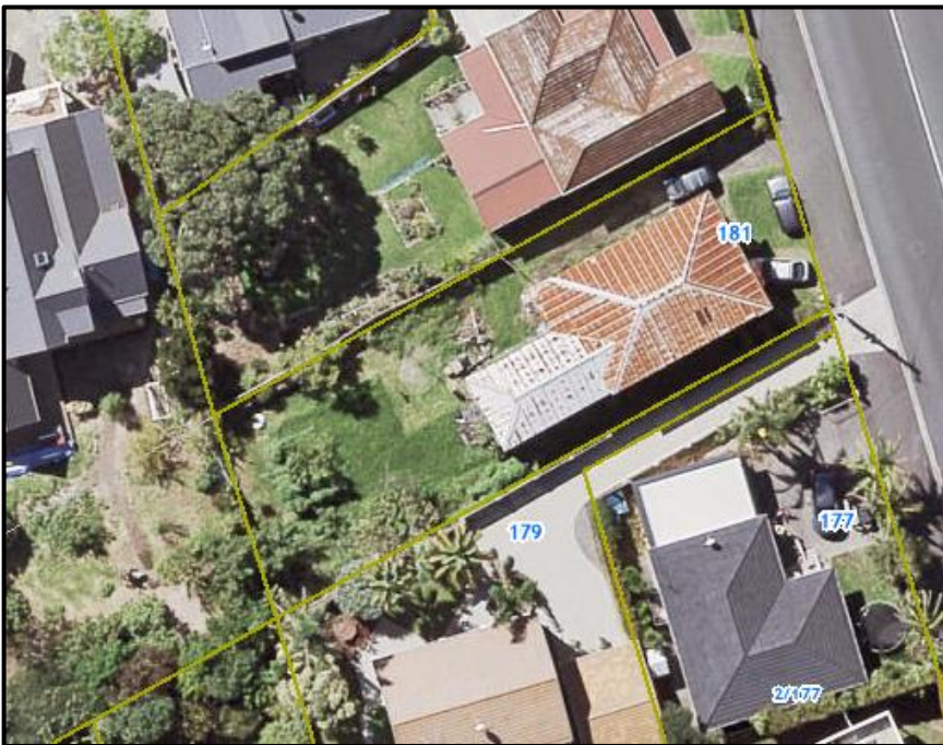
Figure 6: AUP GeoMaps - proposed