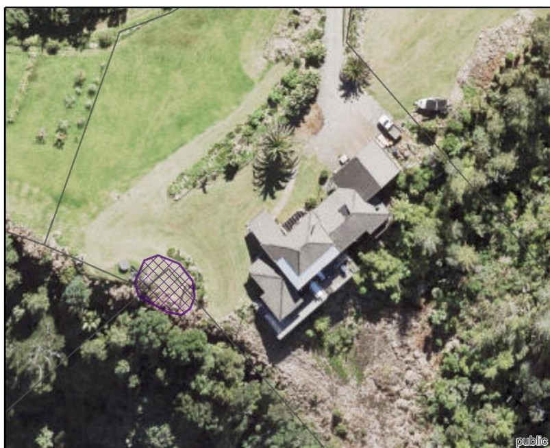
Figure 4: AUP GeoMaps – proposed (purple cross hatching)