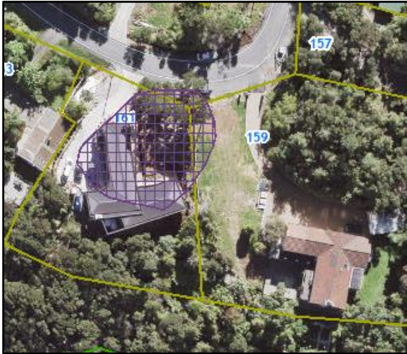
Figure 1: AUP GeoMaps – operative (purple cross hatching)