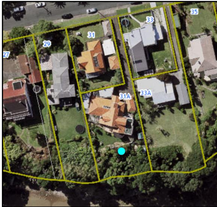
Figure 7: AUP GeoMaps – operative (blue dot)

Local Board Area Devonport-Takapuna Schedule 14.1 ID 00800 Place name and/or description Midden R11_970 Subject property/s 31A Norwood Road, Bayswater Legal description Lot 2 DP 33501 Proposed changes Delete the Historic Heritage Overlay Place (dot) from 31A Norwood Road