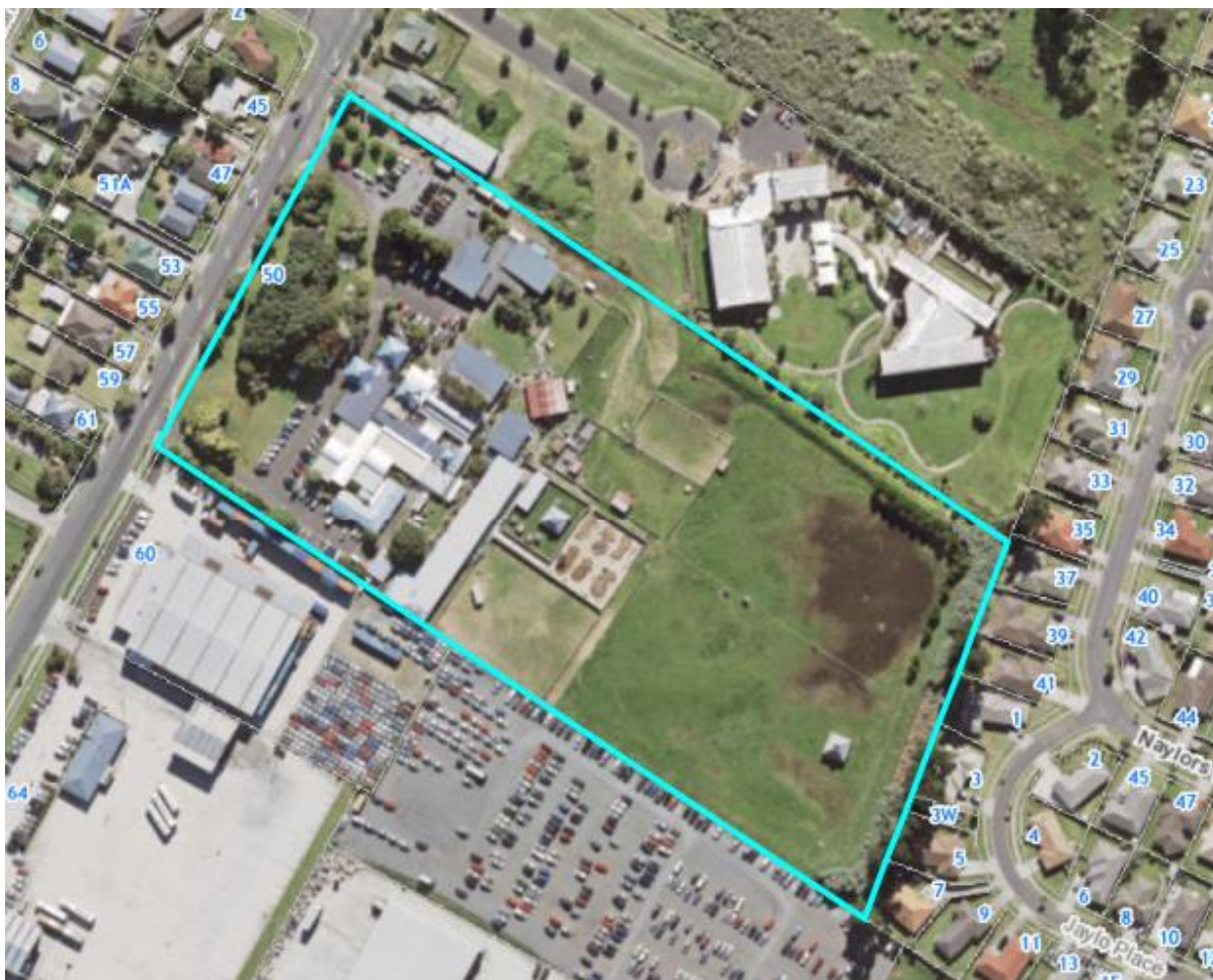
Figure 1 50 Westney Road.