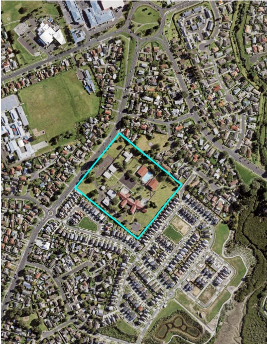
Figure 1: Location of Oranga Tamariki Residence and surrounds.