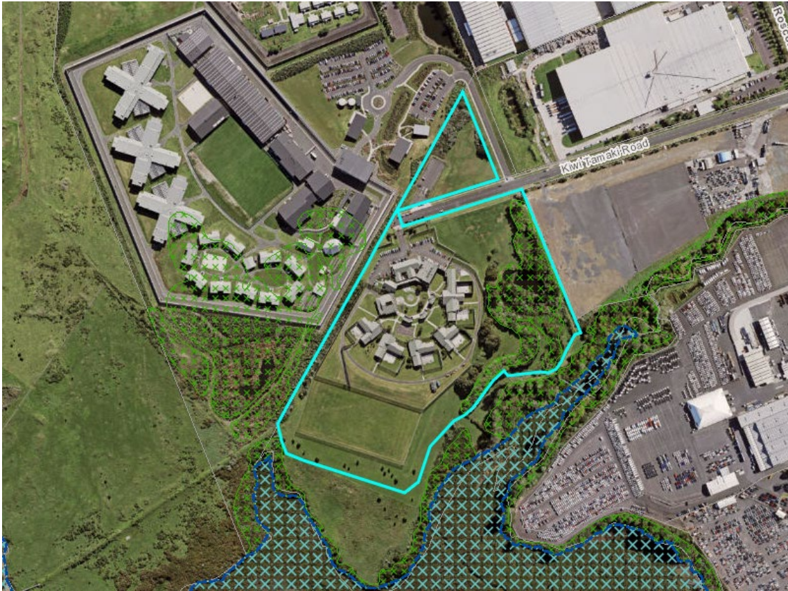
Figure 3: Significant Ecological Areas Overlay – SEA_T_589, Terrestrial (Green Hatch)