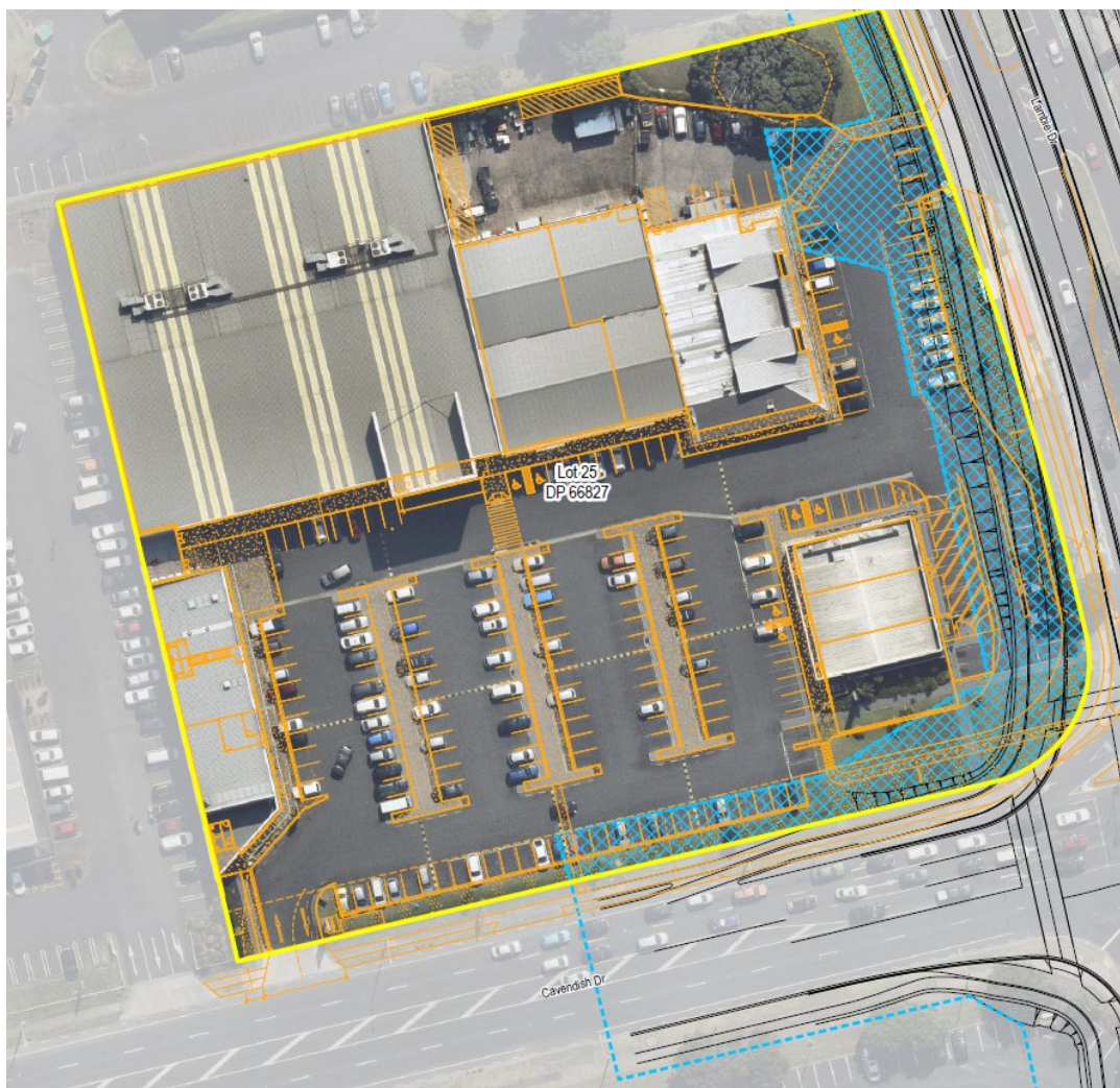
Figure 3: Extent of designation as it relates to the approved resource consent.