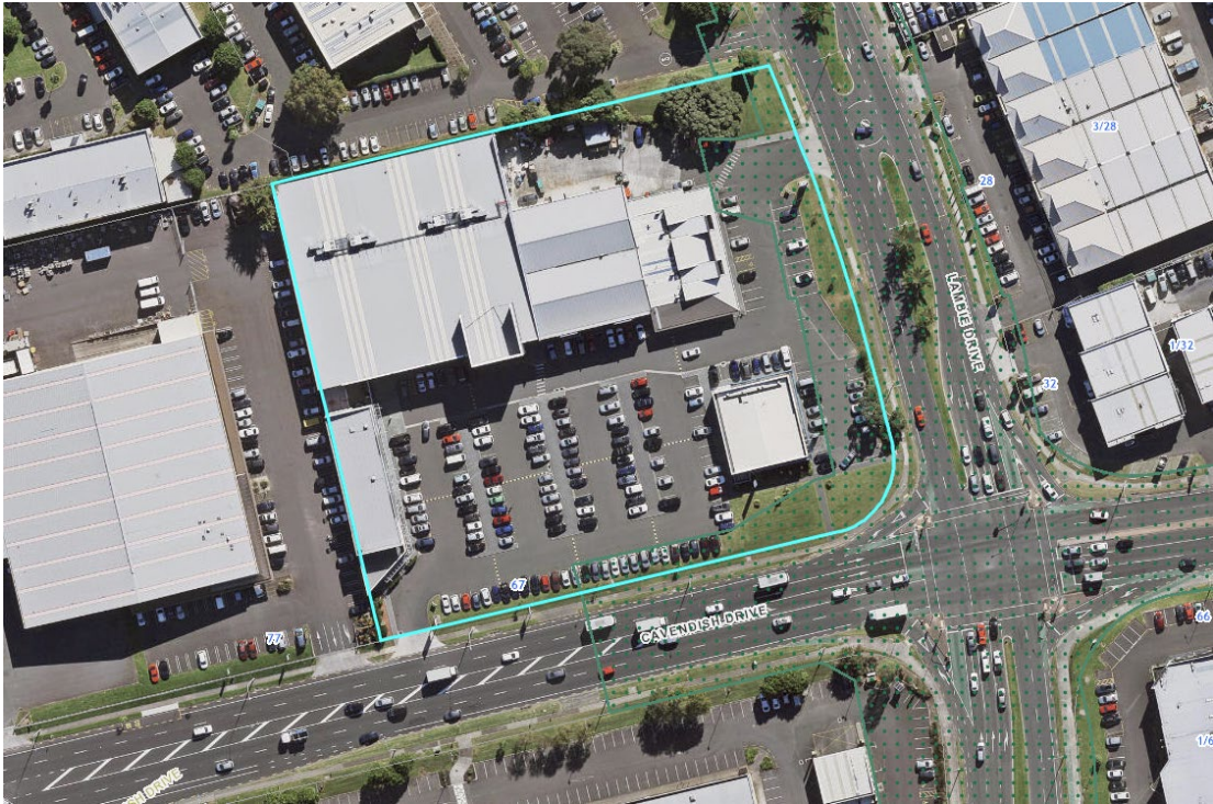
Figure 1: Extent of proposed designation (green dots) as it relates to 67 Cavendish Drive.