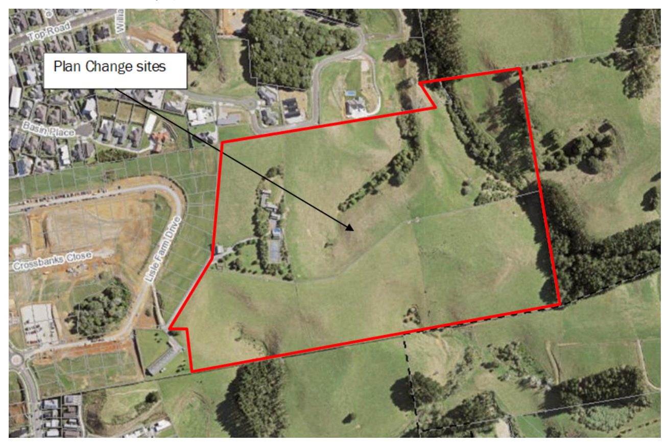
Figure 1: Locality Plan for 70A and 70B Lisle Farm Dr

A small area of kanuka and kahikatea is located in a small gully in the northern part of the property together with common crack willow. Kānuka forest occurs on the upper slope of the northern gully. Several large pūriri are present along the edge of this and other canopy species include red oak, akeake, pūriri, and taraire. Understorey species include harakeke, māhoe, nīkau, karamū, koromiko, and kawakawa.