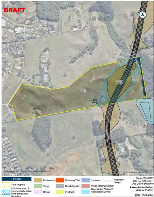
Figure 2 - Proposed Eastern Arterial Road

A copy of the draft NoR in annexed as Attachment 1.