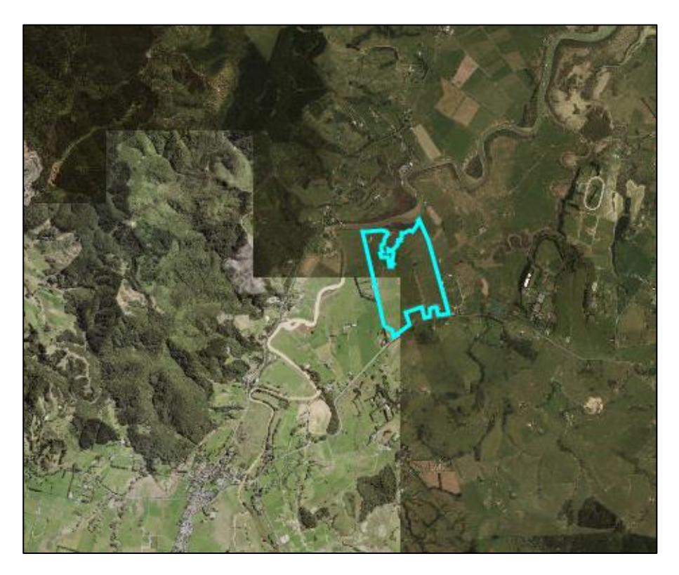
Figure 2: Site Location – Aerial Photograph