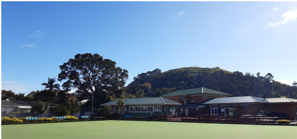
View north with tree on right and bowls club building on left, Maungawhau above.