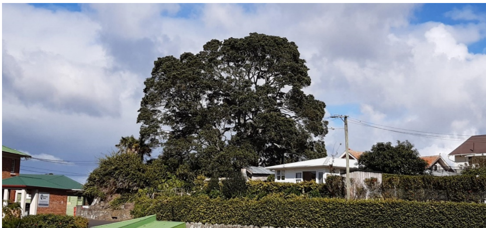
View south west with retaining and geographical feature in foreground.