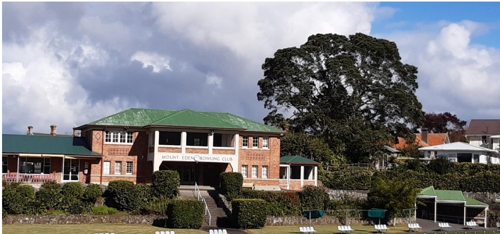
Epsom Avenue view looking south – tree to the right, and west, of the bowls club.