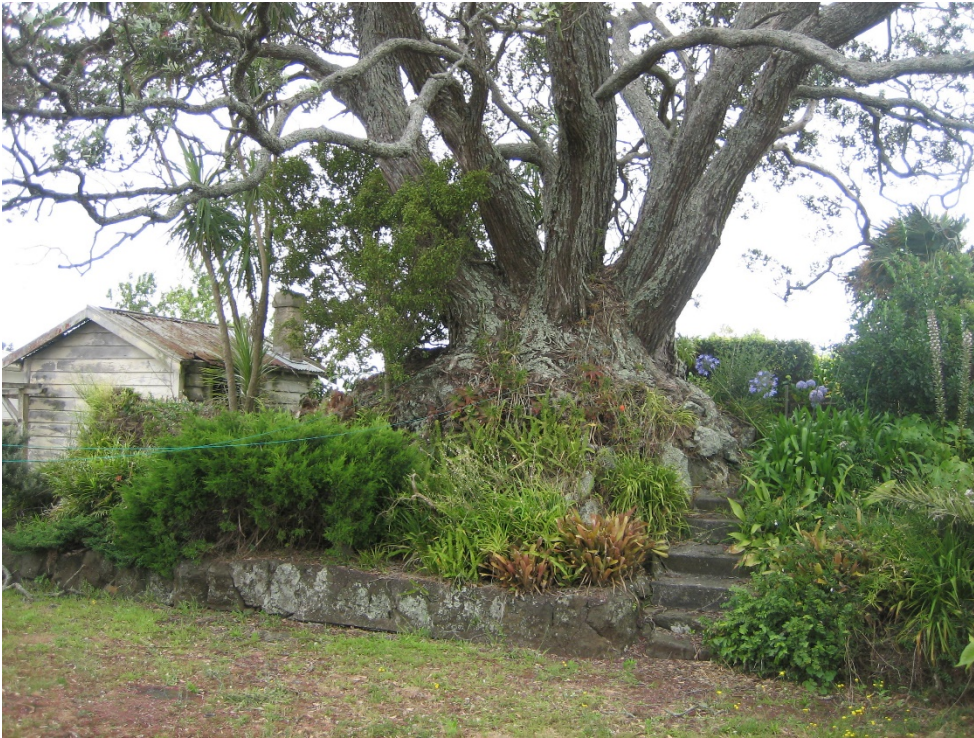
View north east from showing raised position and geographic feature below Auckland Council, 2013).