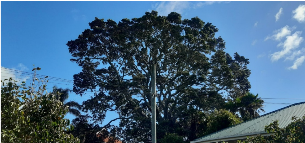
View north west and bowls club roof to the right.