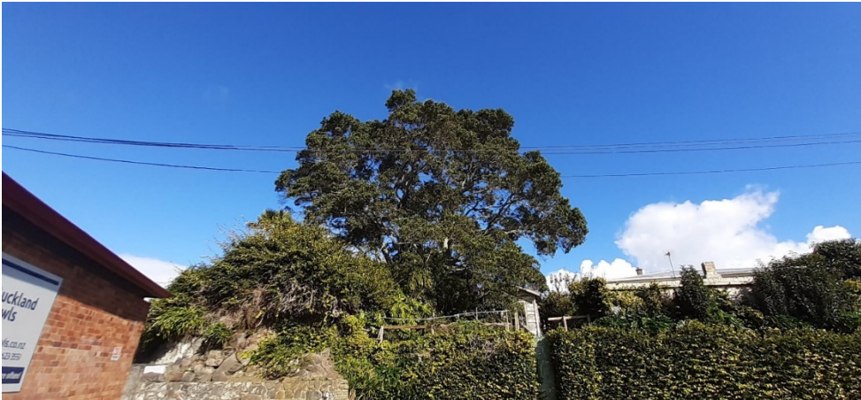
View directly west from bowls club with green rear gate and shed below building.