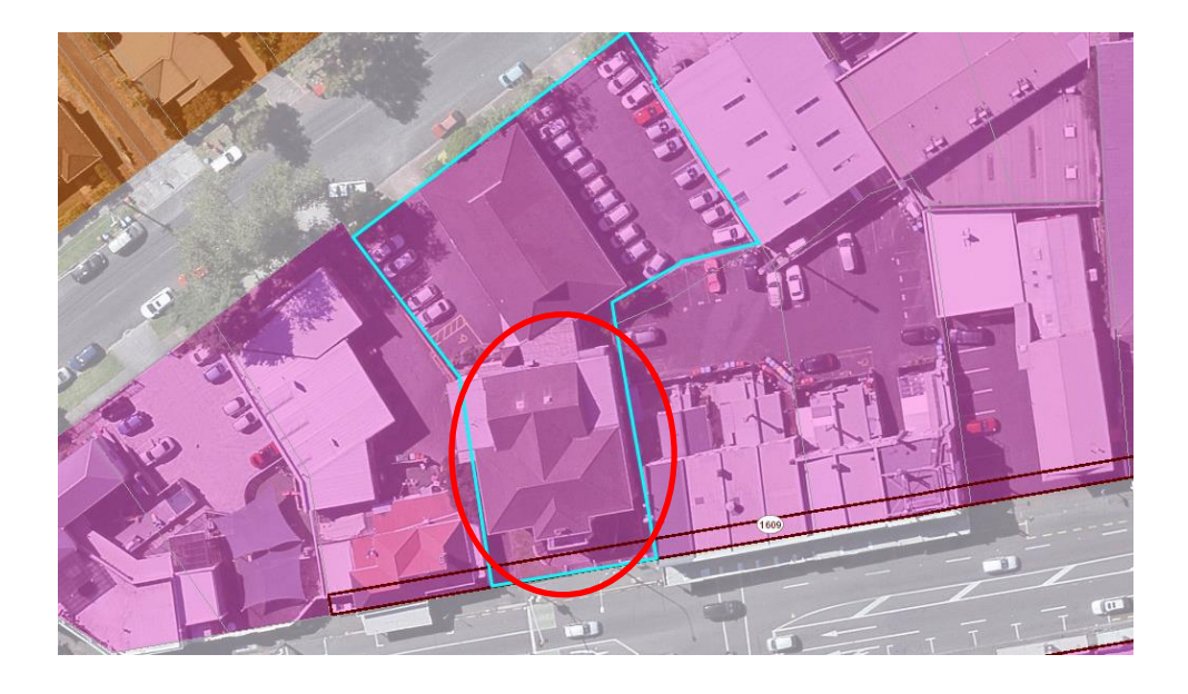
Figure 1 – 615 New North Road – blue outline extent of site and red circle is the existing building and extent of historic heritage place referenced in the Plan Change

This submission relates to the addition of one of the buildings located at 615 New North Road, Kingsland, onto the Historic Schedule 14.1 of the Auckland Unitary Plan.