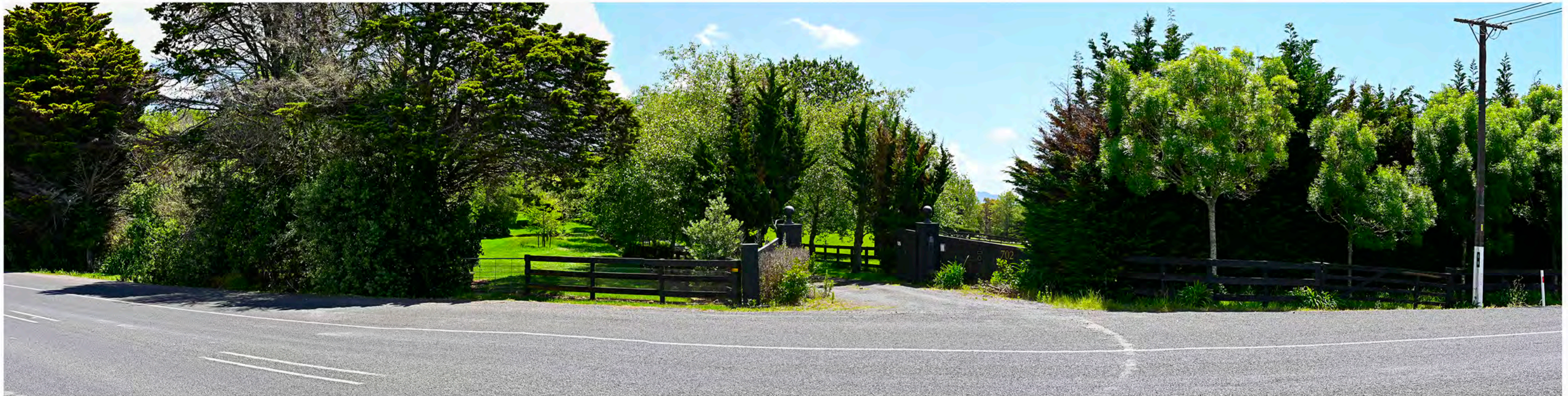
The lifestyle blocks & future FUZ abutting the farm area (above) & Formosa Golf Course (below)