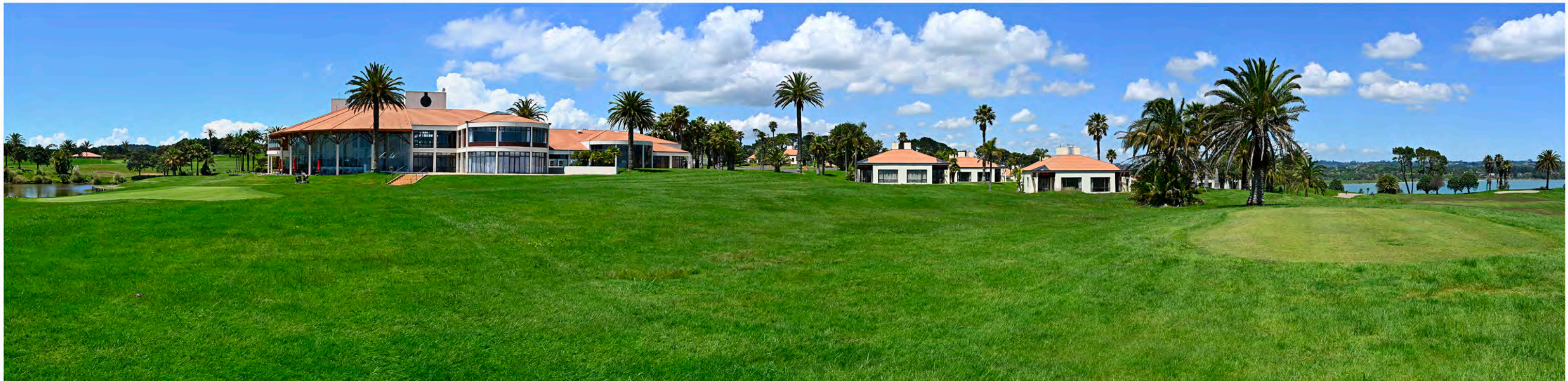
The golf course driving range, clubhouse & Rydges accommodation units