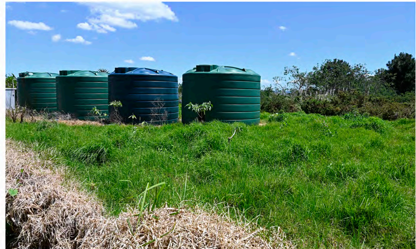
The Formosa clubhouse (above left), the abandoned recreation centre (below left) & the water tanks & weed species proliferating near the recreation centre (right)