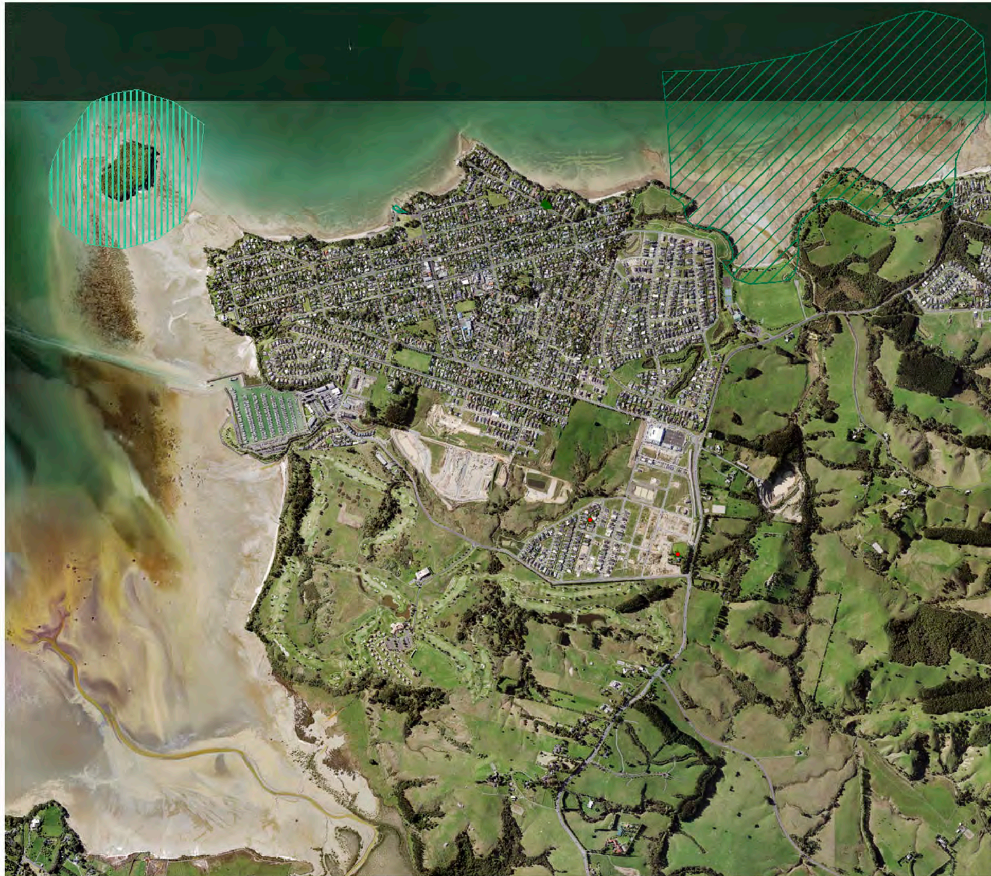
Map of ONLs & ONC Areas showing the green dark green hatched ONL covering much of Omana Regional Park & the lighter green hatched ONC Area around Motukaraka Island