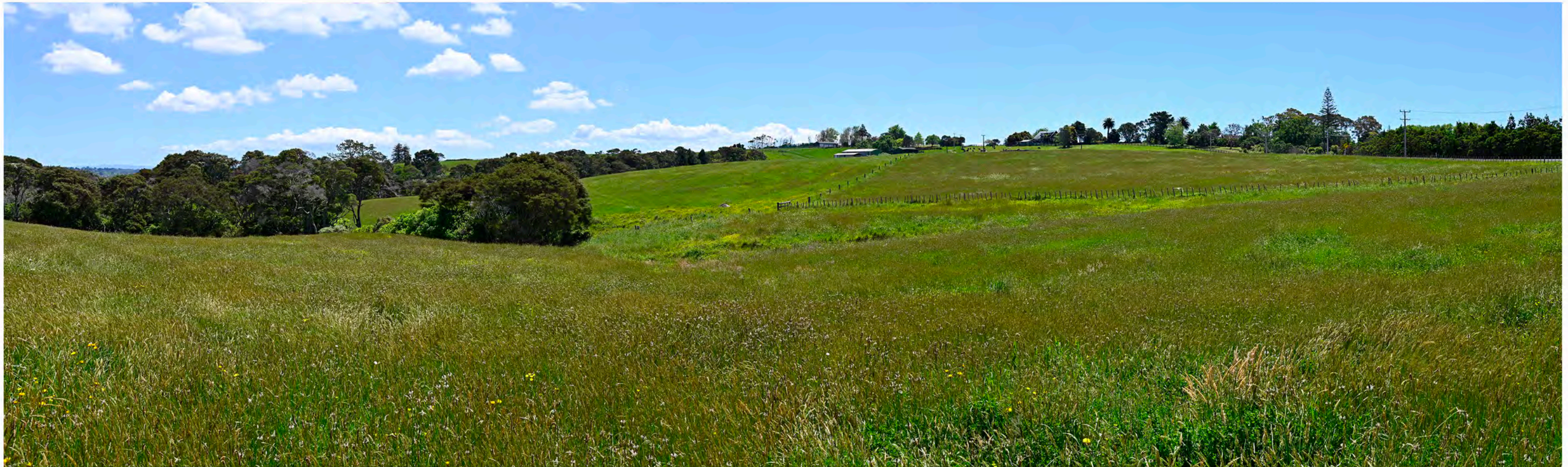
The southern end of the farm looking towards the Formosa Golf Course & adjoining lifestyle properties