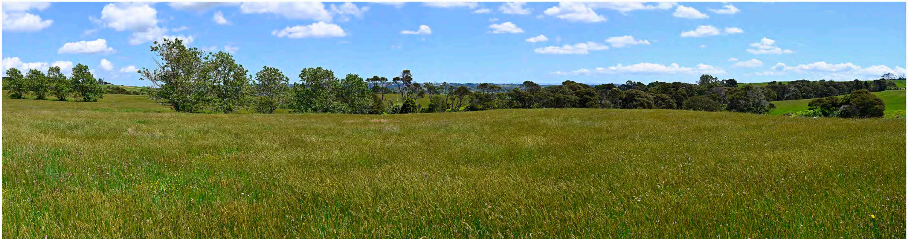
The southern end of the farm - with views towards the Waikopua Creek estuary & Clifton Road lifestyle area (above)