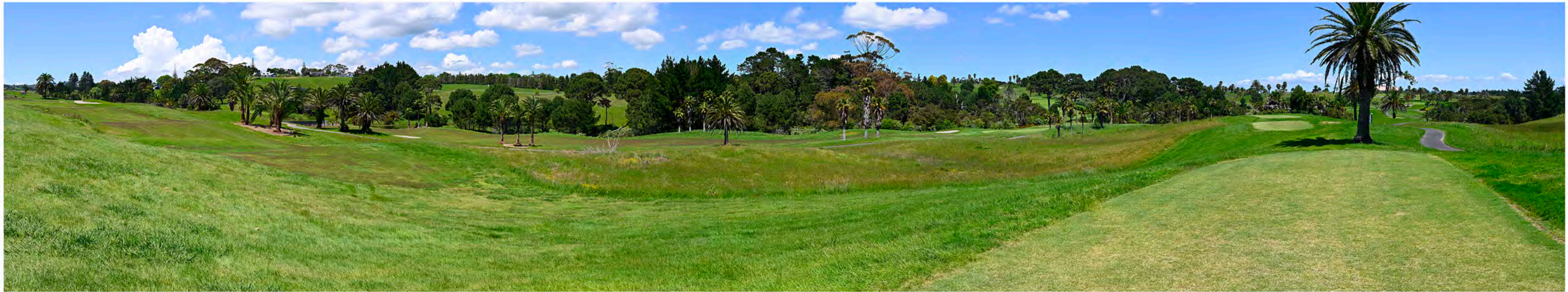
The Formosa Golf Course fairways near Jack Lachlan Drive