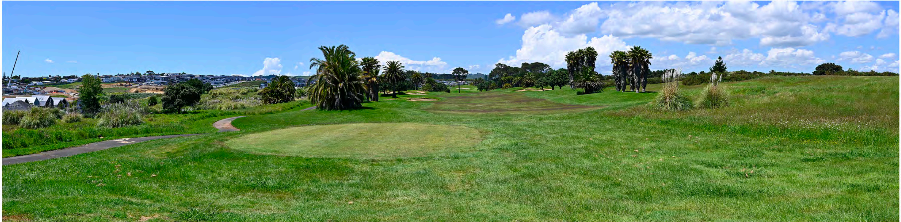
The golf course near Pine Harbour Marina (above) & returning near the lower end of Jack Lachlan Drive (below)