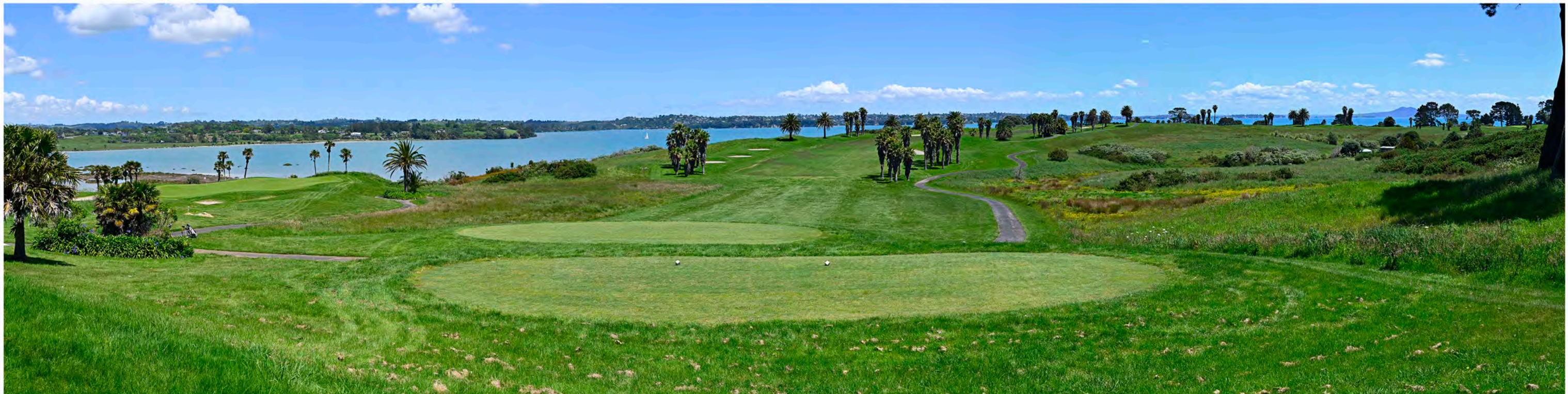
The golf course fairways near the Beachlands coastline