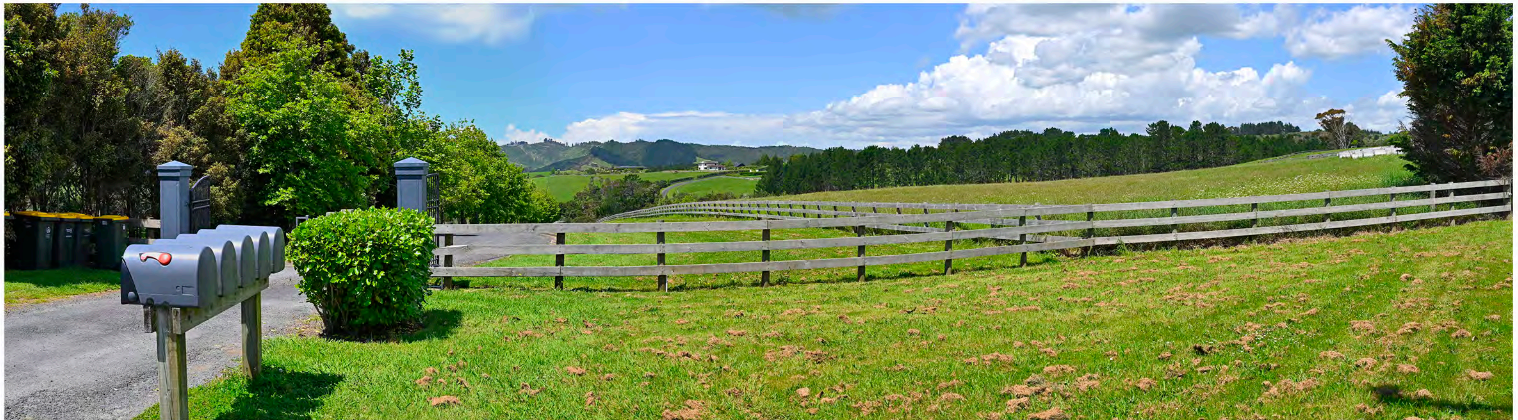
Looking across the farmland south-east of Whitford-Maraetai Road (above) & beyond the lifestyle estate at 631-645 Whitford-Maraetai Road (below)