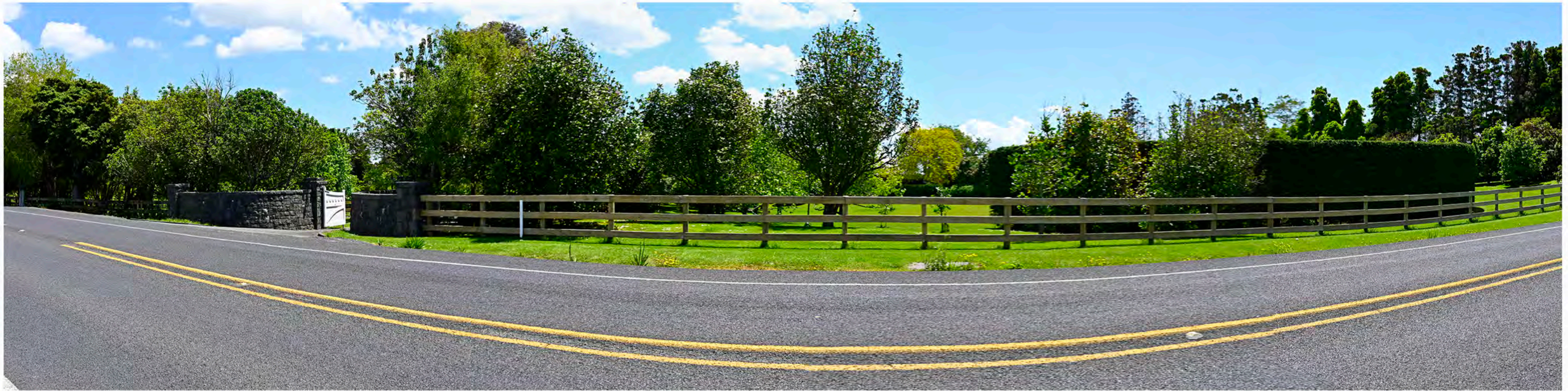
Lifestyle properties near the northern end of the Formosa Golf Course approaching Jack Lachlan Drive