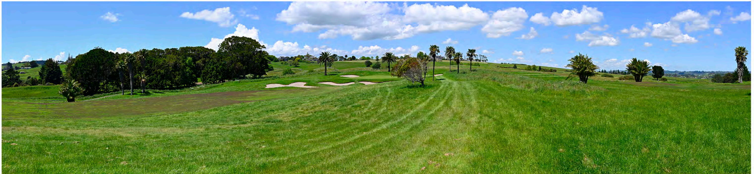
Looking down the fairways and valley near Whitford-Maraetai Road (above) & Looking towards the adjoining lifestyle properties from the centre of the course (below)