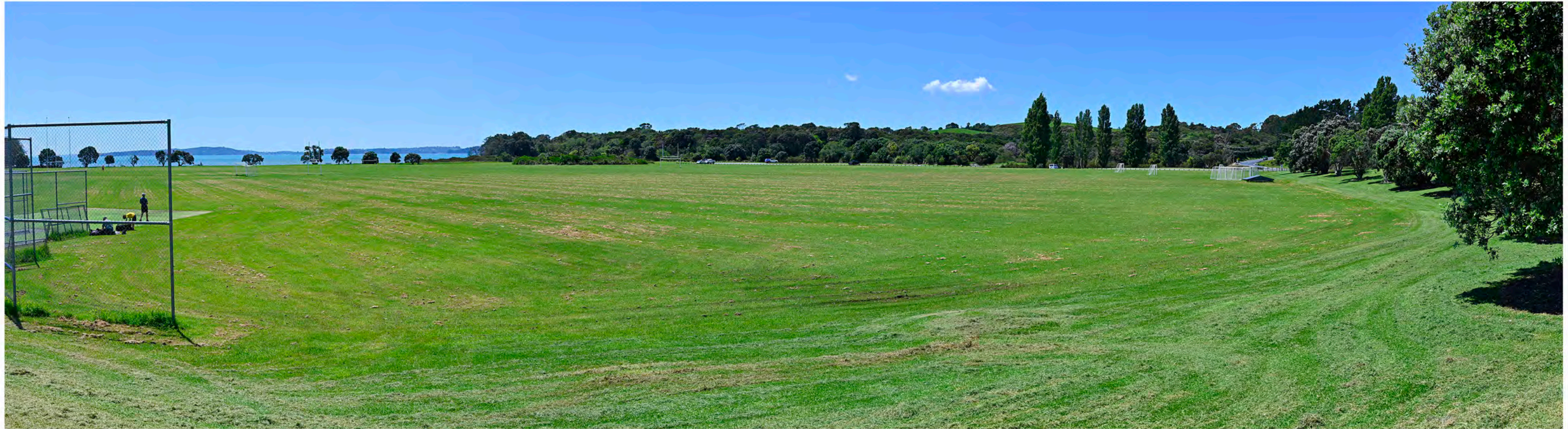
Looking across Te Puru Park at the edge of Beachlands towards Omana Regional Park & Maraetai