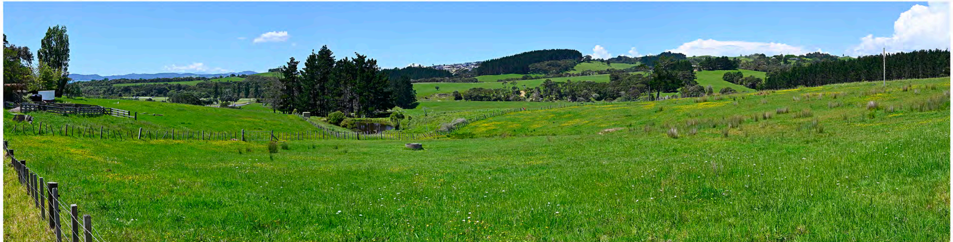
Looking towards the Beachlands Quarry & its gravel stockpiles directly east of Beachlands Road (above) & looking across intervening countryside towards Maraetahi (below)