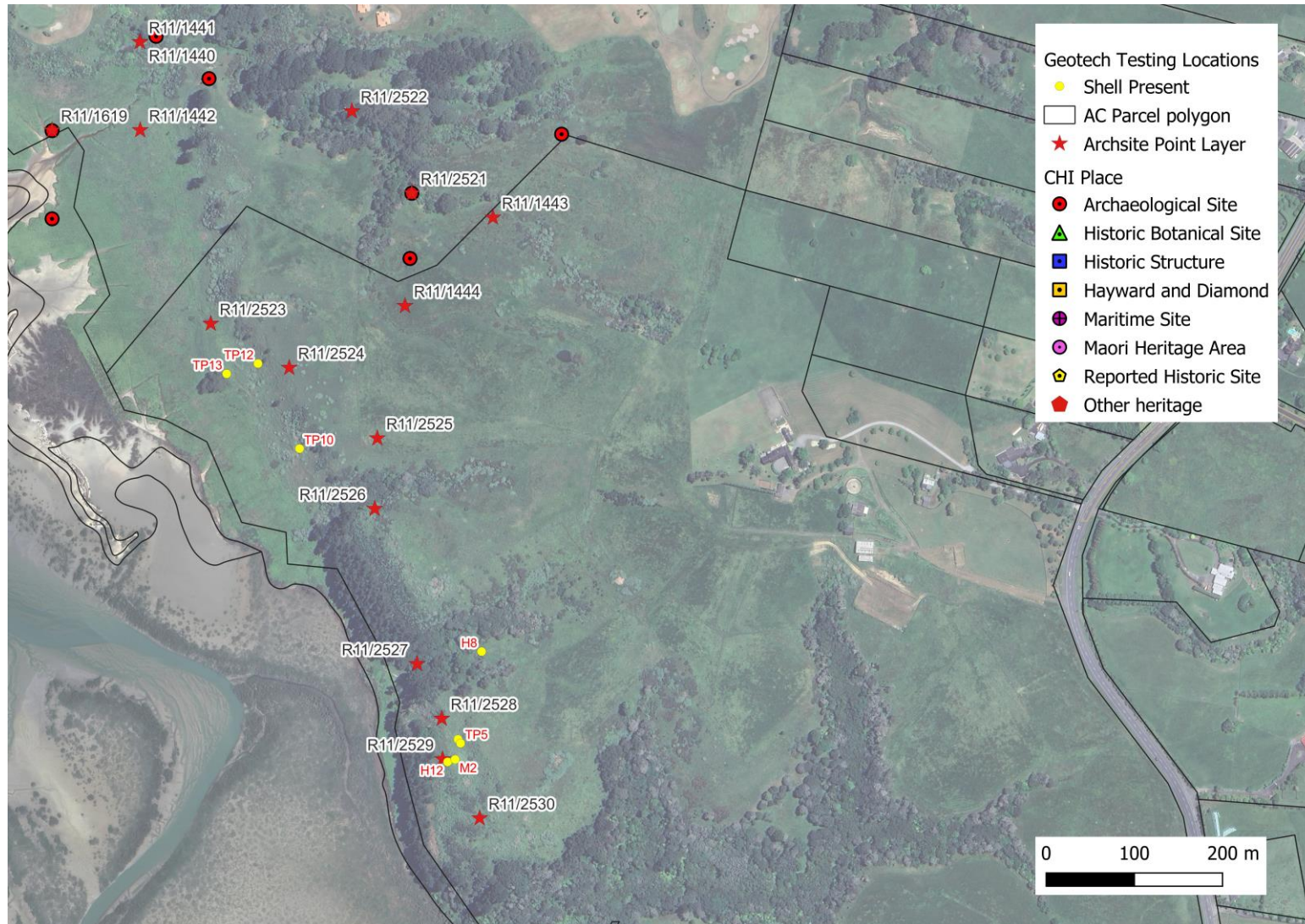
Figure 1. Plan showing geotechnical testing locations in relation to recorded archaeological sites