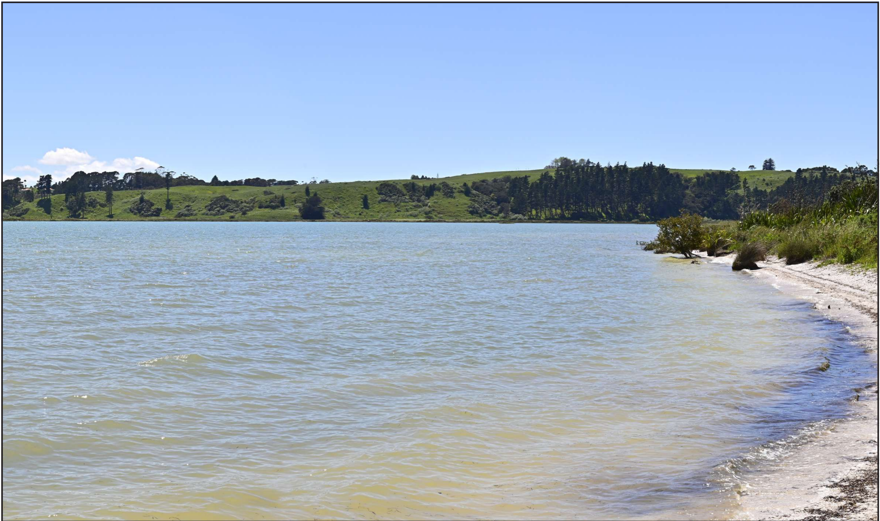
Viewpoint 08 - Existing

IMAGE TO BE VIEWED AT 50cm FROM EYE FOR CORRECT VIEWING SCALE WHEN PRINTED AT A3