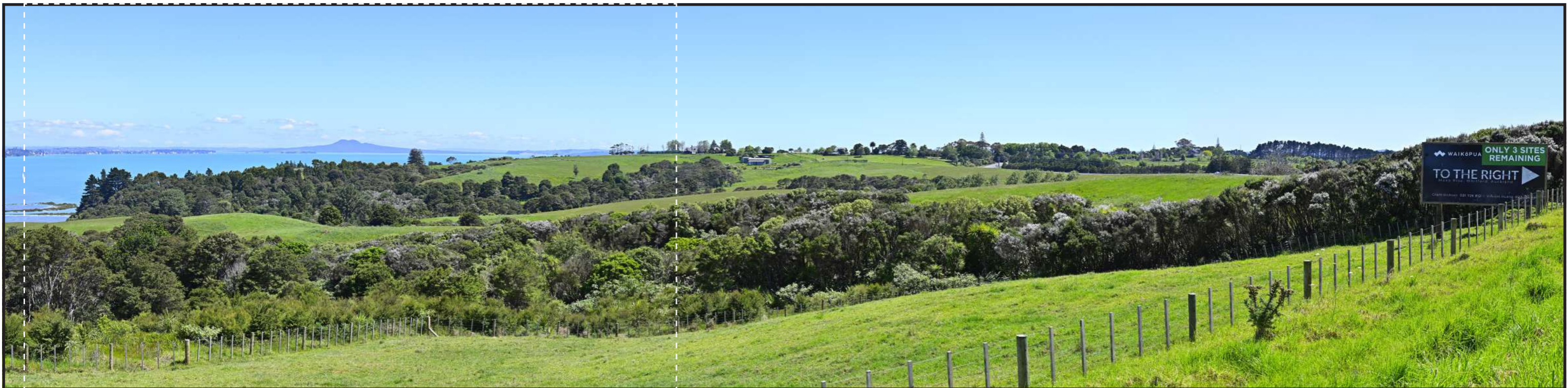
Viewpoint 07 - Proposed - No Future Urban Zone