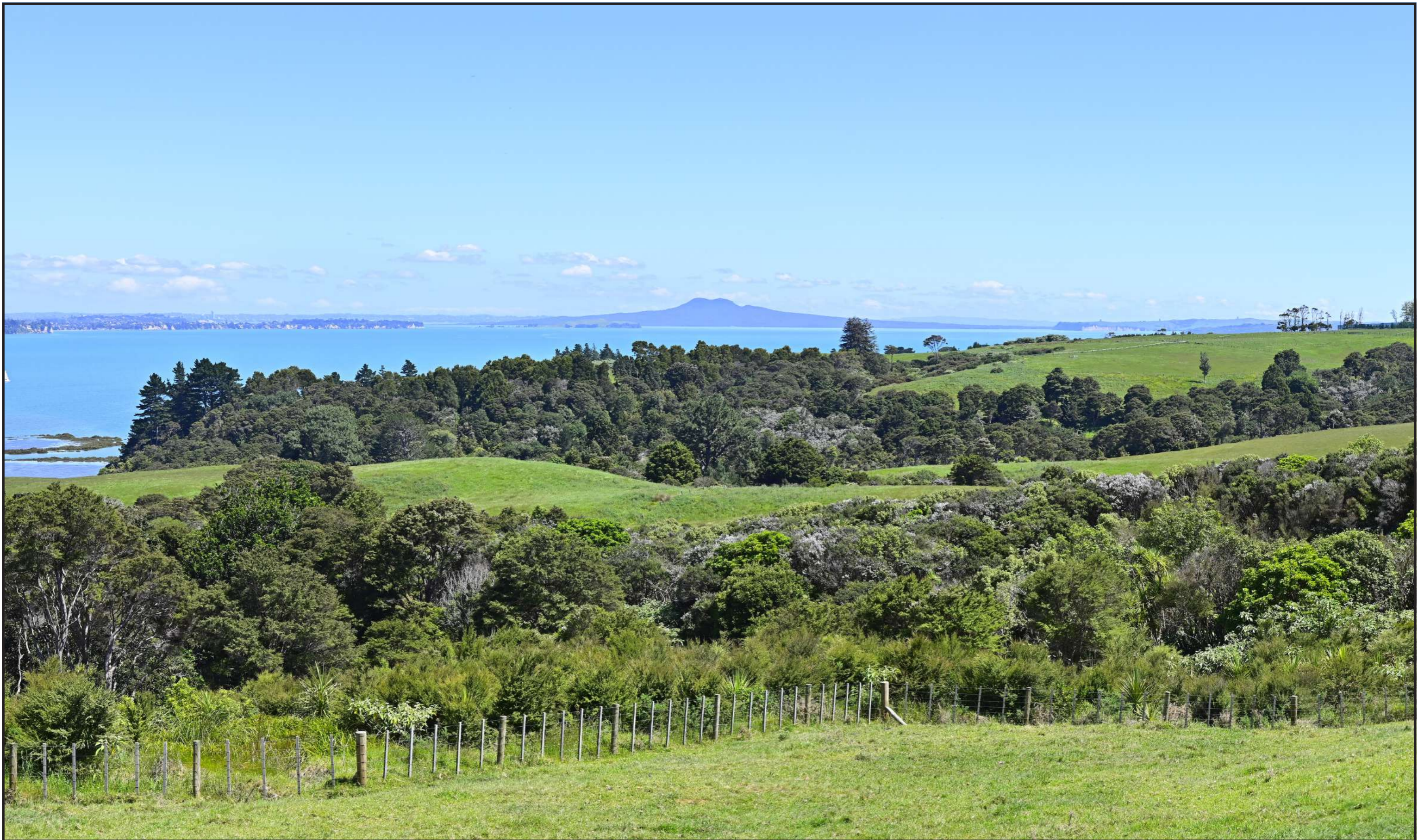
Viewpoint 07 - Existing

IMAGE TO BE VIEWED AT 50cm FROM EYE FOR CORRECT VIEWING SCALE WHEN PRINTED AT A3