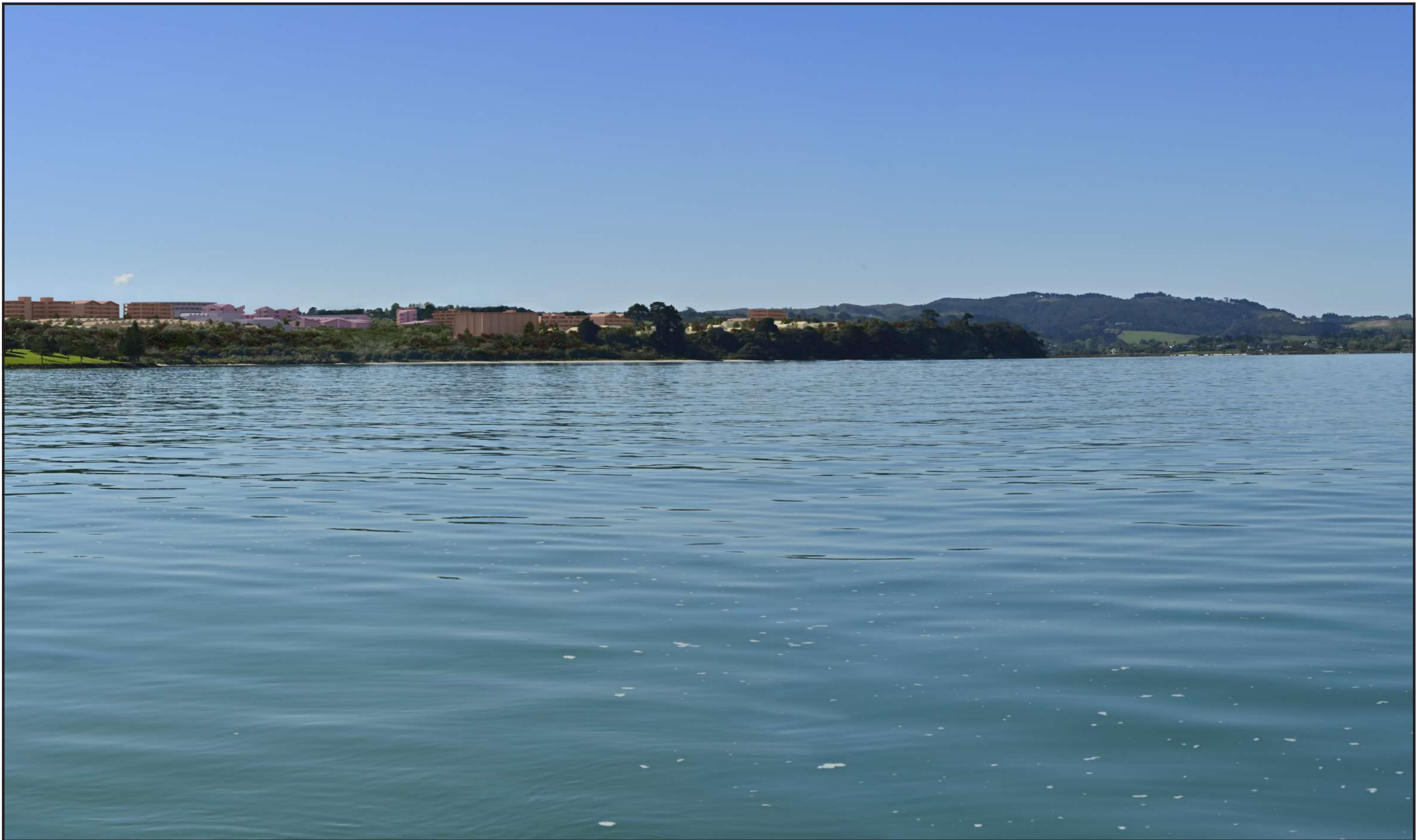
Viewpoint 09 - Proposed - No Future Urban Zone

IMAGE TO BE VIEWED AT 50cm FROM EYE FOR CORRECT VIEWING SCALE WHEN PRINTED AT A3