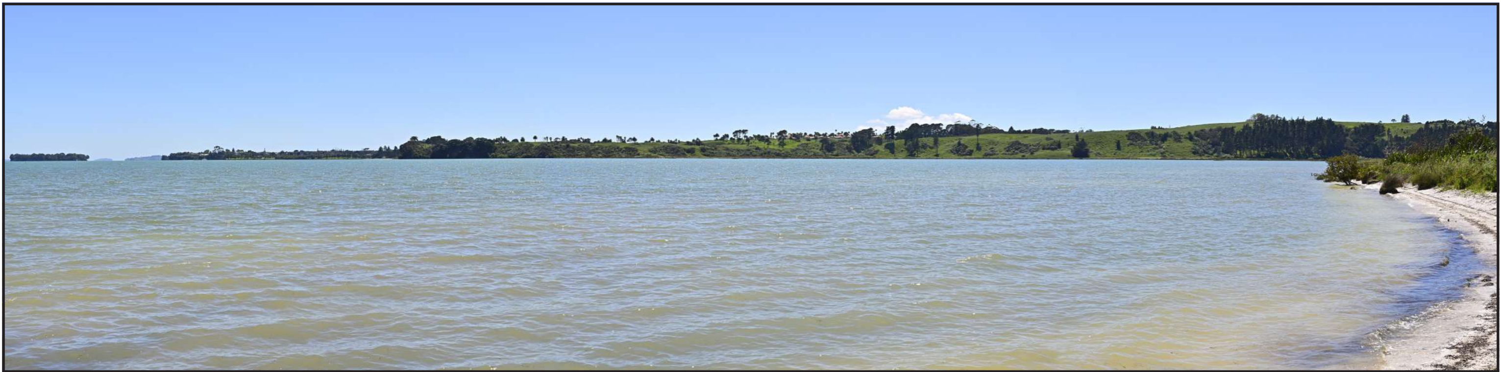
Viewpoint 08 - Existing