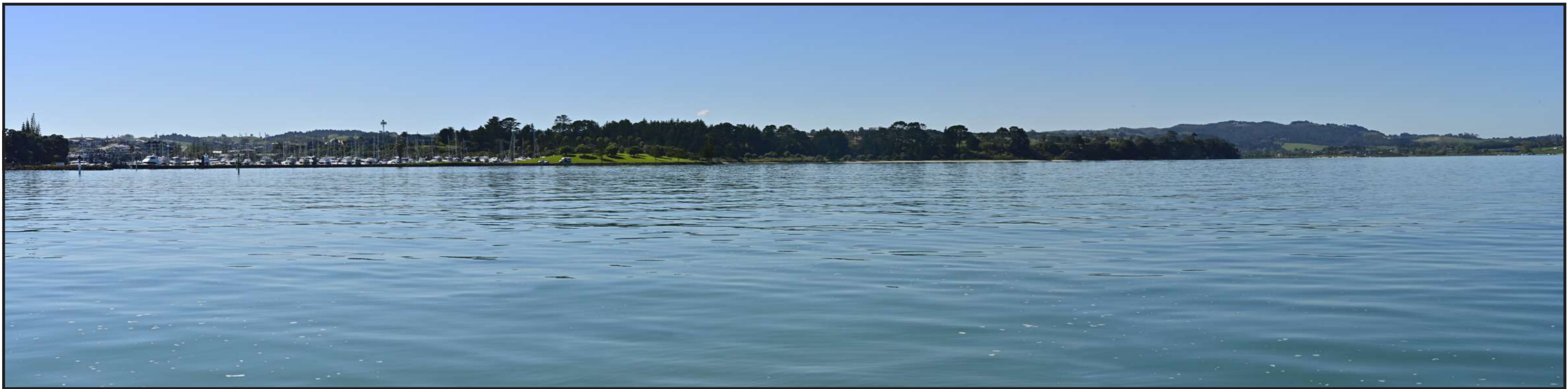
Viewpoint 09 - Existing