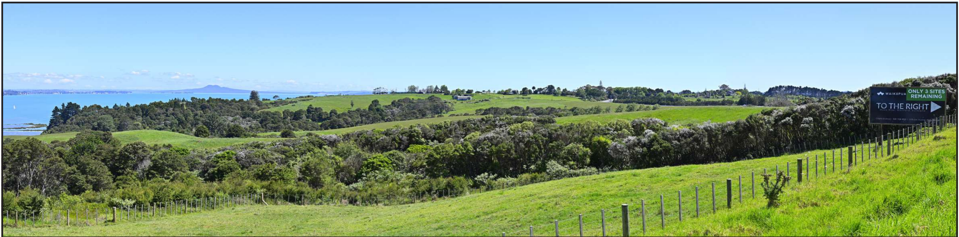
Viewpoint 07 - Existing