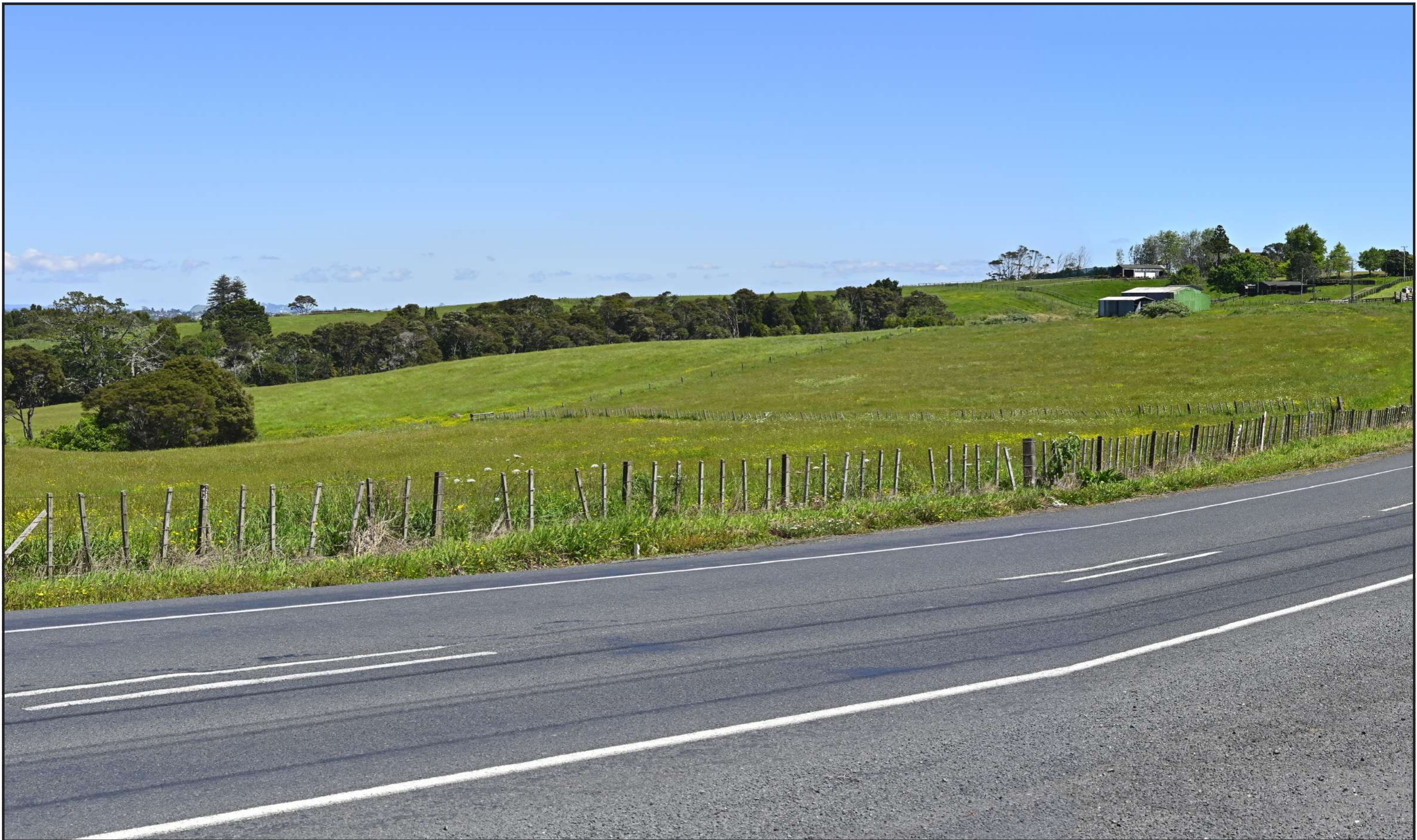
Viewpoint 06b - Existing

IMAGE TO BE VIEWED AT 50cm FROM EYE FOR CORRECT VIEWING SCALE WHEN PRINTED AT A3