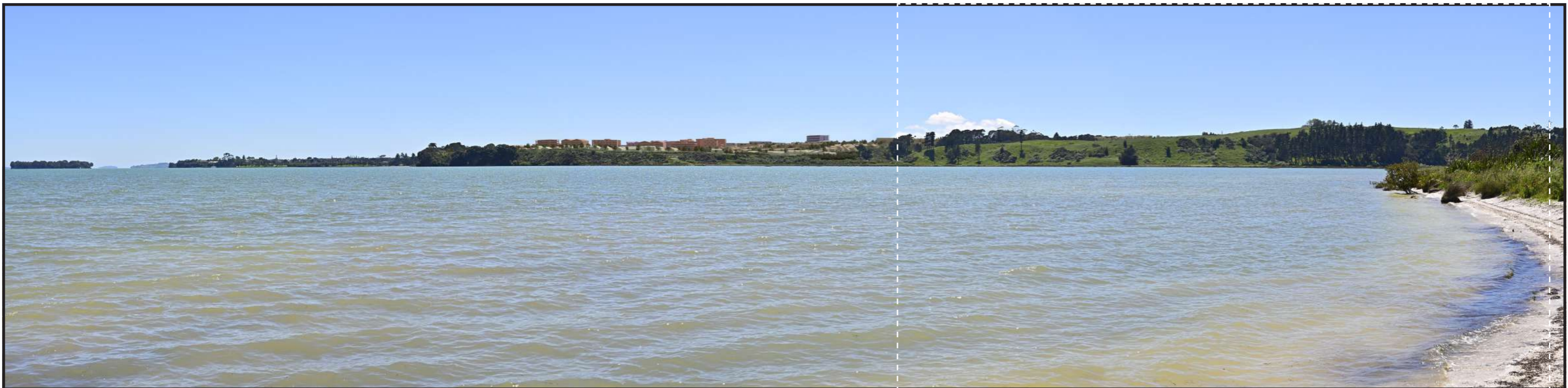
Viewpoint 08 - Proposed - No Future Urban Zone