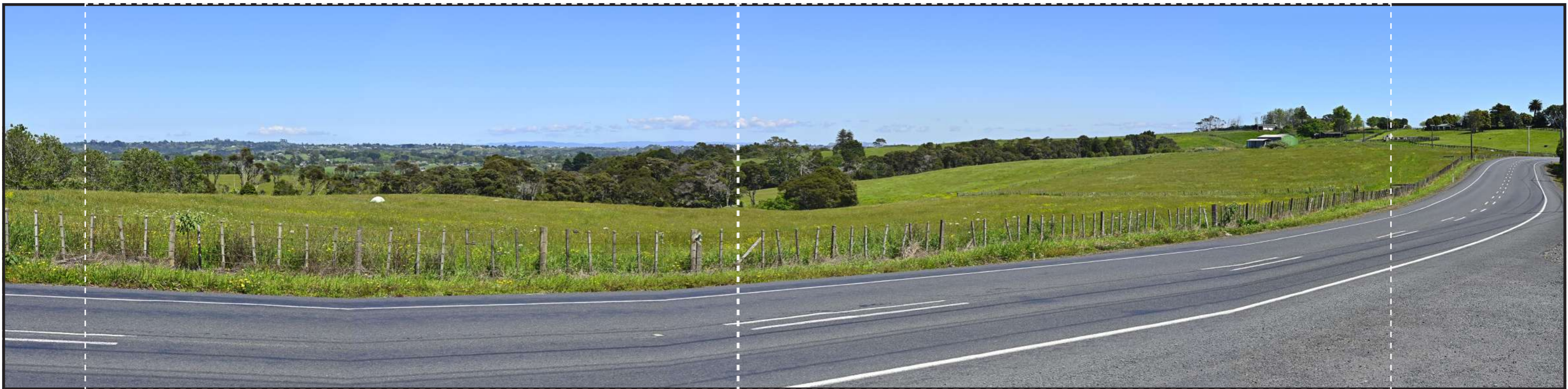
Viewpoint 06 - Proposed - No Future Urban Zone