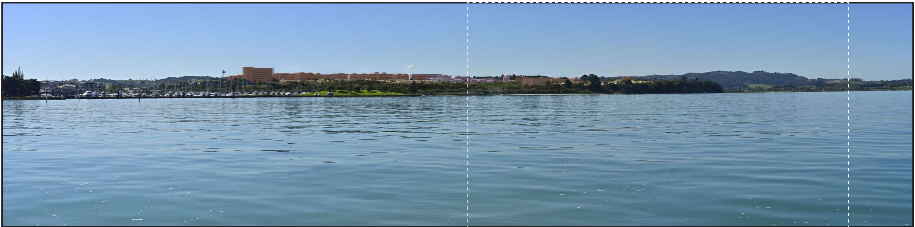
Viewpoint 09 - Proposed - No Future Urban Zone