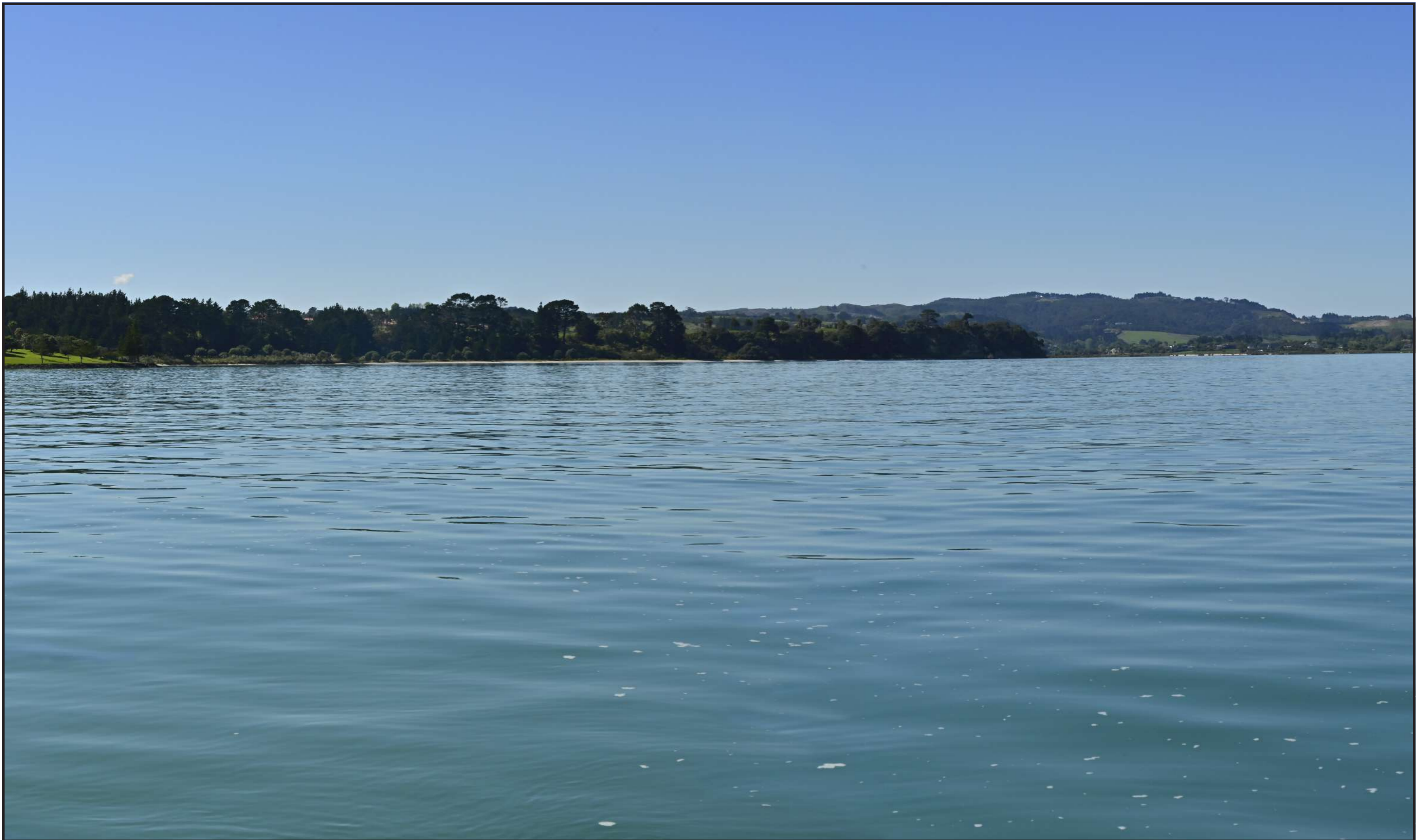
Viewpoint 09 - Existing

IMAGE TO BE VIEWED AT 50cm FROM EYE FOR CORRECT VIEWING SCALE WHEN PRINTED AT A3