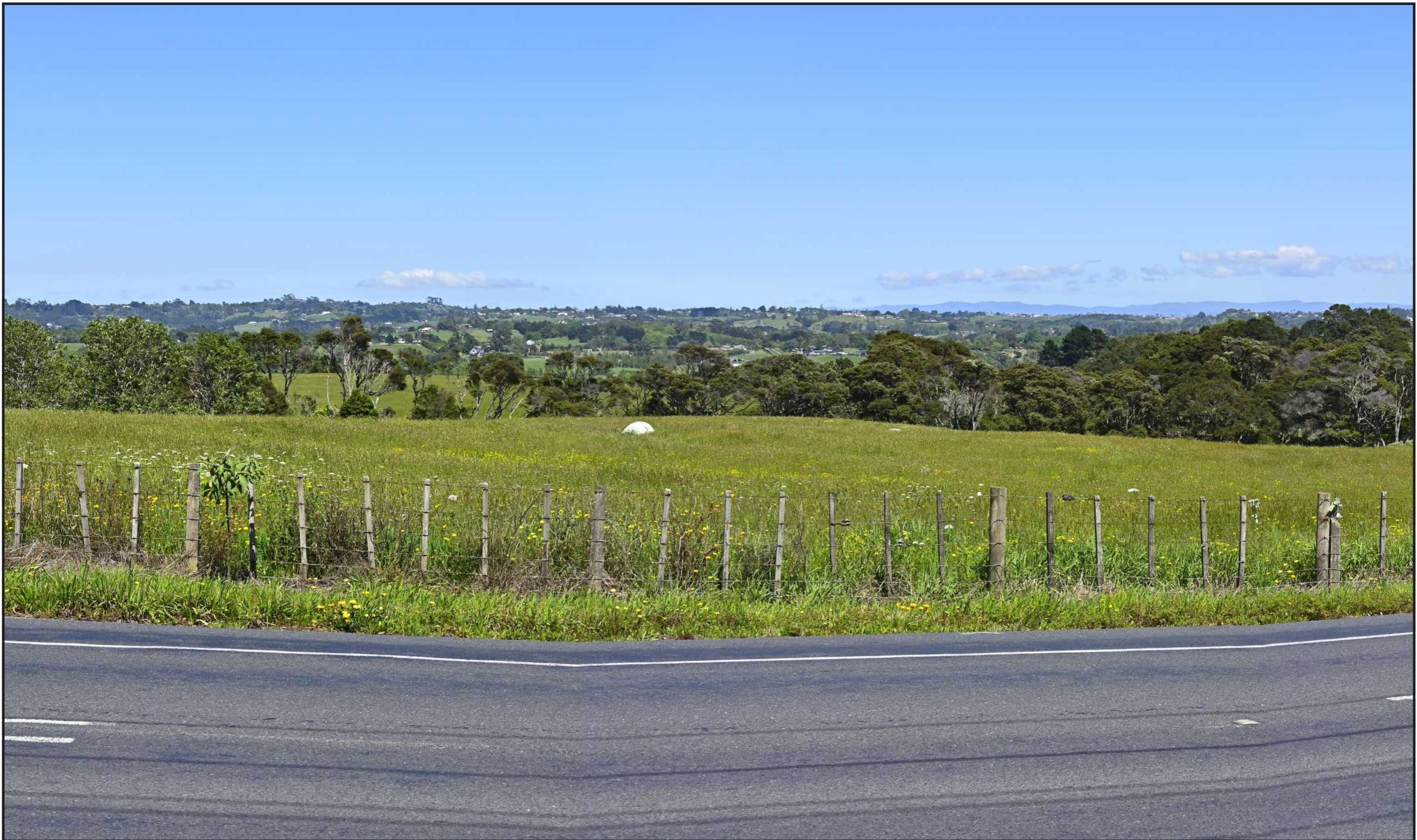
Viewpoint 06a - Existing

IMAGE TO BE VIEWED AT 50cm FROM EYE FOR CORRECT VIEWING SCALE WHEN PRINTED AT A3