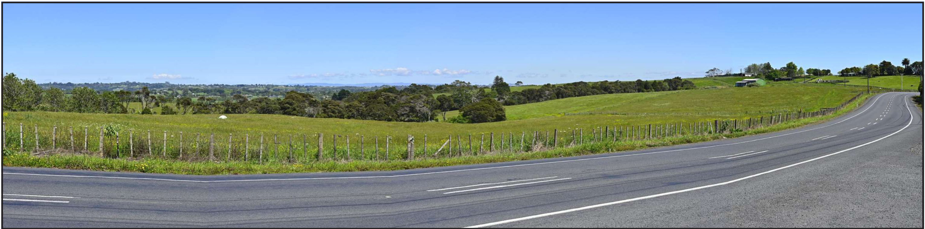
Viewpoint 06 - Existing