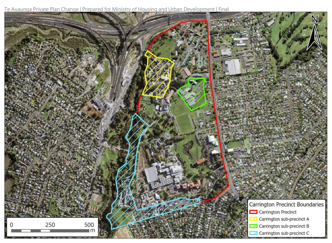
Figure 1: Wairaka Precinct (current)