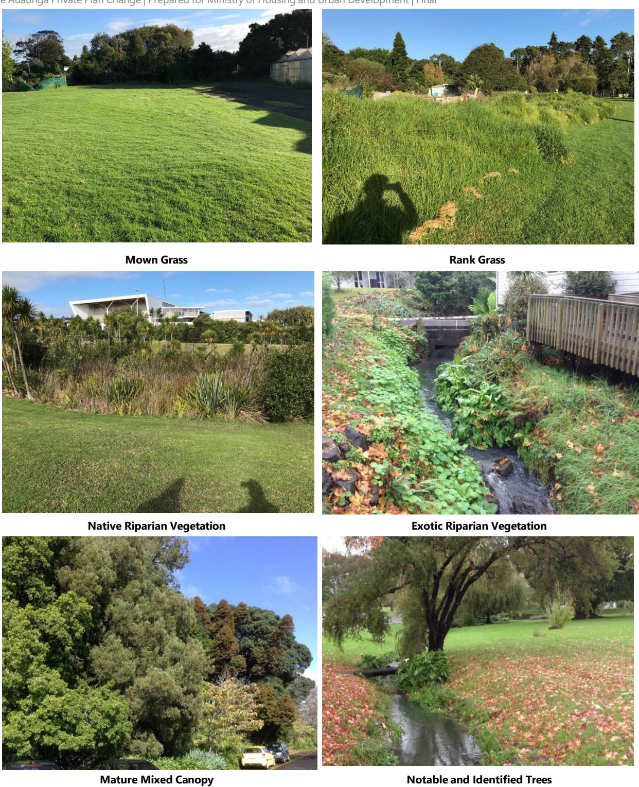
Figure 2: Indicative Site Photographs