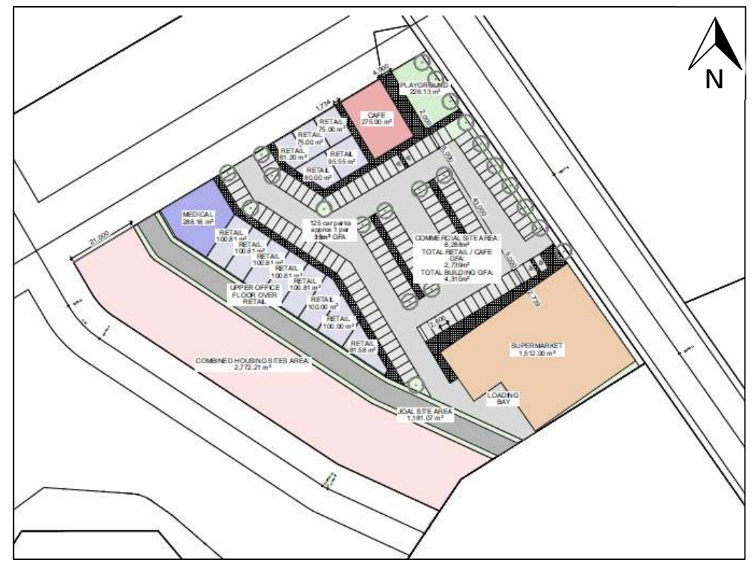
Figure 2: Proposed Commercial Development (Source: Smith Architects)