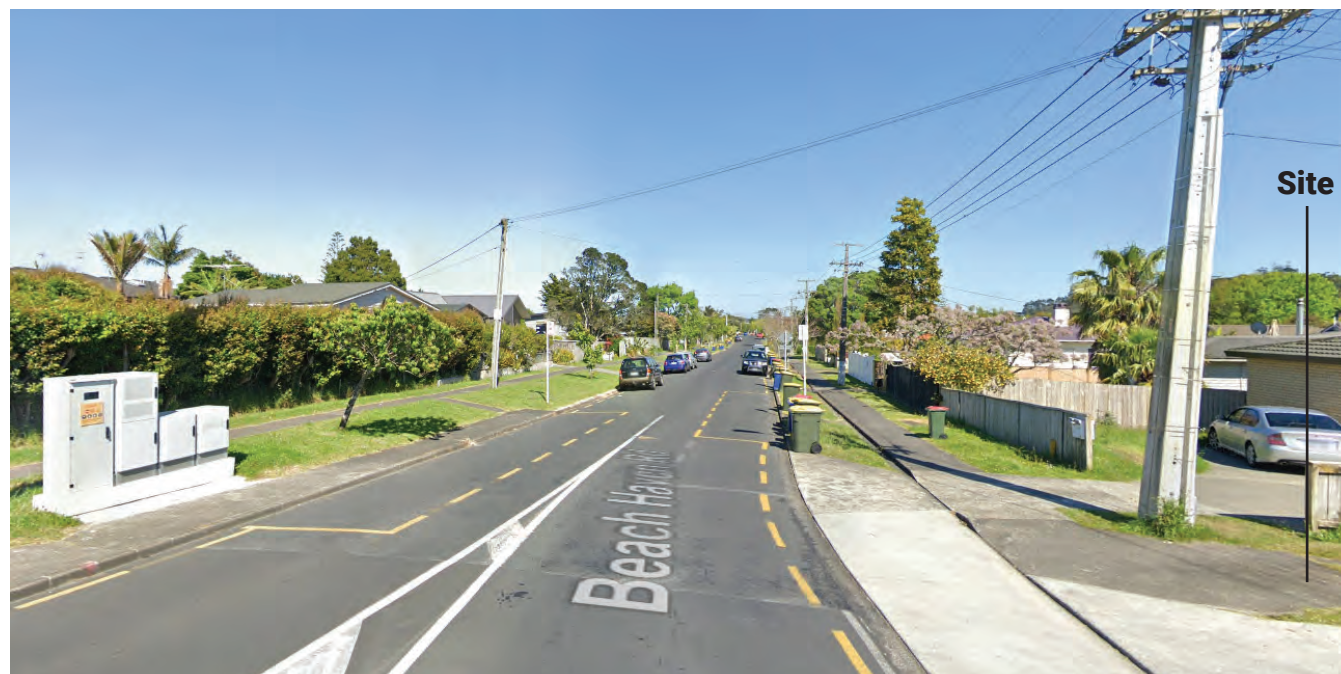
Looking west down Beach Haven Road from site entry - towards Ferry. Note: Bus stops in each direction outside of site