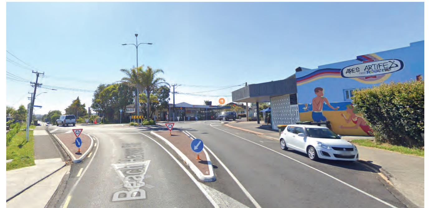
Looking east along Beach Haven Road from site entry - towards Local Centre