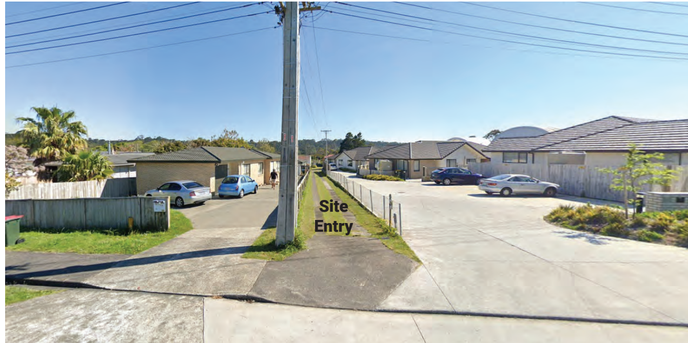
Site entry to Beach Haven Road