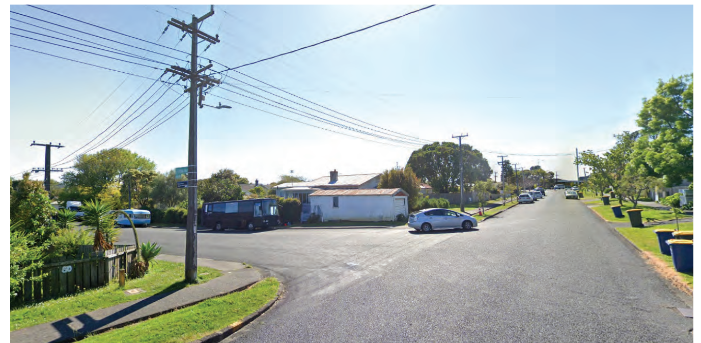
Looking east along Beach Haven Road from corner of Cresta Avenue