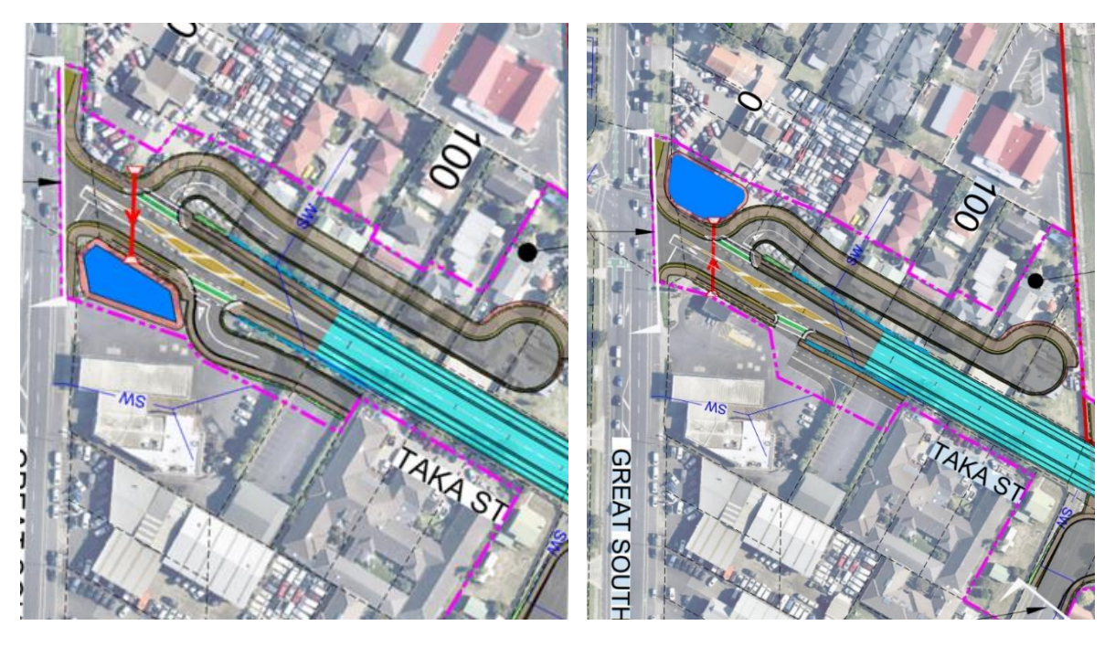
Figure 1 – Comparison between design/designation as lodged (left) and as currently proposed (right)