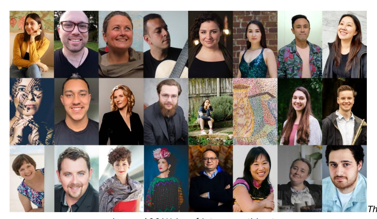
inaugural 6:24 Voices of Aotearoa participants.

Last year we launched a ground-breaking new initiative, 6:24 Voices of Aotearoa, bringing together teams of artists (each comprising a musician, a singer, a writer, and a composer) for a series of weekend workshops to develop new opera material collaboratively. 6:24 is designed to seed new work, discover new voices, challenge opera's parameters and who is permitted to participate in its creation.