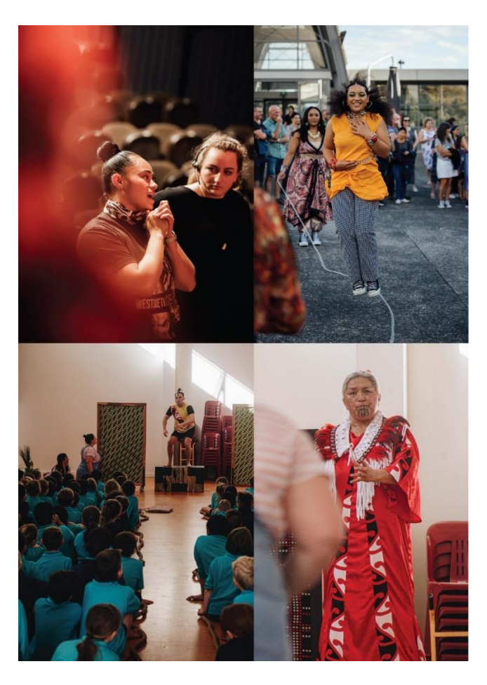
Top Row: Summer School. Bottom Row: Mahuika!

Further, the strategic decision made by ATC to present all their seasons at ASB Waterfront Theatre in 2021, to reduce our risk, decreased the number of hireable periods available. The combined affect is significantly less activity was delivered than planned.