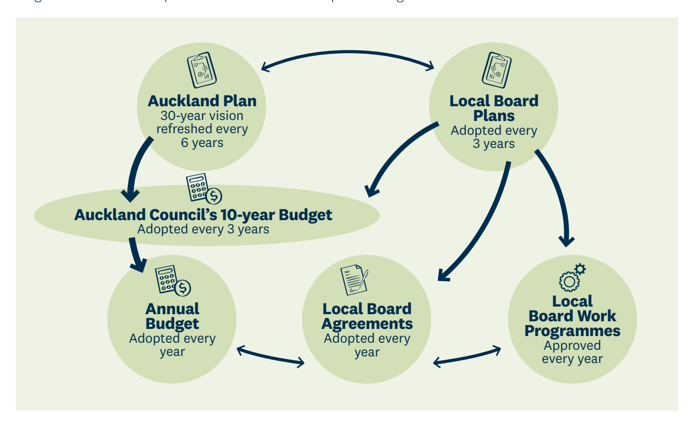
Diagram 1: The relationship between Auckland Council plans and agreements.

Local board agreements for 2023/2024 have been agreed between each local board and the Governing Body and are set out in Part 2.