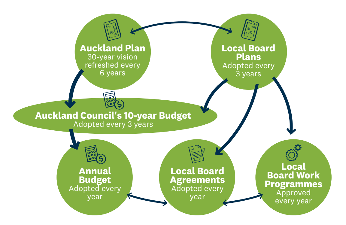
Diagram 1: The relationship between Auckland Council plans and agreements.

Local board agreements for 2021/2022 have been agreed between each local board and the Governing Body and are set out in Section 2.