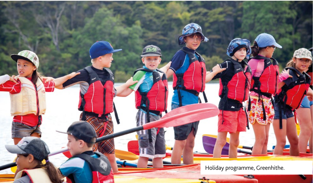
Holiday programme, Greenhithe.