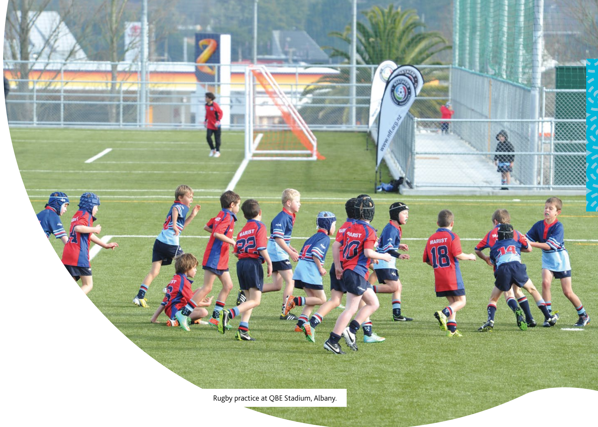
Rugby practice at QBE Stadium, Albany.

We know that people live their lives across local board boundaries and we will continue to collaborate with our neighbouring local boards to get the best results for the north-west.