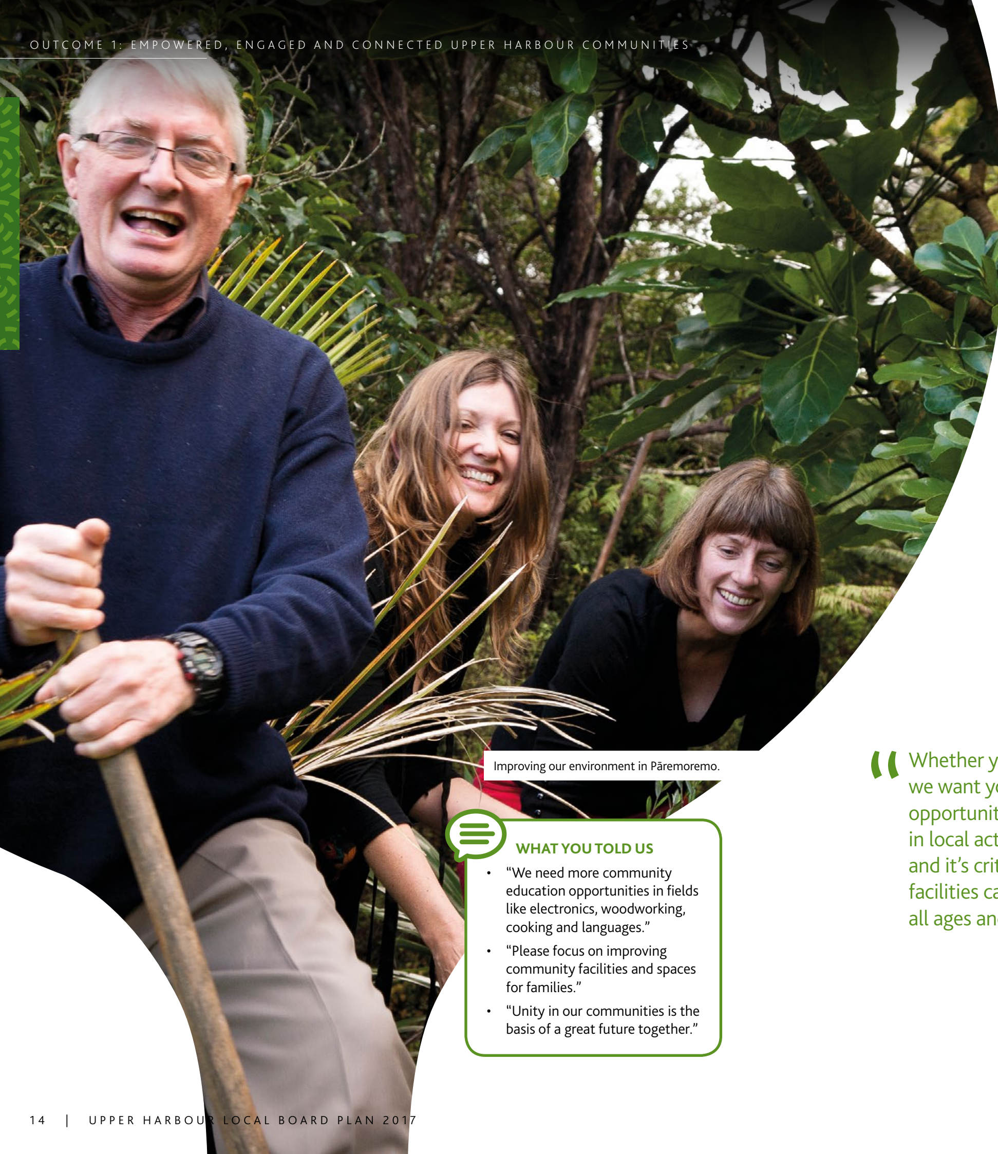
Improving our environment in Pāremoremo.