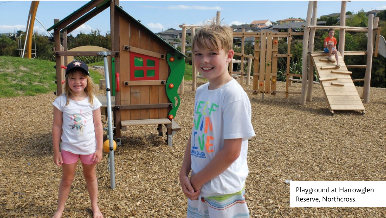
Playground at Harrowglen Reserve, Northcross.