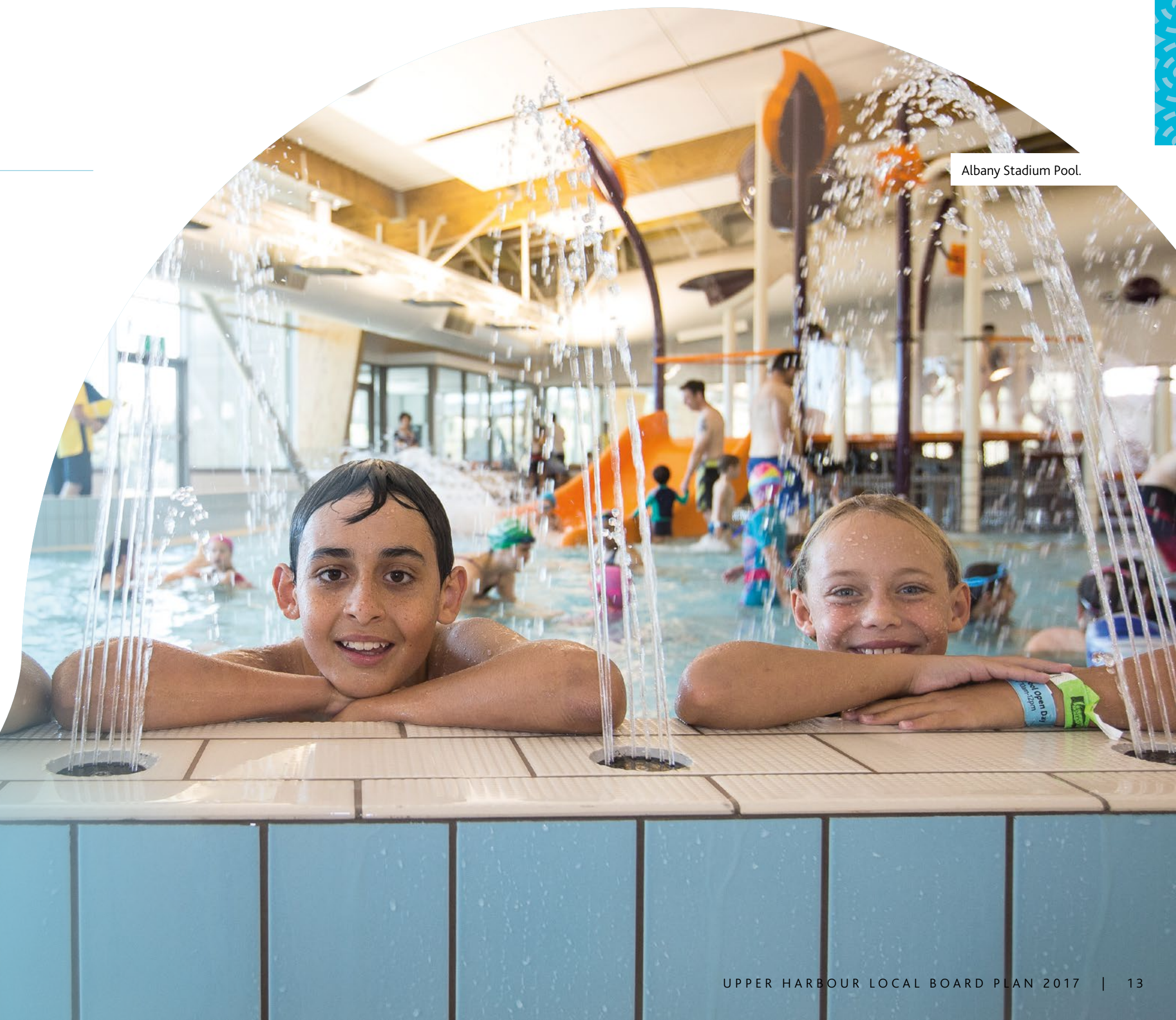
Albany Stadium Pool.

Our work here references current Auckland Council planning documents, including the Auckland Unitary Plan, The Auckland Plan, I Am Auckland Strategic Action Plan, Community Facilities Network Plan, Low Carbon Auckland, Parks and Open Spaces Strategic Action Plan, Sport and Recreation Strategic Action Plan and the Upper Harbour Local Economic Development Action Plan.