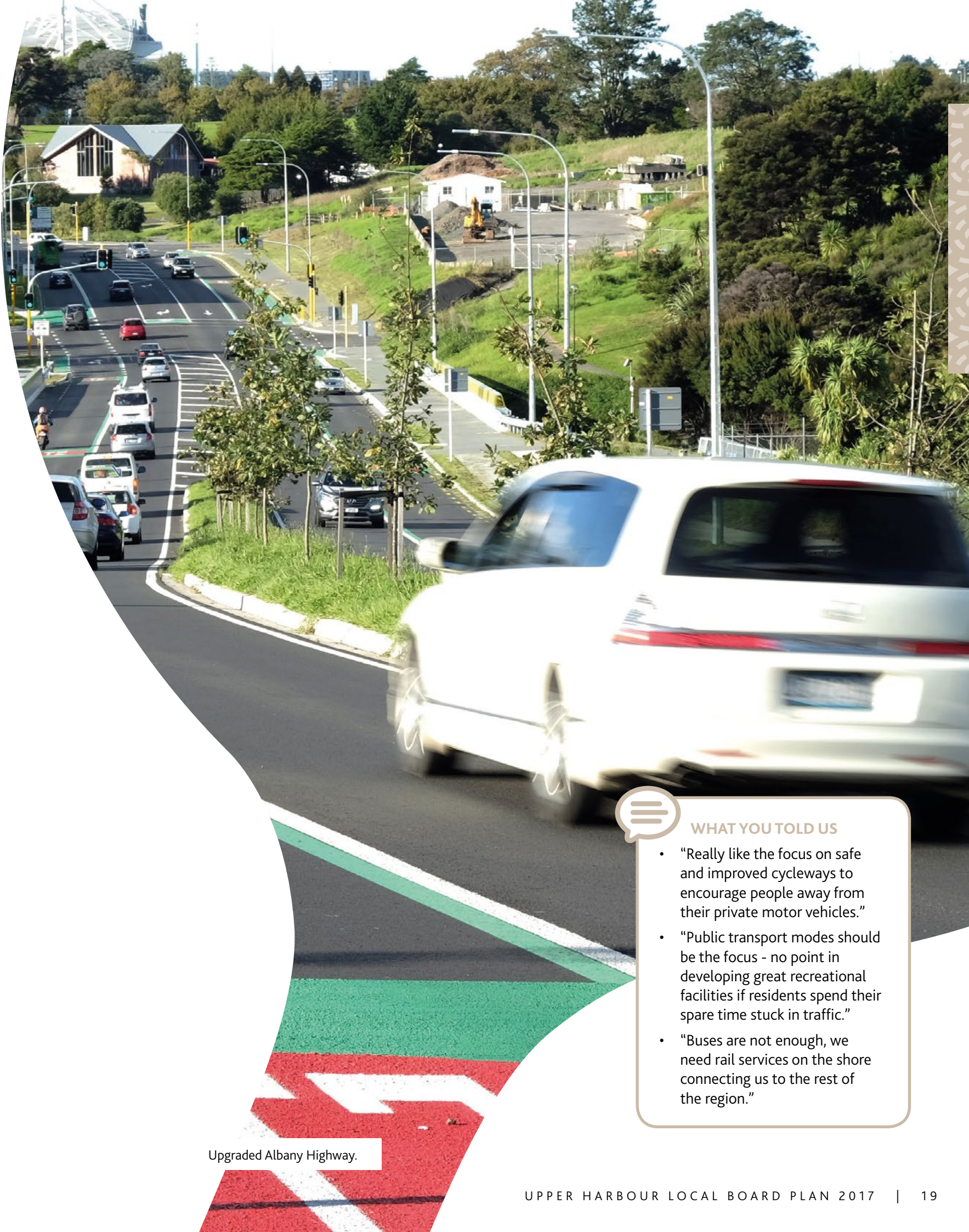
Upgraded Albany Highway.

The ferry services to Hobsonville Point and West Harbour are very popular. We'll work with Auckland Transport to find ways of increasing the number of sailings and expand services to include weekends.