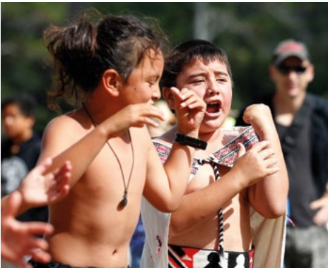
Pāremoremo community event.

We will focus on five outcomes to guide our work and make Upper Harbour a better community for all. Our aspirations are outlined below.