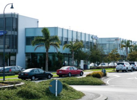
Apollo Drive business area.

Our residents have access to open space and a wide variety of sports and recreation opportunities.