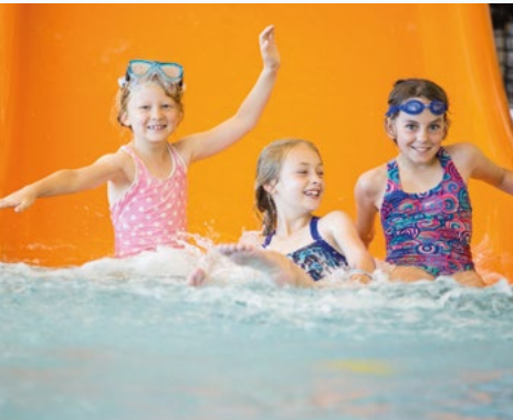
Water play at Albany Stadium Pool.

A well-connected and accessible network that provides a variety of transport options.