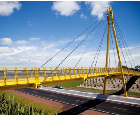
Clarks Lane walking and cycling bridge.

People living in Upper Harbour are able to influence what happens in their neighbourhoods.