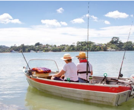
Fishing on the upper Waitematā Harbour.

A prosperous and innovative local economy, with job opportunities for local residents to work close to home.