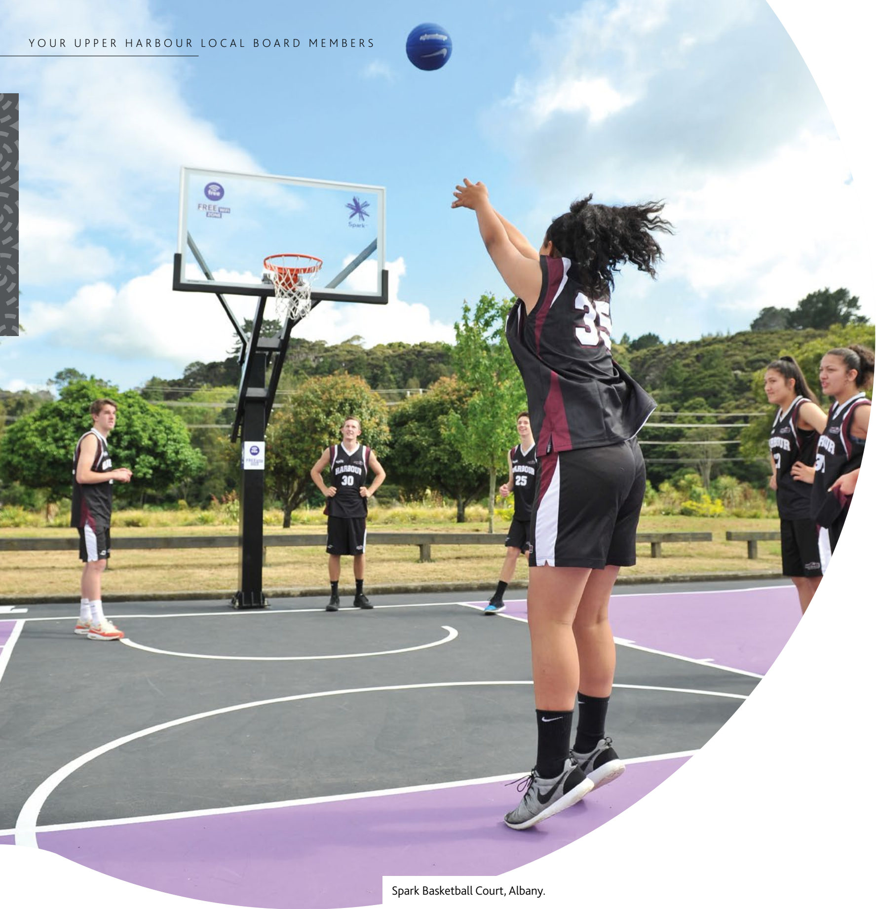
Spark Basketball Court, Albany.