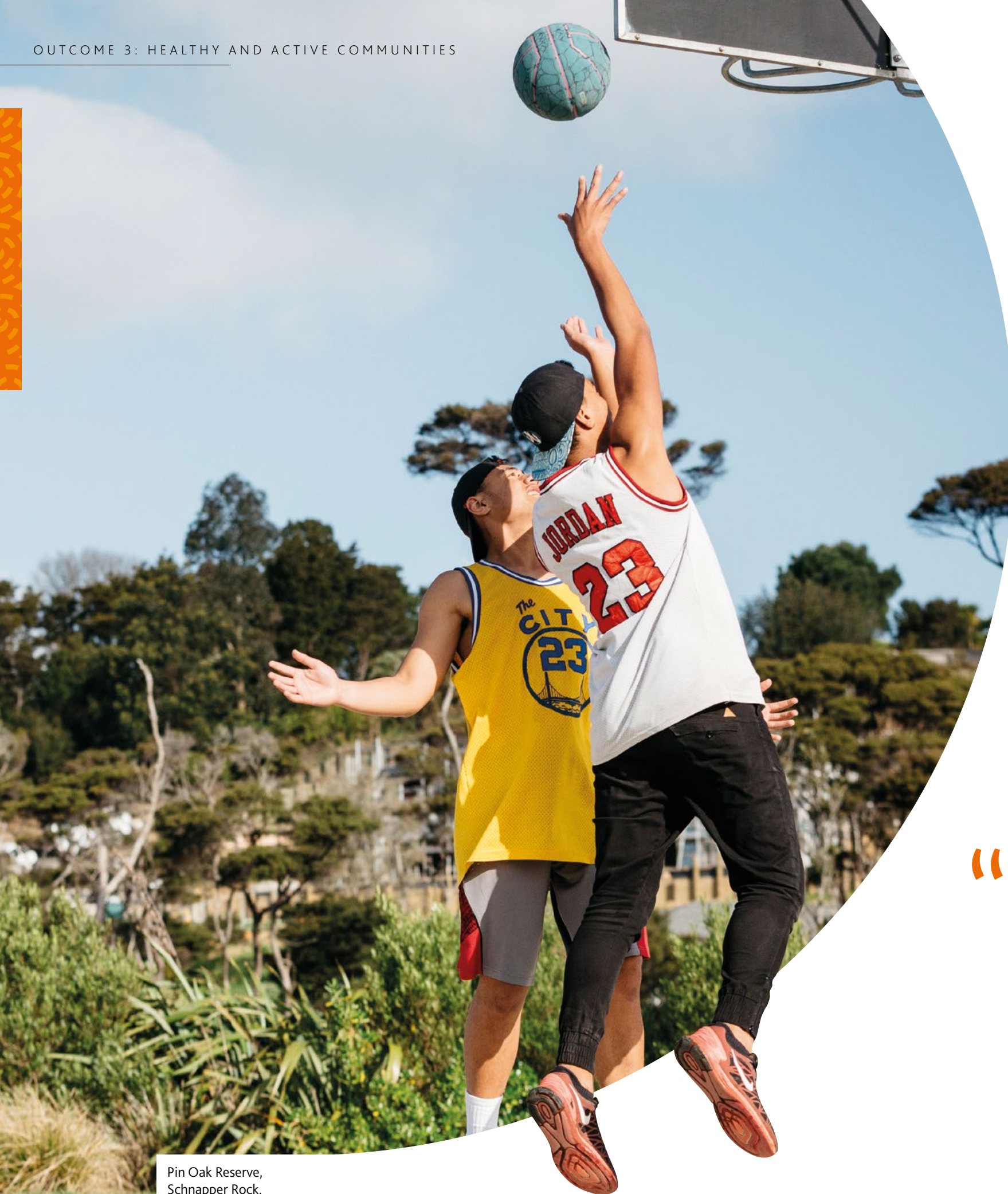
Pin Oak Reserve, Schnapper Rock.