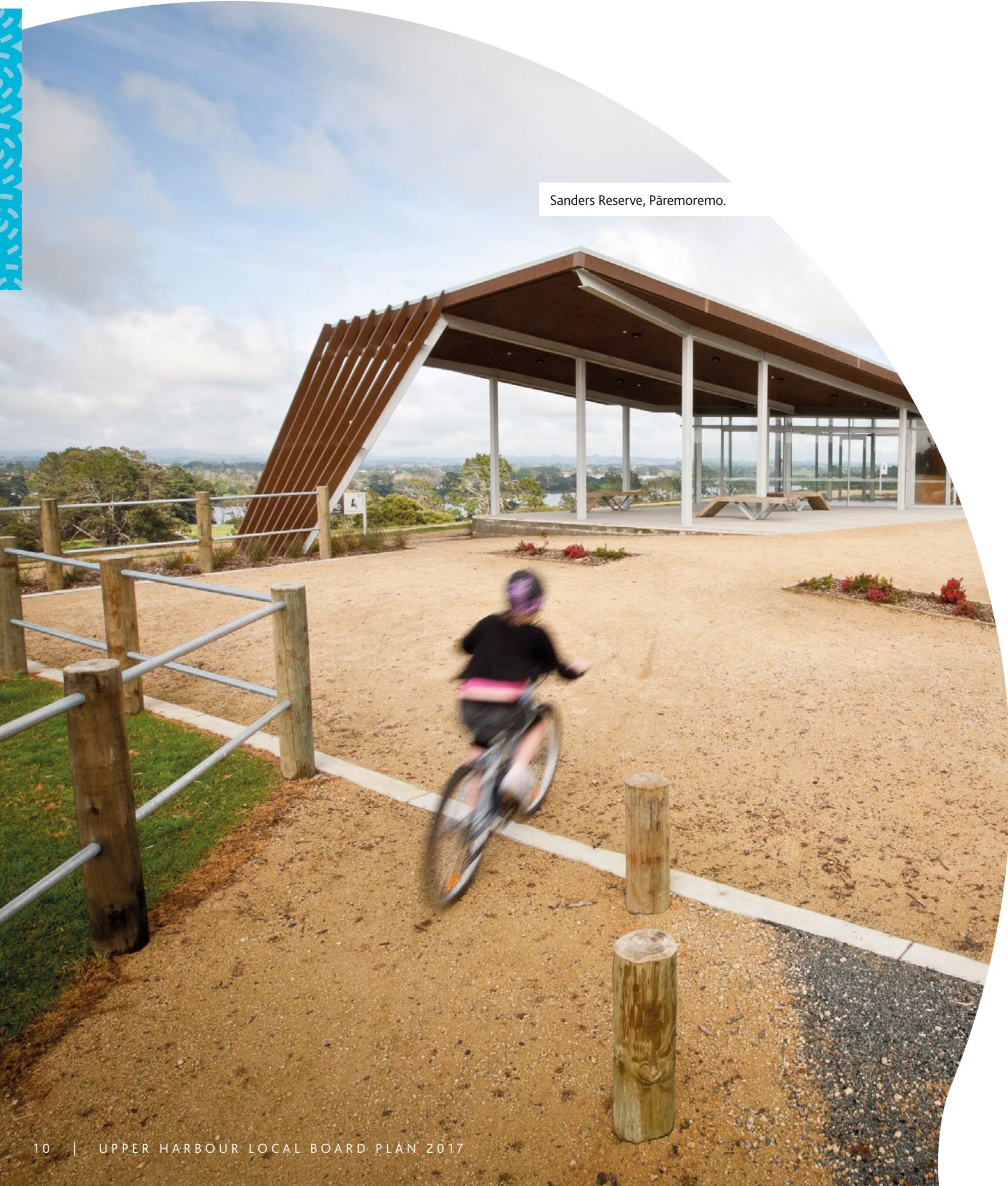
Sanders Reserve, Pāremoremo.