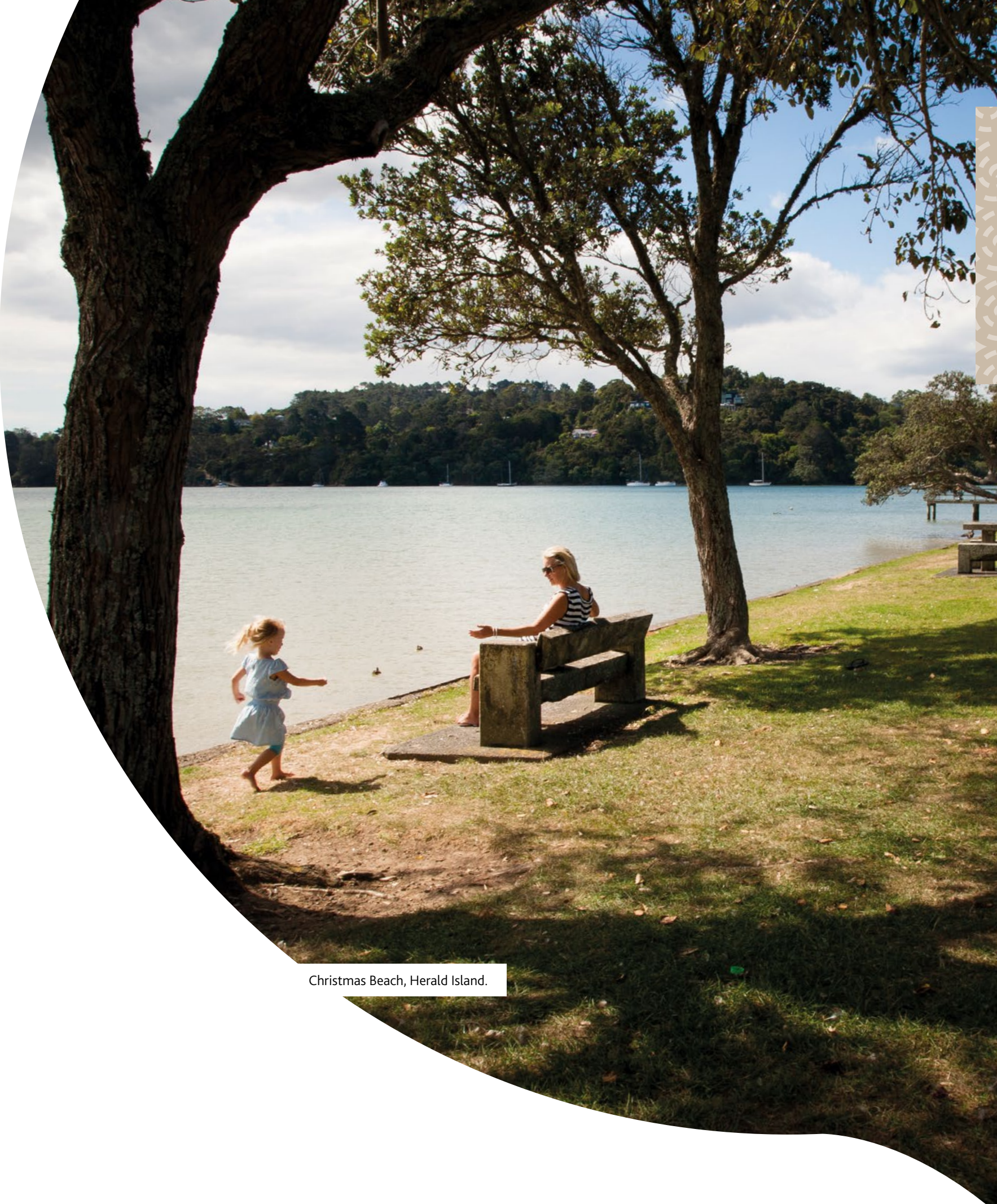
Christmas Beach, Herald Island.

You've told us that improving the quality of our creeks, streams and harbour is important to you and we will work to boost the ecological health of our waterways and other natural areas through targeted restoration and conservation efforts. Nature is very good at repairing itself and we want to create resilient, ecologically sound landscapes that strengthen environmental health and community well-being. One example is the Rāwiri Stream restoration which includes building stormwater ponds, removing pest plants and planting out the banks. The restoration project will also create access to additional open space in Hobsonville.