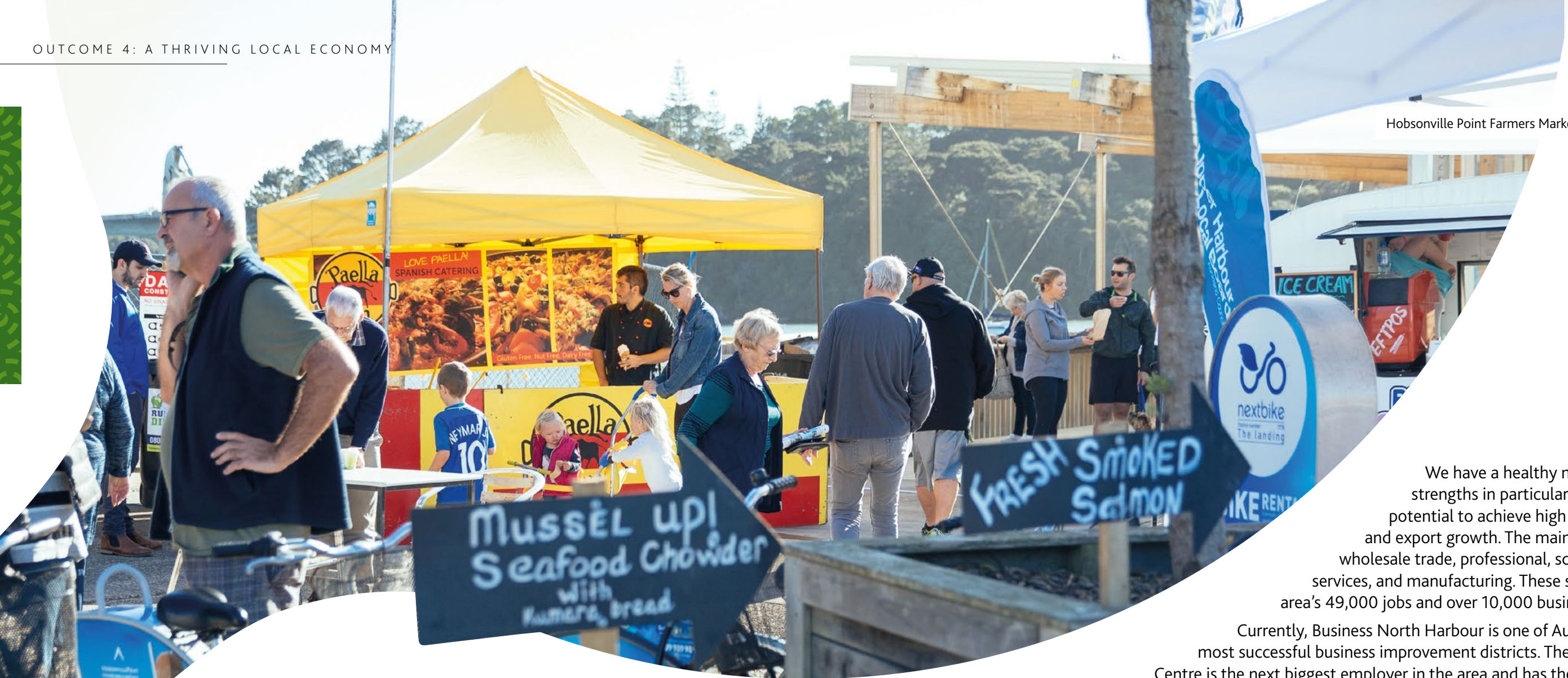
Hobsonville Point Farmers Market.