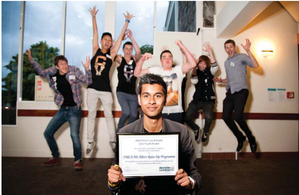
2012 volunteer award recipients from Mt Albert YMCA's Raise Up Programme