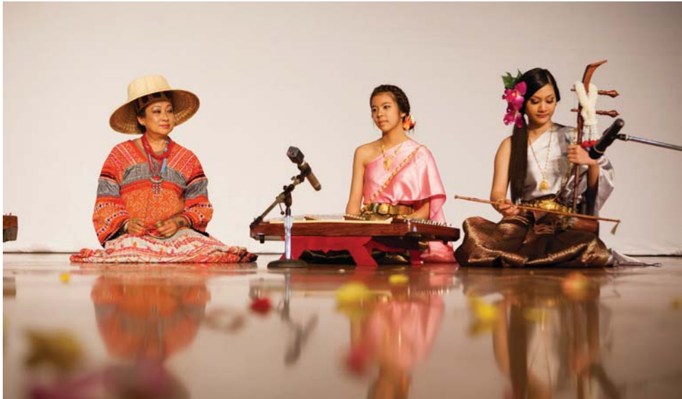
ASEAN Festival – celebrating south-east asian culture at the Greenlane Showgrounds

The board has also been working with ethnic businesses in Balmoral to empower them to improve local business opportunities.