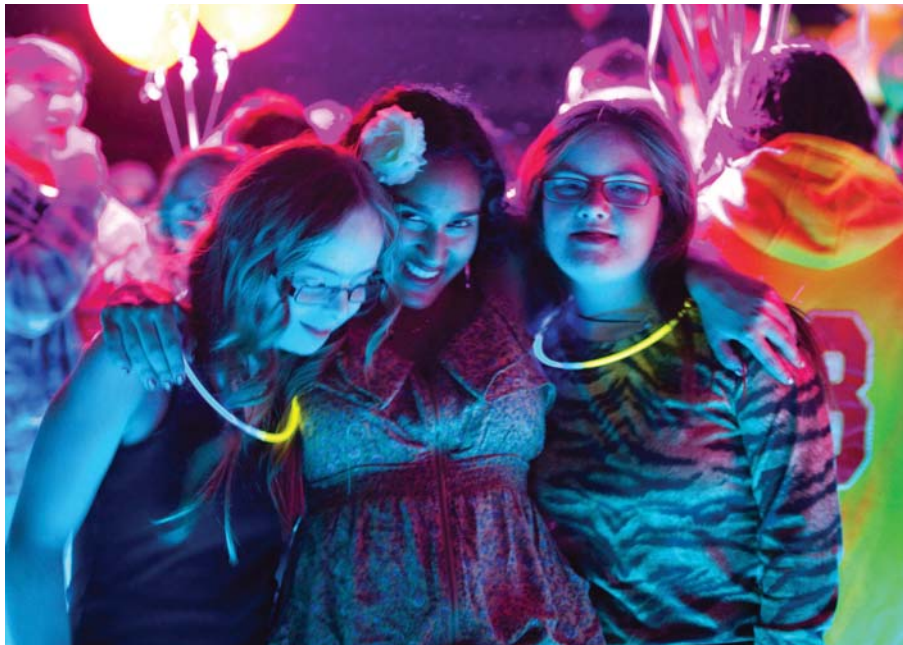
Disco for youth with disabilities took place at Roskill Youth Zone on June 22