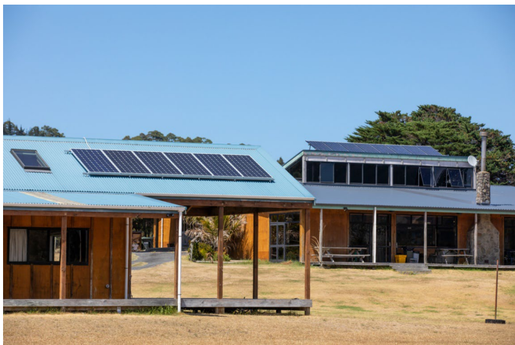
Solar panels at the Great Barrier Island Sports and Social Club