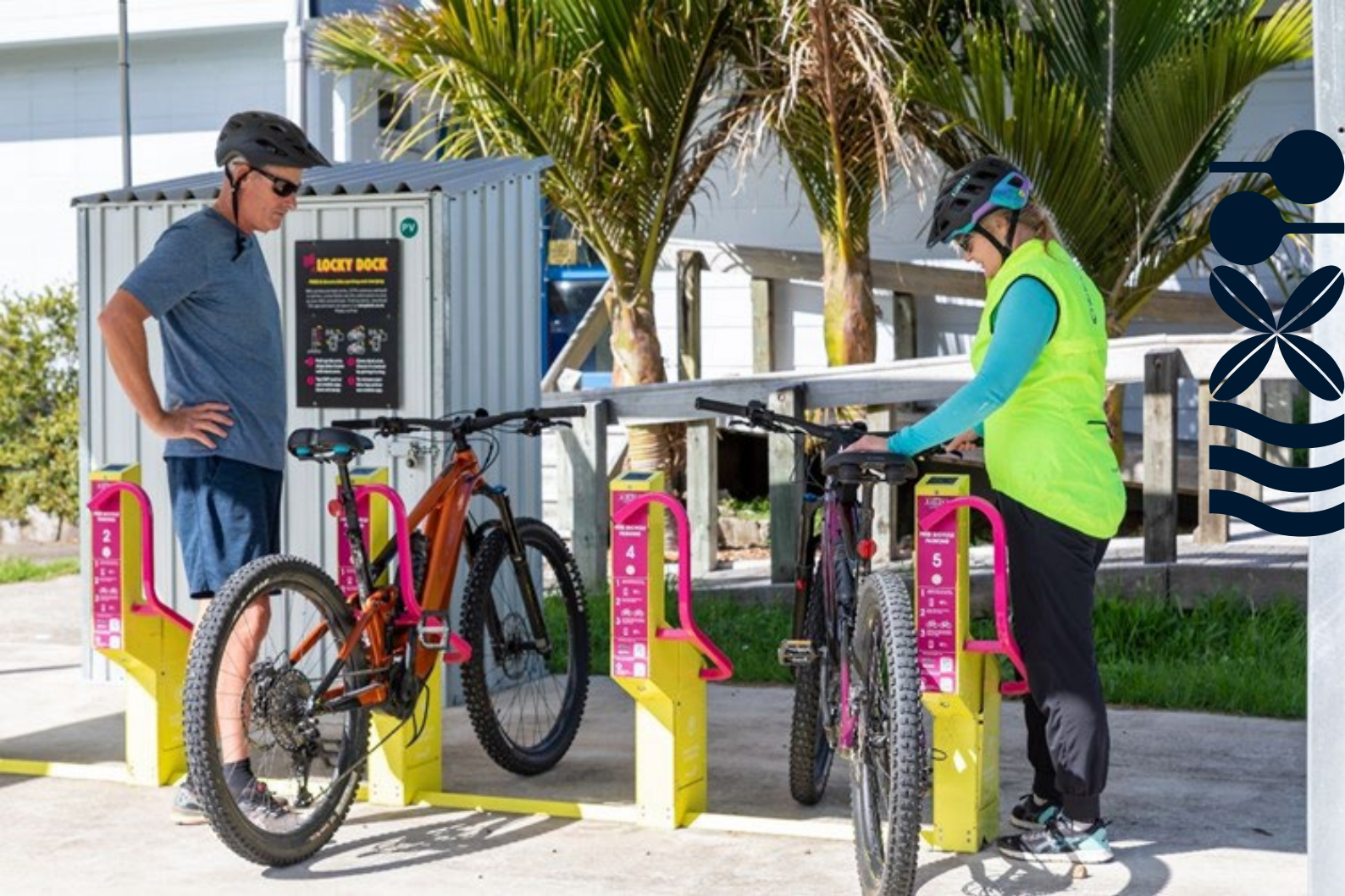
Locky-dock electric bike charging at Claris