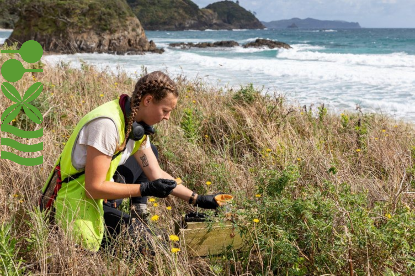
Pest control, Oruawharo / Medlands