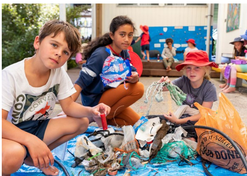
Coastal clean-up, Okiwi School