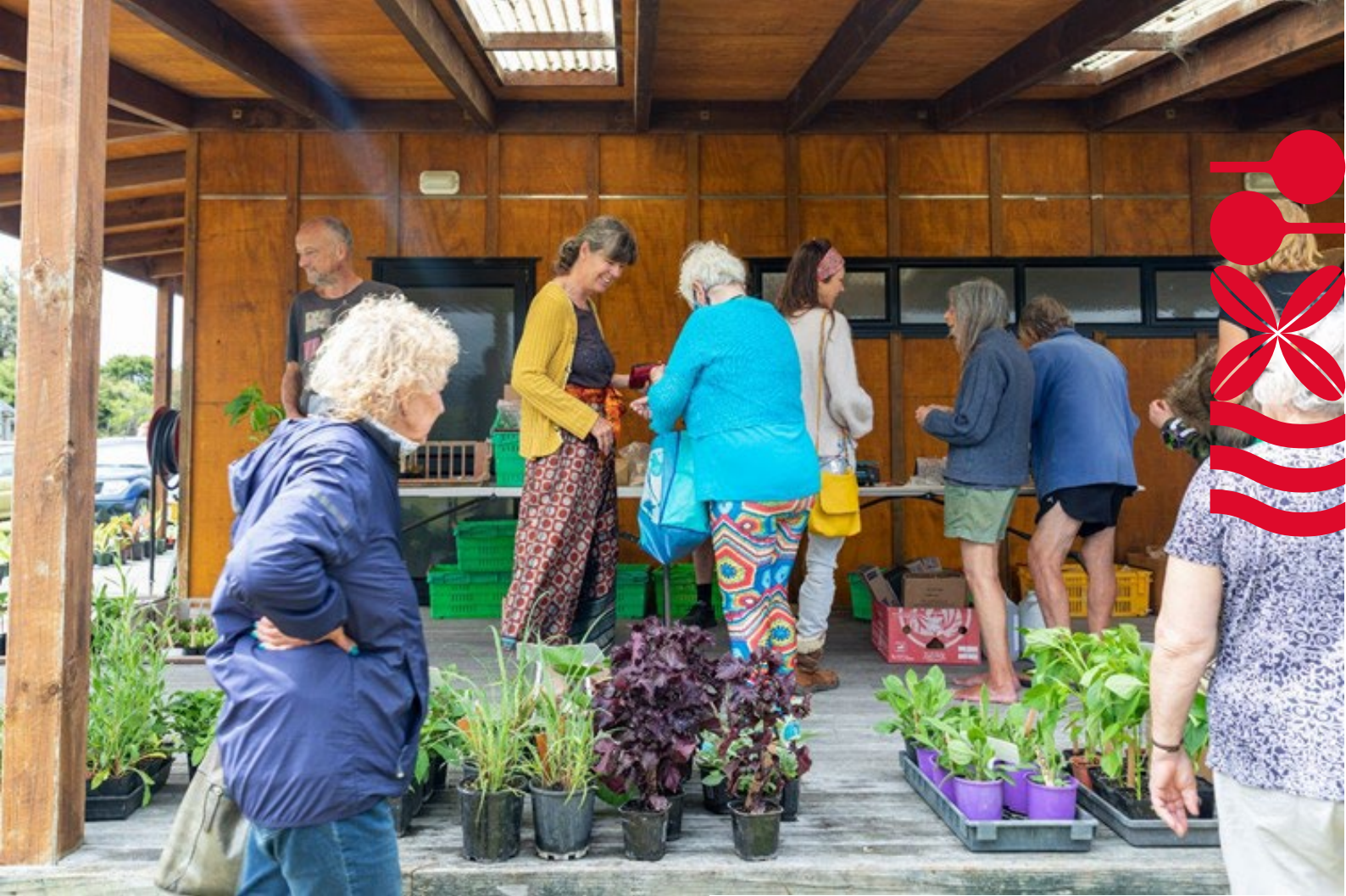
Growers and Makers Market, Claris Conference Centre