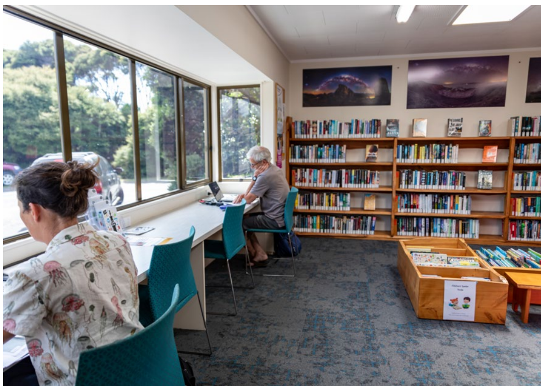
Great Barrier Island Library and Service Centre