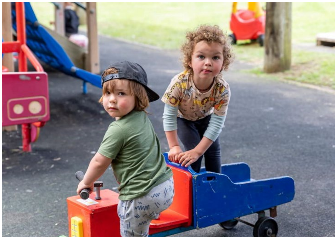
Kids at the Early Childhood Centre