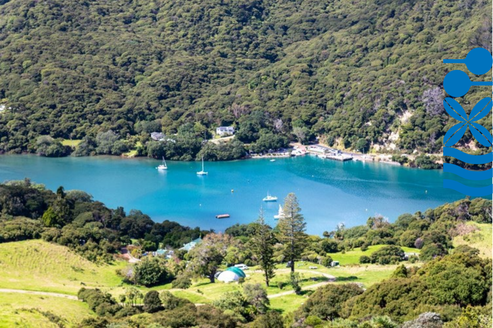
View from Glenfern Sanctuary Regional Park