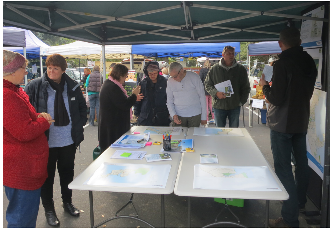
Figure 16. Maps being marked up by the community at the Orewa Farmers Market consultation held in July, 2016.

The Sunday session was held at the Orewa Farmers Market with the turnout representing a diverse cross section of the local population as well as visitors from outside the area. Much of the discussion was about the coastal walkways and linkages between town centres. The local views were helpful in identifying important parks and walkways. Discussion about Whangaparaoa Peninsula and the importance of the Weiti River came up again.