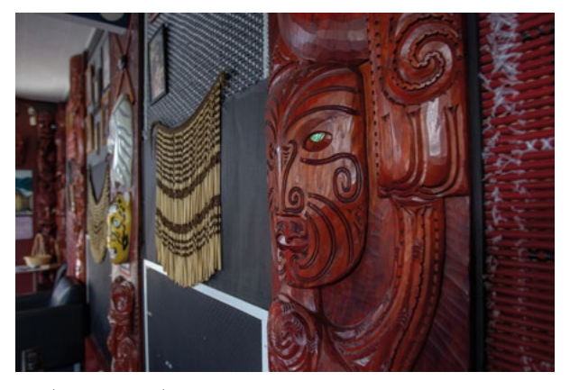
Te Tahawai Marae, Pakuranga.