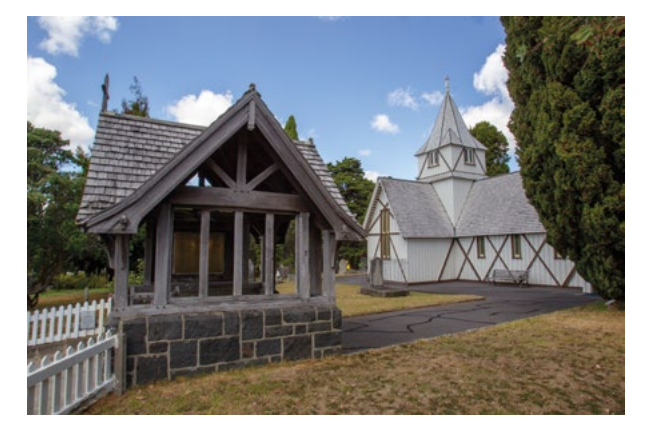
All Saints Anglican Church, Howick.