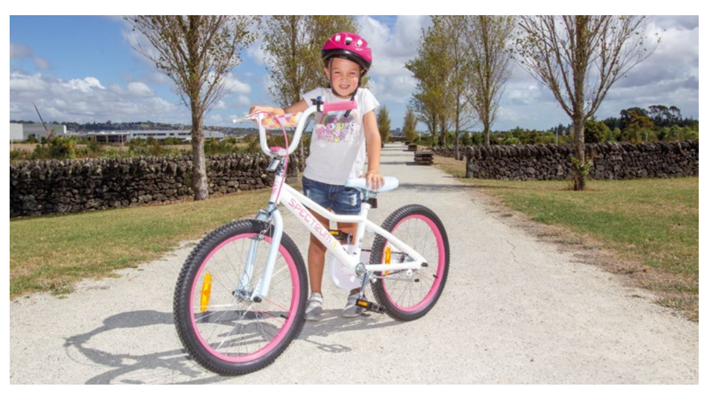
Barry Curtis Park, Flat Bush.