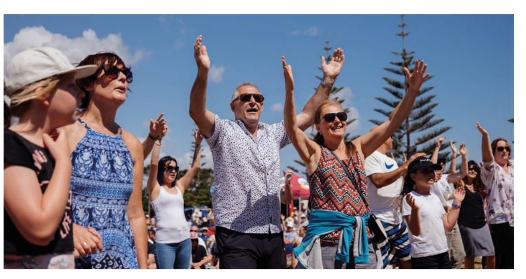
Music in Parks at Lloyd Elsmore Park.

• We are committed to carrying out the following key initiatives to achieve these goals and will continue to look for other opportunities as they arise.