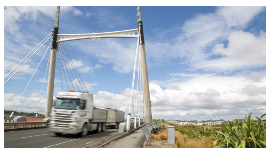
Te Uho Nikau Bridge, Flat Bush.