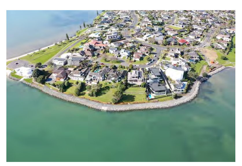
Bramley Drive Seawall

The renewal of the seawall and boat ramp at Bramley Drive Reserve has now been completed. Design work has now commenced for the Howick Beach seawall.