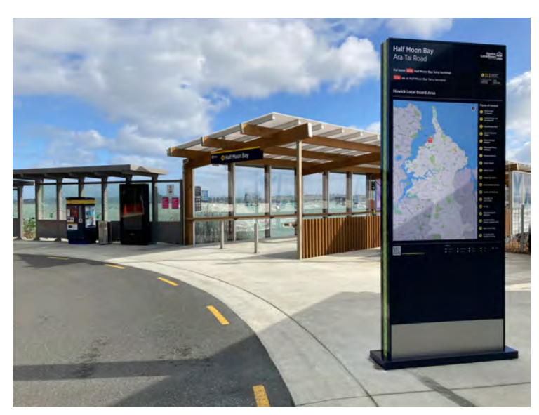
Halfmoon Bay Plinth