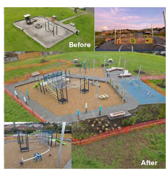
Earnslaw Park Playground

The toilet blocks at Grangers Point, Roger Park and Ara Tai Esplanade were also refurbished