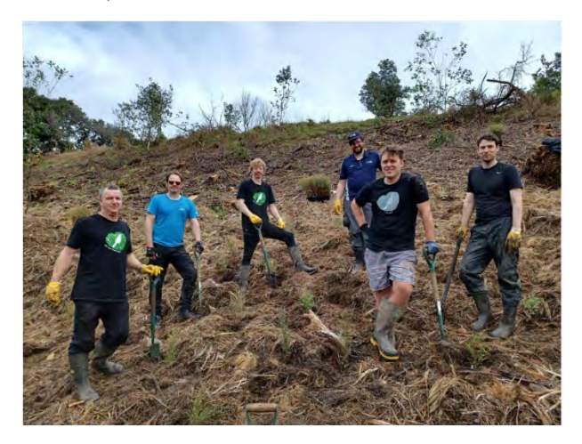
Volunteers at of the Te Naupata Reserve planting days