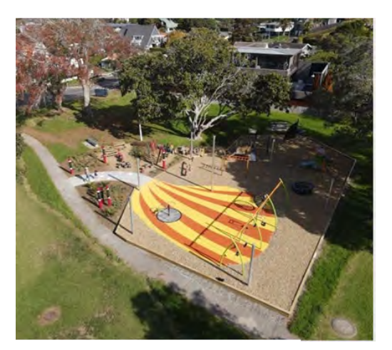
Cockle Bay Playground

As a result of the Emergency Budget 2020/2021, there was a reduction in the board's budget, the Howick Local Board prioritised keeping our community buildings dry and warm and our parks safe and functional. An example of this was at the beginning of the term, there were 20 playgrounds with modules or items that had reached the end of their lives resulting in portions of the playground unavailable for use for our community. Instead of doing wholesale renewals of the play space, it was decided where practical only to replace modules such as slides, swings and spinners where the balance of the playground had a reasonable life left. Playgrounds such as Kilimanjaro, Cockle Bay and Earnslaw Park required a whole renewal.