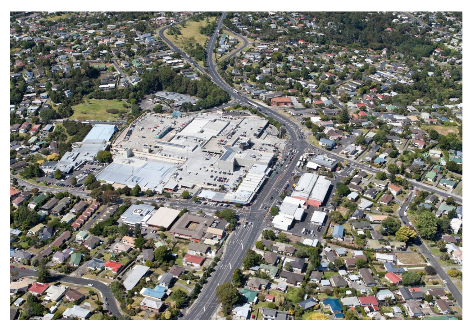
Glenfield Town Centre.

The Auckland Unitary Plan enables the growth of both the commercial area of Glenfield town centre as well as the surrounding residential area. The Business - Town Centre Zone is at the core of the area and is surrounded by high density and medium density residential zones. This enables significant business and residential growth in future.