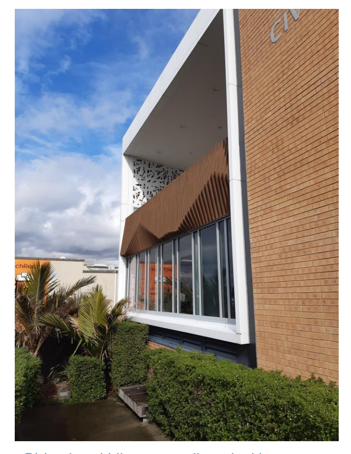
Birkenhead Library - reoil vertical louvres (fins)