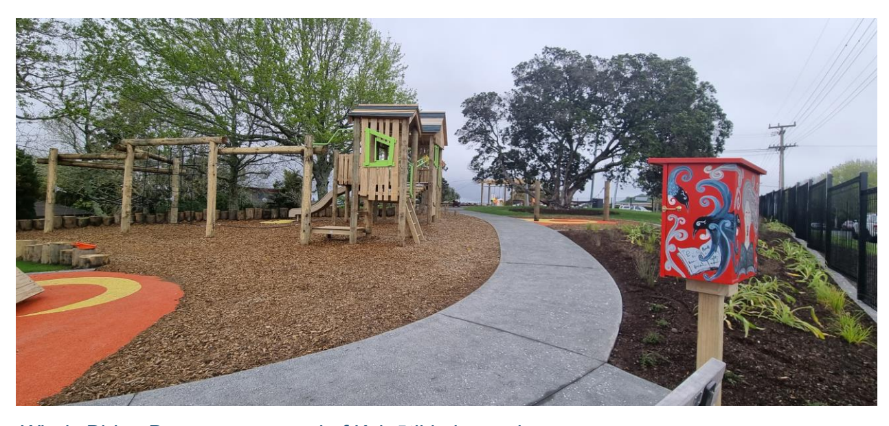
Windy Ridge Reserve - renewal of Kaipātiki play and sunsmart priorities