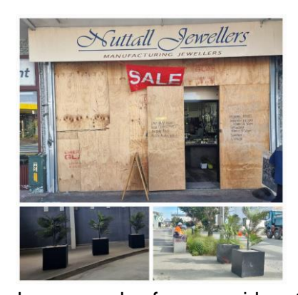
Planter box examples for ram raid protection