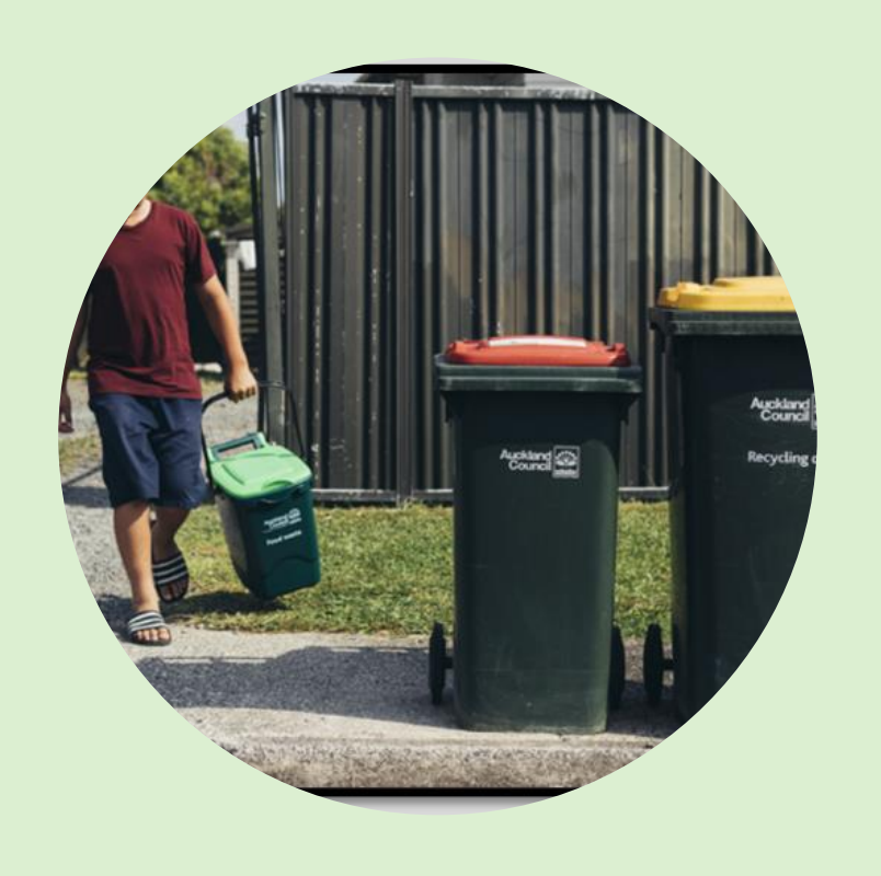
3. Put bin out for collection