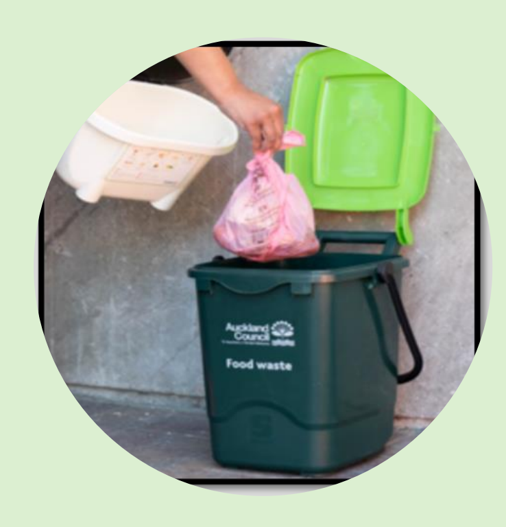
2. Empty food scraps into kerbside bin