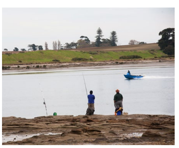
\label{thm:manukau} \mbox{Manukau Harbour continues to attract thousands of visitors and its coastline provides many popular fishing spots.}