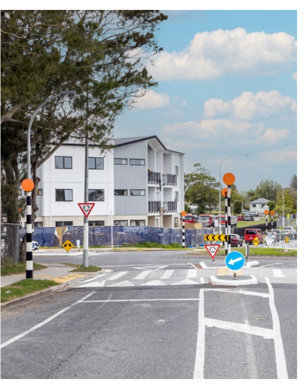
Rowandale Avenue's roundabout has slowed traffic in the area.