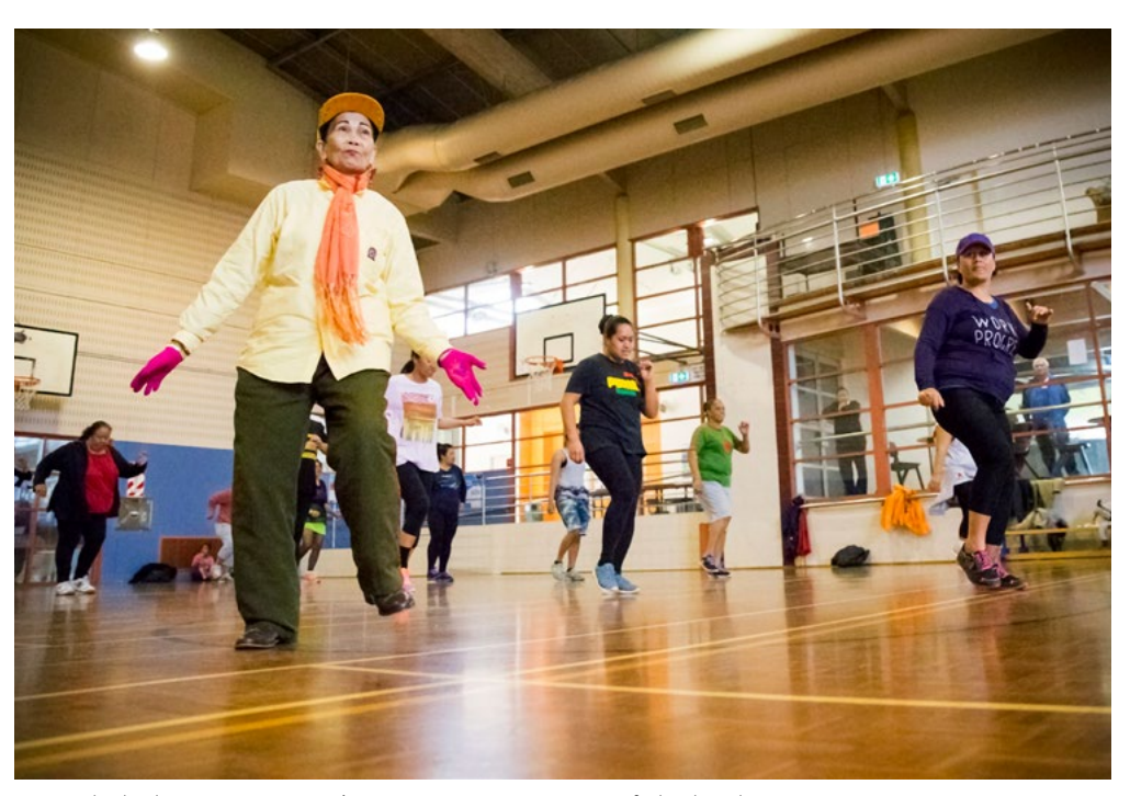
Te Matariki Clendon Community Centre's many programmes are a magnet for local residents.

We are committed to carrying out the following key initiatives to achieve these goals, and will continue to look for other opportunities as they arise.