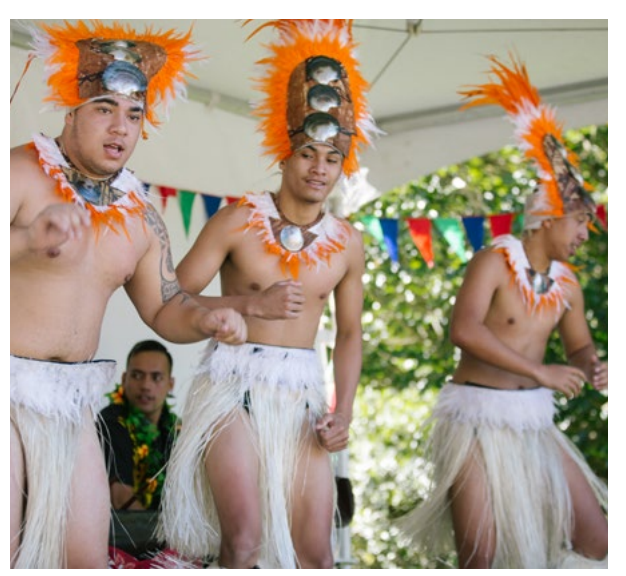
Pasifika dancers entertain at the Puhunui Stream Challenge.