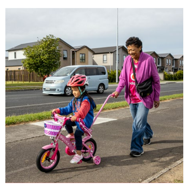
Nana and tamariki.