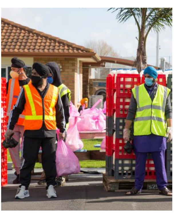
The area's Sikh community helped thousands of families with food parcels during COVID-19 restrictions.