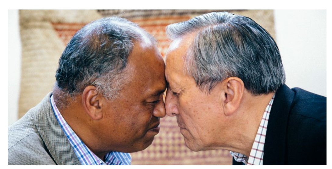
We are committed to our Treaty-based obligations and to Māori participation and development.

(Mataawaka refers to Māori who live in Tāmaki Makaurau and who are not in a mana whenua group.)