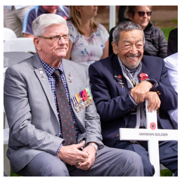
Cultures came together at Armistice Day commemorations in Manurewa.