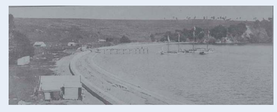
The bay looking towards where The Landing is now, early 20th Century. It shows Ngāti Whātua's village and the sewer pipe built in front of it. Ref. 7-A2929.