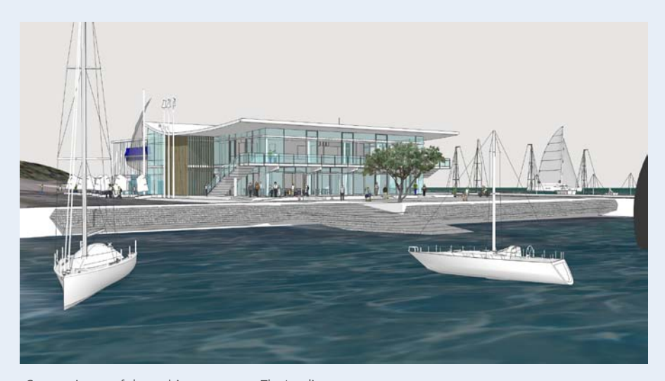
Concept image of the multi-use centre at The Landing

The development of the Akarana Marine Sports Centre on the site of the current Royal Akarana clubhouse has been a long-held aspiration of the Royal Akarana Yacht Club, which was established in 1895. This development, now led by Akarana Marine Sports Charitable Trust with Royal Akarana Yacht Club and others as tenants, will create a lively multi-use centre as a hub for marine activity, events and education. The planned completion date is 2018.