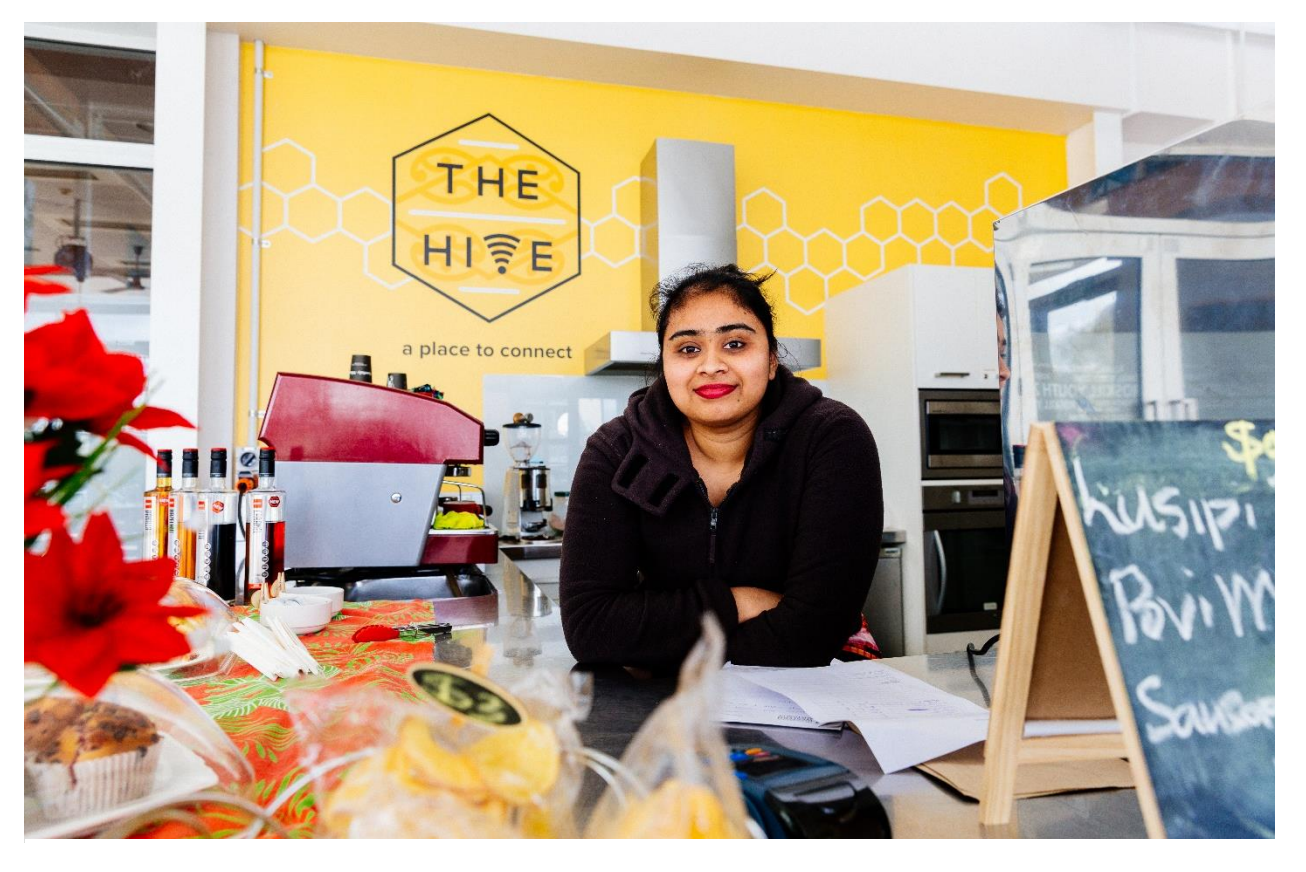
Figure 7 The Hive at Roskill Youth Zone

Share a photo of your favourite low carbon business or product on social media: www.facebook.com/livelightlyakl/ www.livelightly.nz #puketapapalivelightly