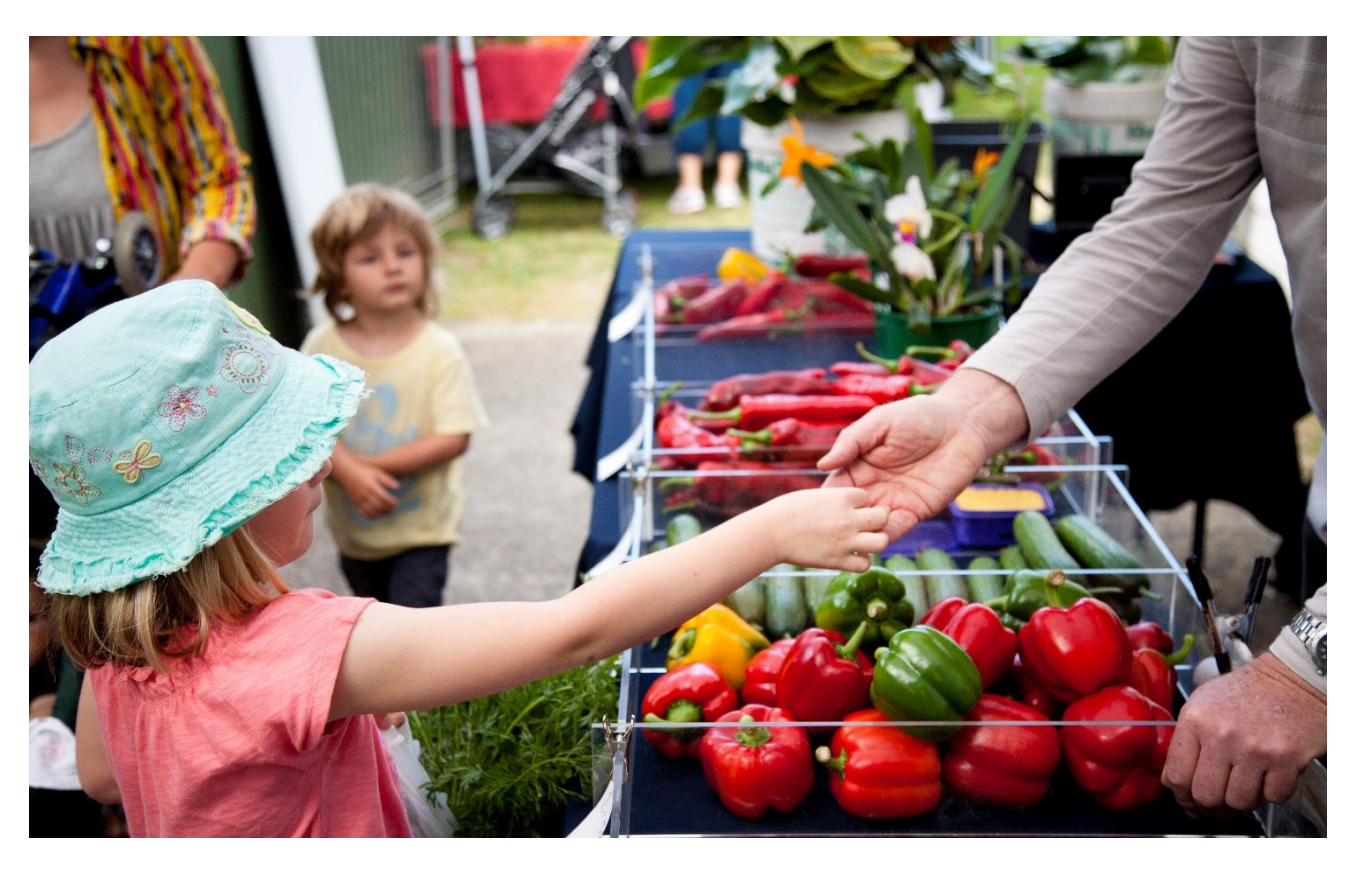
Figure 6 Shop local and in season

Share a photo of your favourite low carbon business or product on social media: www.facebook.com/livelightlyakl/ www.livelightly.nz #livelightlyPuketāpapa