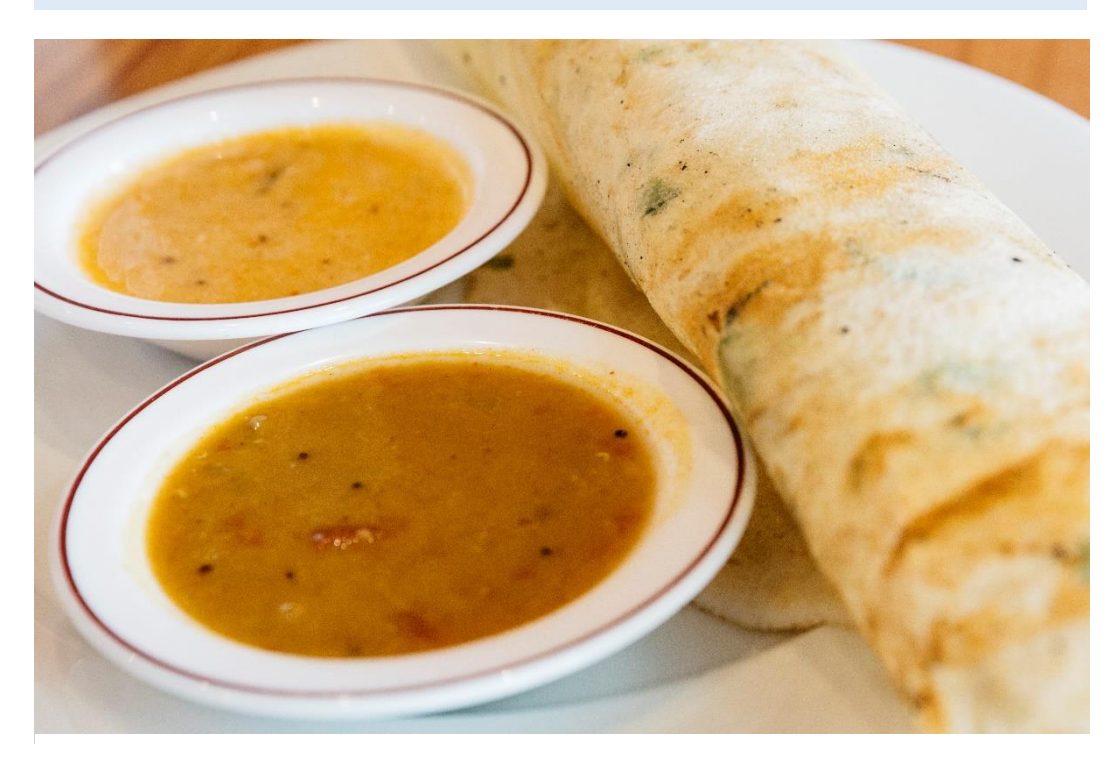
Figure 5 Try a plant based meal e.g. Masala Dosa and Dhal

Share a photo of your vege garden, local, seasonal, plant based meal or compost system on social media: www.facebook.com/livelightlyakl/ www.livelightly.nz #puketapapalivelightly