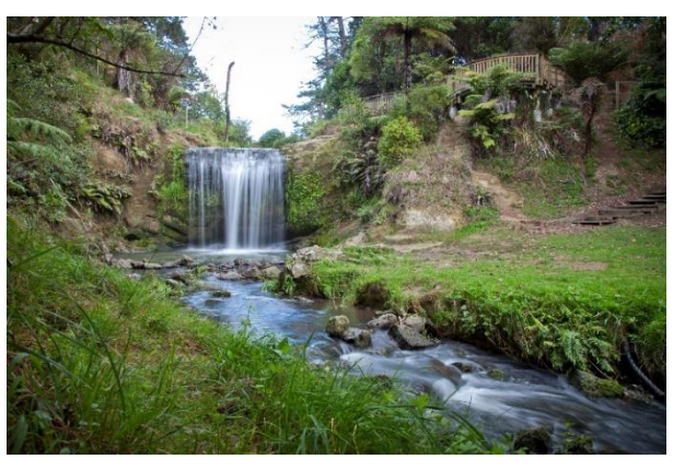
Figure 9 and 10 River naturalisation work at the Walmsley/Underwood project, and Oakley Creek Te Auaunga Waterfall