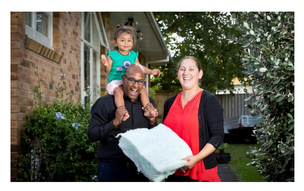
Figure 3 Insulate for a warmer, drier, healthier home and save money on power bills