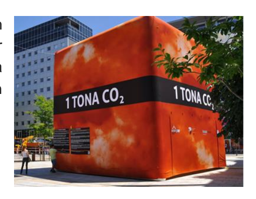
Figure 1 Image source Energap - Visualising One Tonne of CO<sub>2</sub> Emissions

The Auckland Low Carbon Action Plan sets out detailed targets and actions to show how Puketāpapa can support achieving Auckland's goal of a 40 per cent reduction in greenhouse gas emissions by 2040 [based on 1990 levels]. For Puketāpapa residents, this will mean reducing their carbon footprints from 6.7 tonnes of CO₂e emissions per person, to 3 tonnes per person per year by 2040³. This equates to a 161 kg reduction in carbon emissions per person per year for the next 23 years.