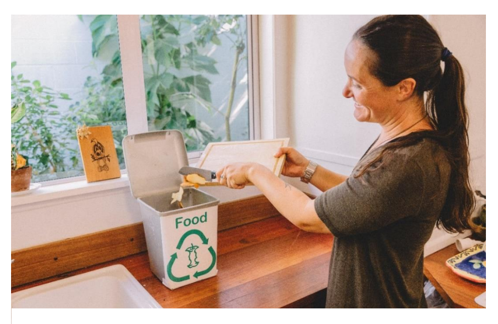
Figure 4 Reduce food waste and compost your scraps

http://temp.aucklandcouncil.govt.nz/EN/planspoliciesprojects/plansstrategies/theaucklandplan/Documents/lowcarbonauckactionplanfullversion.pdf