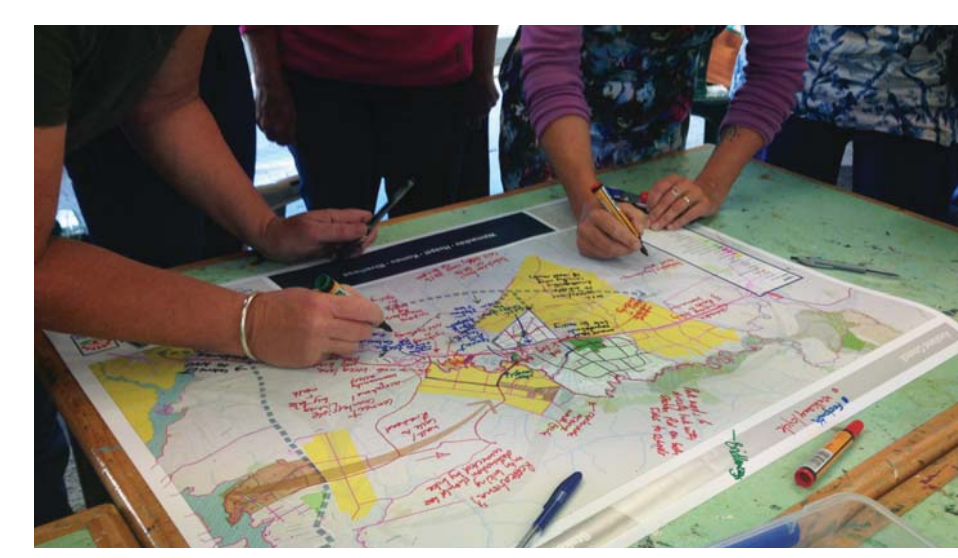
Targeted Consultation workshop, May 17th 2016, Kumeu Arts Centre.

Their feedback was then collated and the draft routes updated prior to wider community engagement. Comments beyond the scope of this project were collated and forwarded to the appropriate agency i.e Auckland Transport, New Zealand Transport Agency, Watercare.