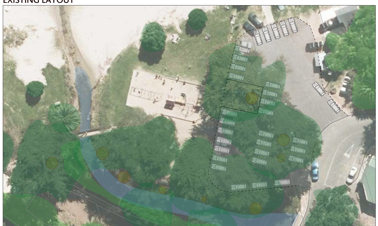
32 parks, 1,105m <sup>2</sup>, 25m street frontage