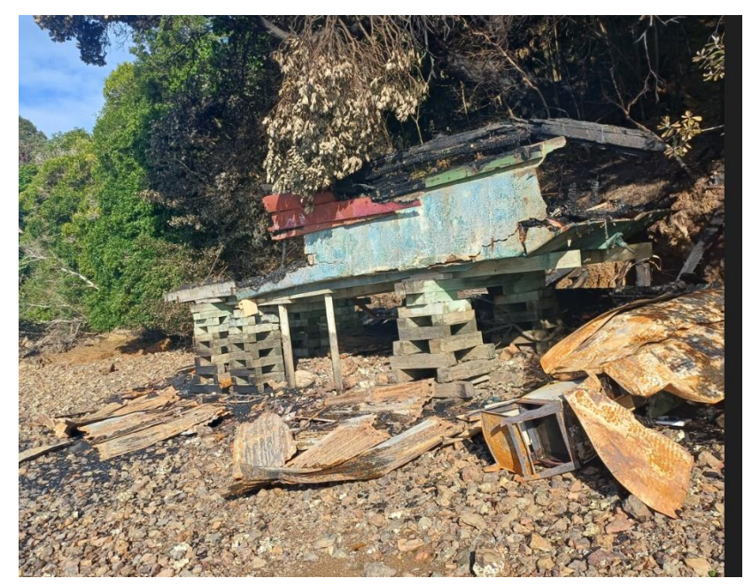
Additional vessel location