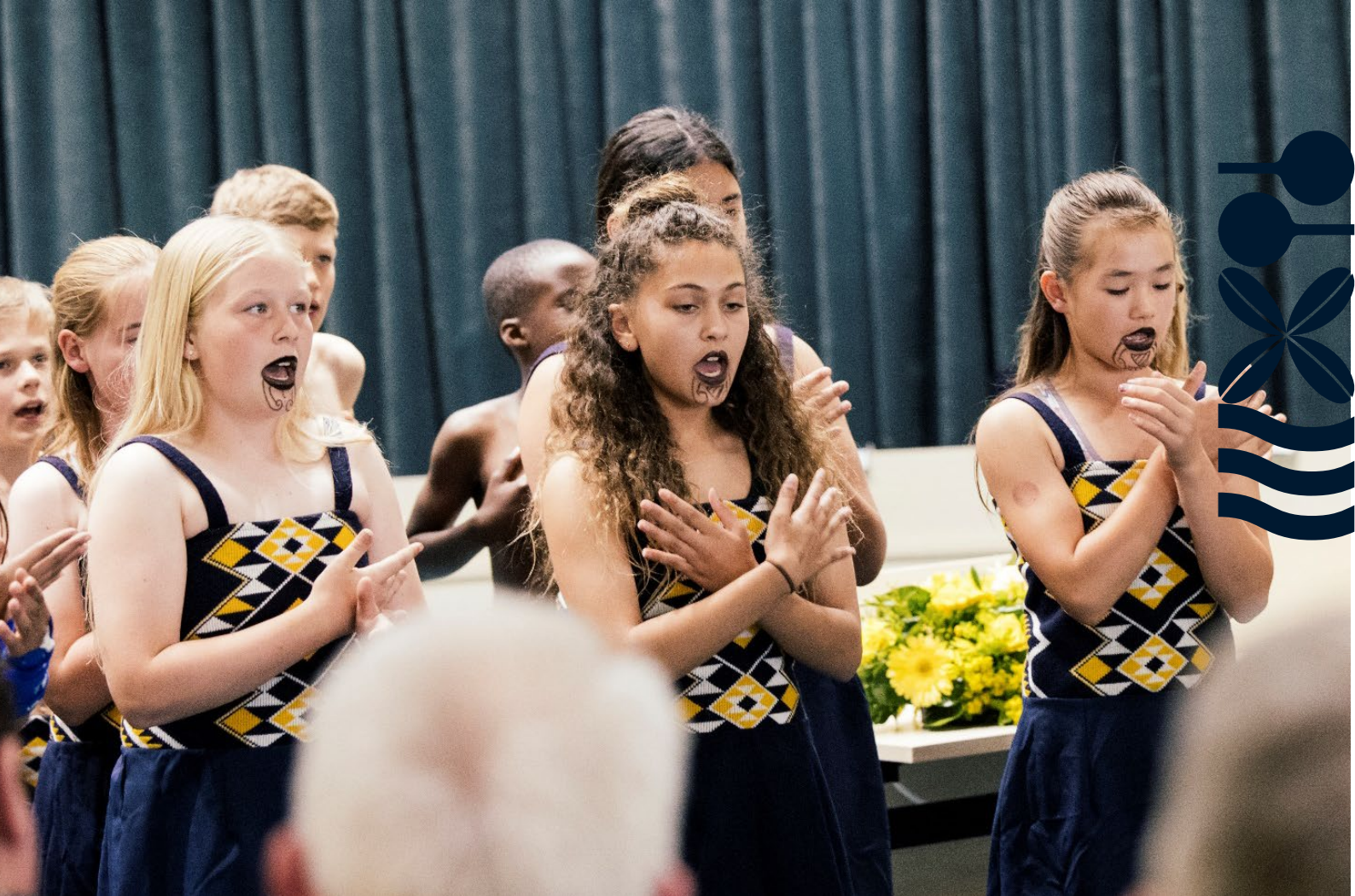
Parnell School kapa haka, Waitematā Local Board inauguration ceremony