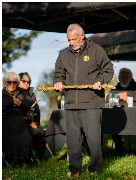
Ngāti Whātua Ōrākei, Outhwaite Park blessing