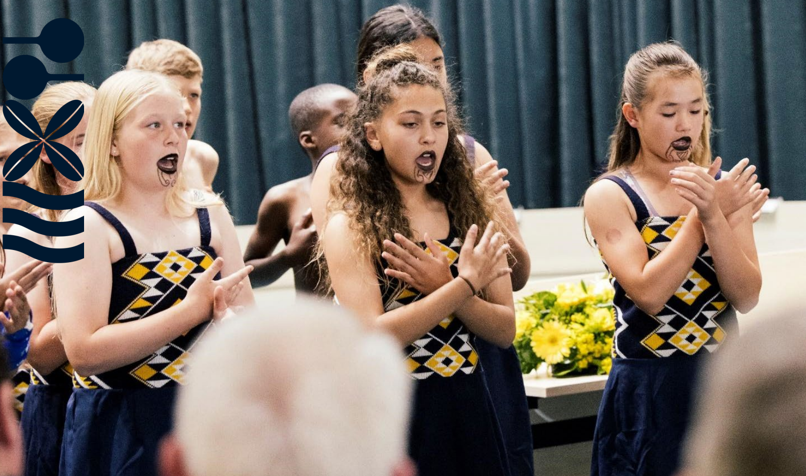
Parnell School kapa haka, Waitematā Local Board inauguration ceremony