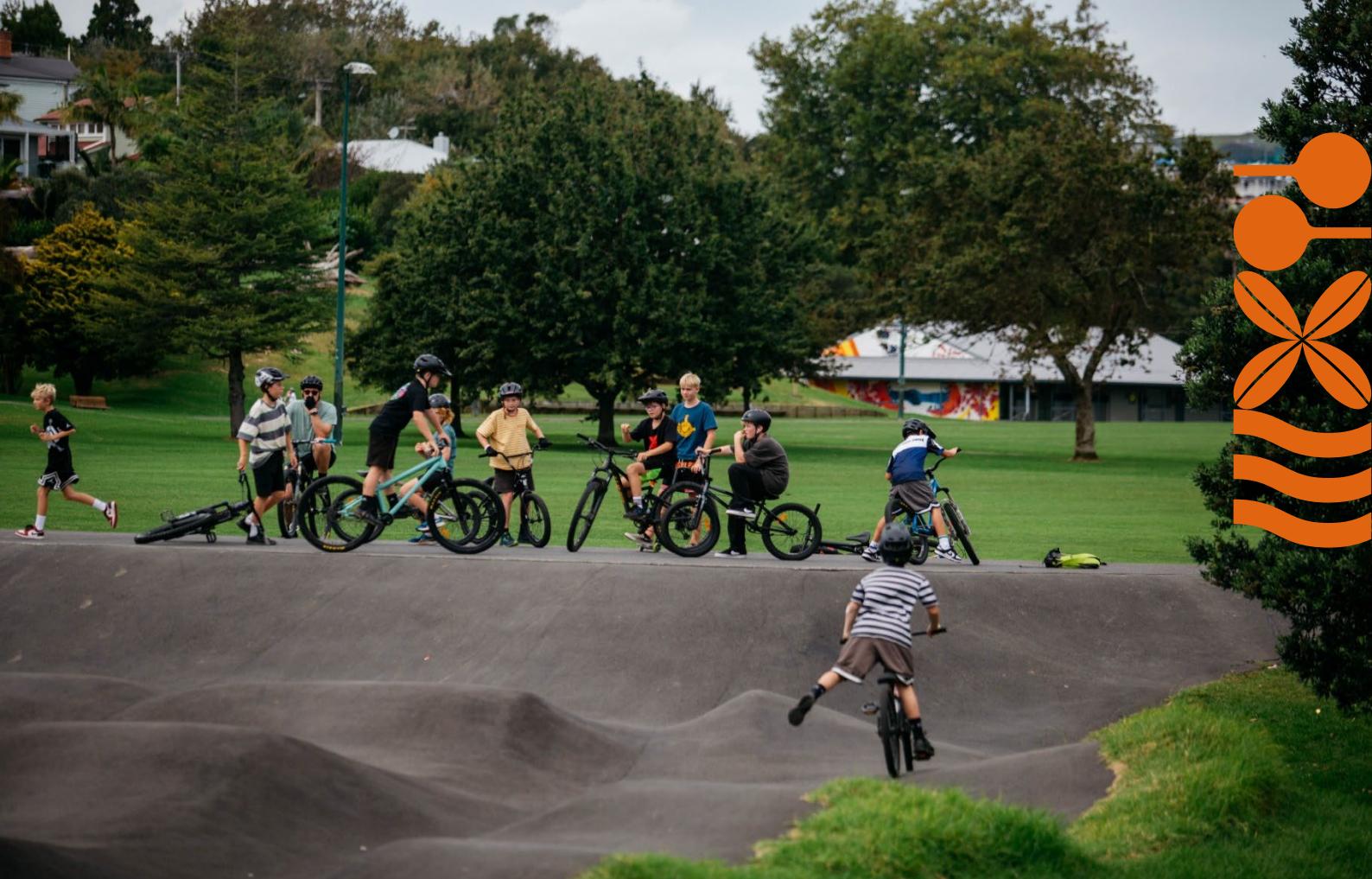
Pump track, Grey Lynn Park