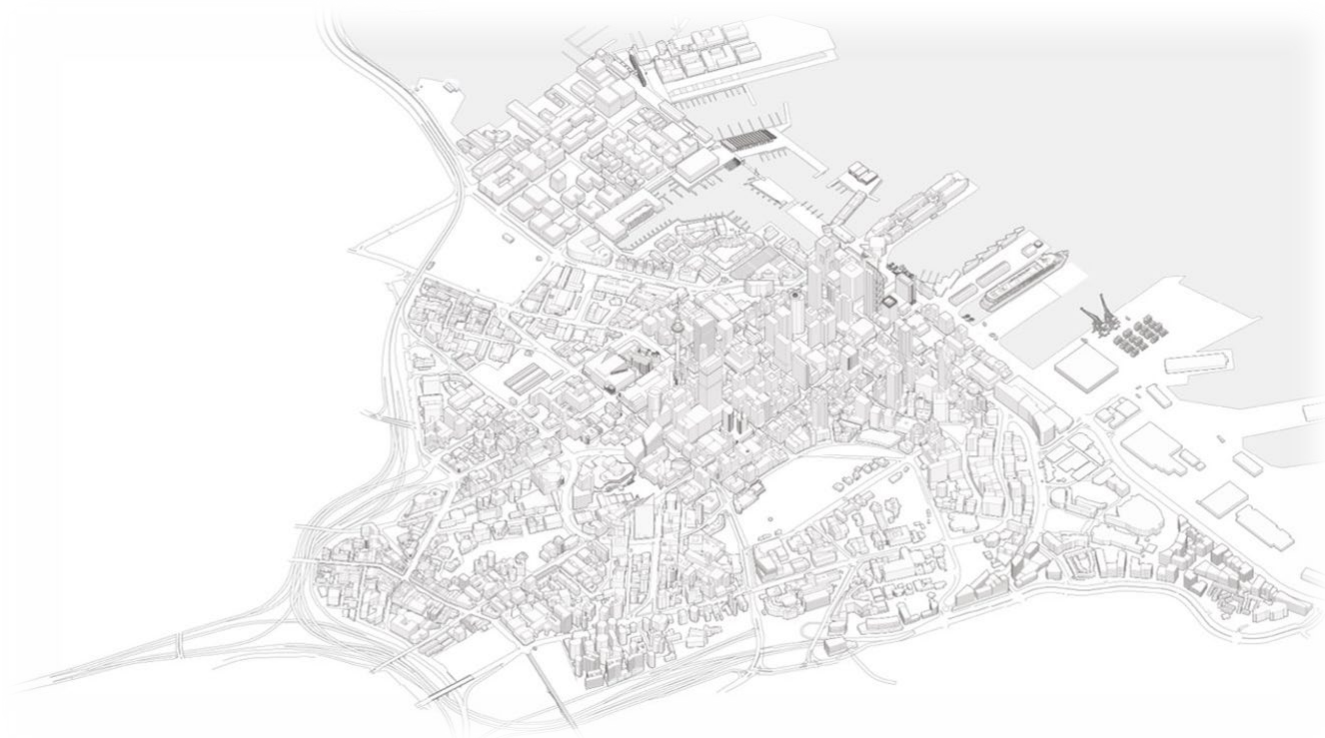
City Centre Master Plan

Te Toangaroa / Quay Park is a major future urban redevelopment opportunity for Ngāti Whātua Ōrākei, in accordance with their own masterplan principles. See the concepts of Te Tōangaroa Masterplan, produced by Ngāti Whātua Ōrākei: Te Tōangaroa Masterplan conceptual framework (PDF) . We will work with the wider council group to integrate future infrastructure planning and connections to support the realisation of their vision including aligning the delivery of key connections.