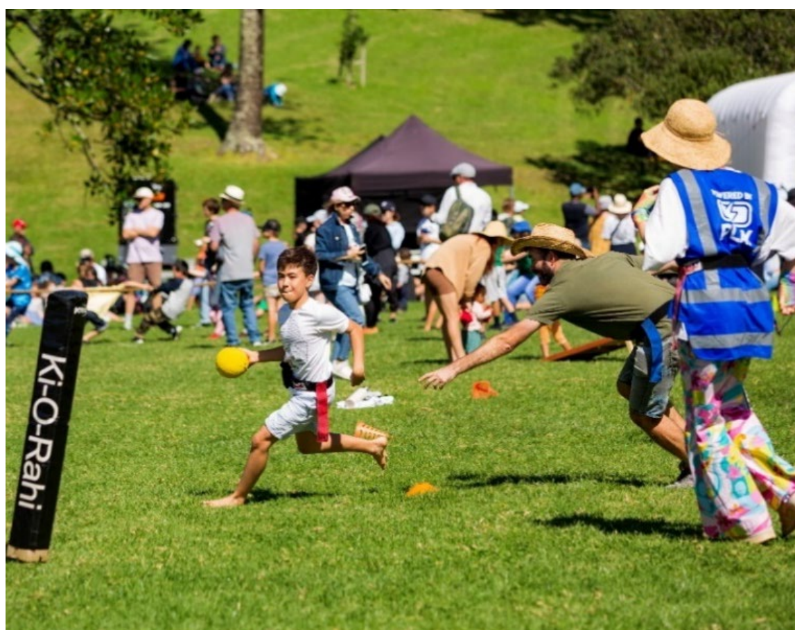
Play Festival, Western Park