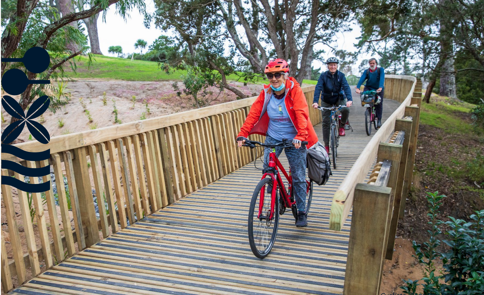
Cyclists, Cobs Bay Reserve