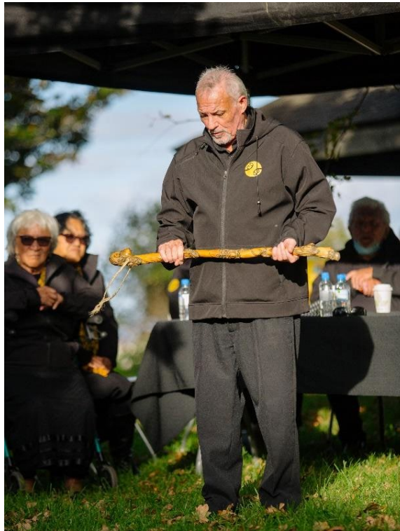
Ngāti Whātua Ōrākei, te hikinga o te tapu i Te Papa Rēhia o Outhwaite