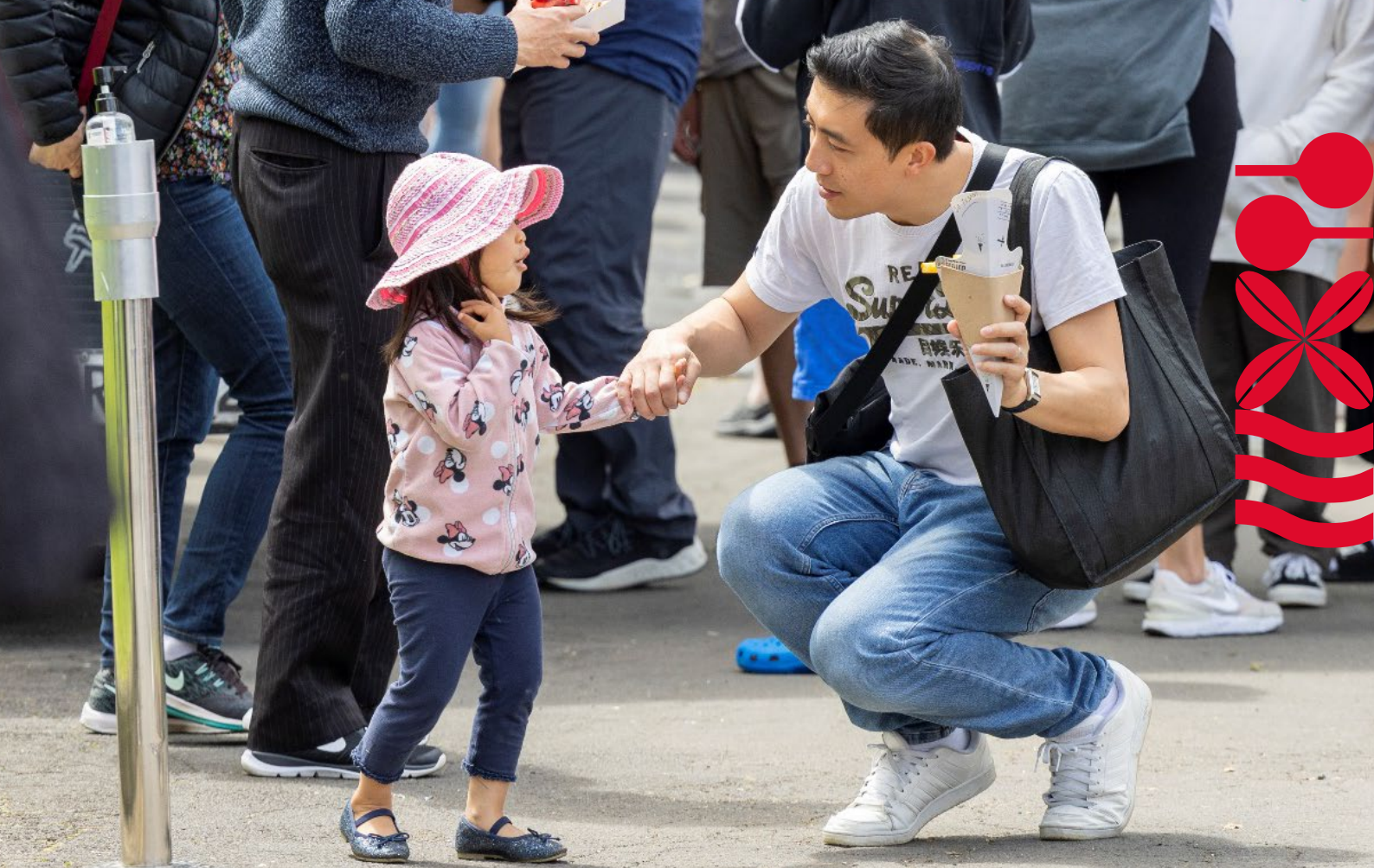
Parnell Festival of Roses, Dove-Myer Robinson Park