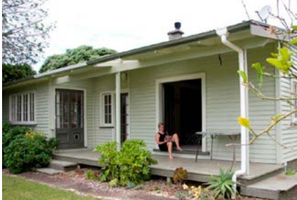
View of front veranda