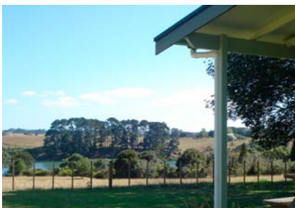
View from back veranda