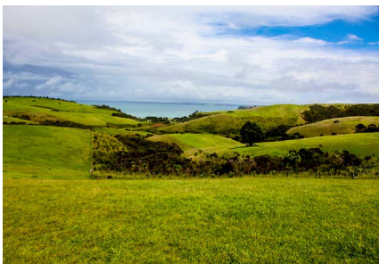
Wide open spaces in the farming areas