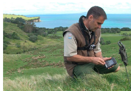
Conservation work on the park