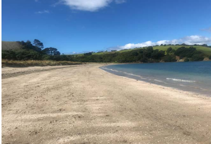
Te Haruhi Bay