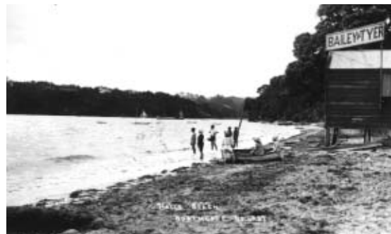
Hall's Beach